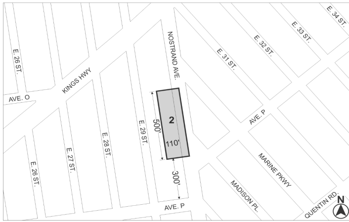
Map 2 – [date of adoption]

Mandatory Inclusionary Housing Area see Section 23-154(d)(3) Area 2 — [date of adoption] — MIH Program Option 1 and Option 2