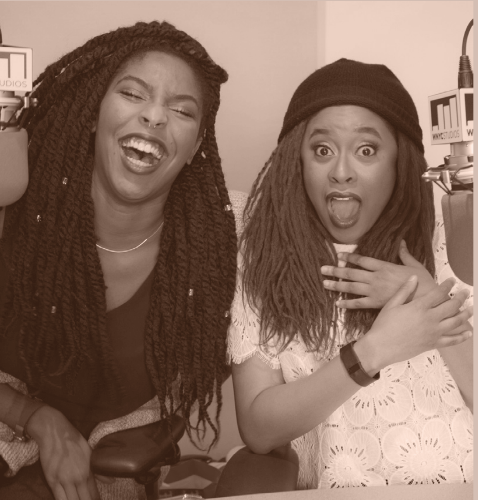
Phoebe Robinson and Jessica Williams of 2 Dope Queens, a WNYC Studios production.