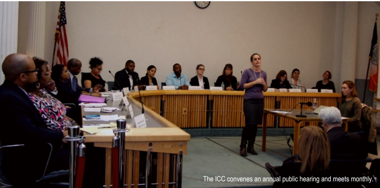
The ICC convenes an annual public hearing and meets monthly.