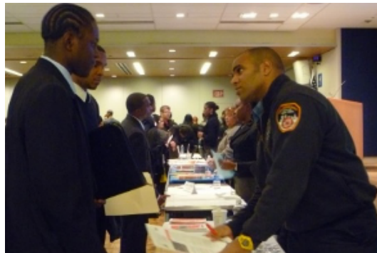
ICC members engage youth to better understand young people for purposes of providing services.

Department of Youth and Community Development (DYCD) - DYCD's Community Needs Assessment (CNA) process engages stakeholders through a process where feedback is collected from community members in Neighborhood Development Areas (NDA) about the programs and services needed in their community. This information is used to develop program priorities and allocate funds for the federal Community Services Block Grant (CSBG). DYCD continues using data to inform program design/success after CSBG funds are allocated as part of a continuous quality improvement process.