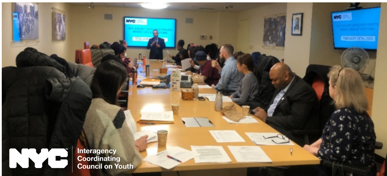
ICC members meet regularly to collaborate, provide support, and share best practices.