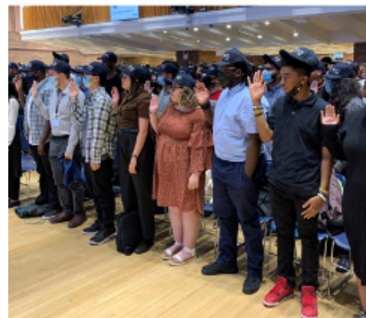
DYCD/NYPD SYEP partnership placed over 800 youth with officer and mentors during the summer.

Department of Youth and Community Development (DYCD) - As part of a multiagency partnership between DYCD, the New York Police Department (NYPD), the Office of Chief Medical Examiner (OCME), and the Department of Health and Mental Hygiene (DOHMH), the city is launching the Handle with Care (HWC) initiative, an agreement that outlines a communication pathway for NYPD and OCME to alert DOE and DYCD when a young person is at the scene of a traumatic event. DOE and DYCD will alert the principal and/or program that the participant should be "handled with care." The initiative will launch with a pilot in the Bronx and will eventually expand to include all DYCD-funded programs. DYCD continues to collaborate with its partners to place 100,000 Summer Youth Employment (SYEP) participants in various city-based agencies and community-based locations.