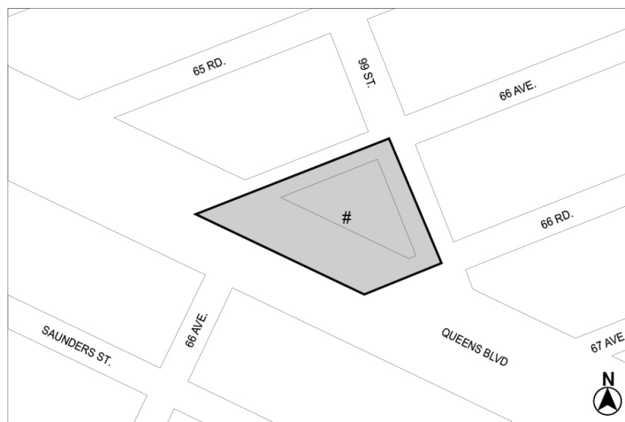
Mandatory Inclusionary Housing Program Area see Section 23-154(d)(3) Area # — [date of adoption] — MIH Program Option 1 and Option 2