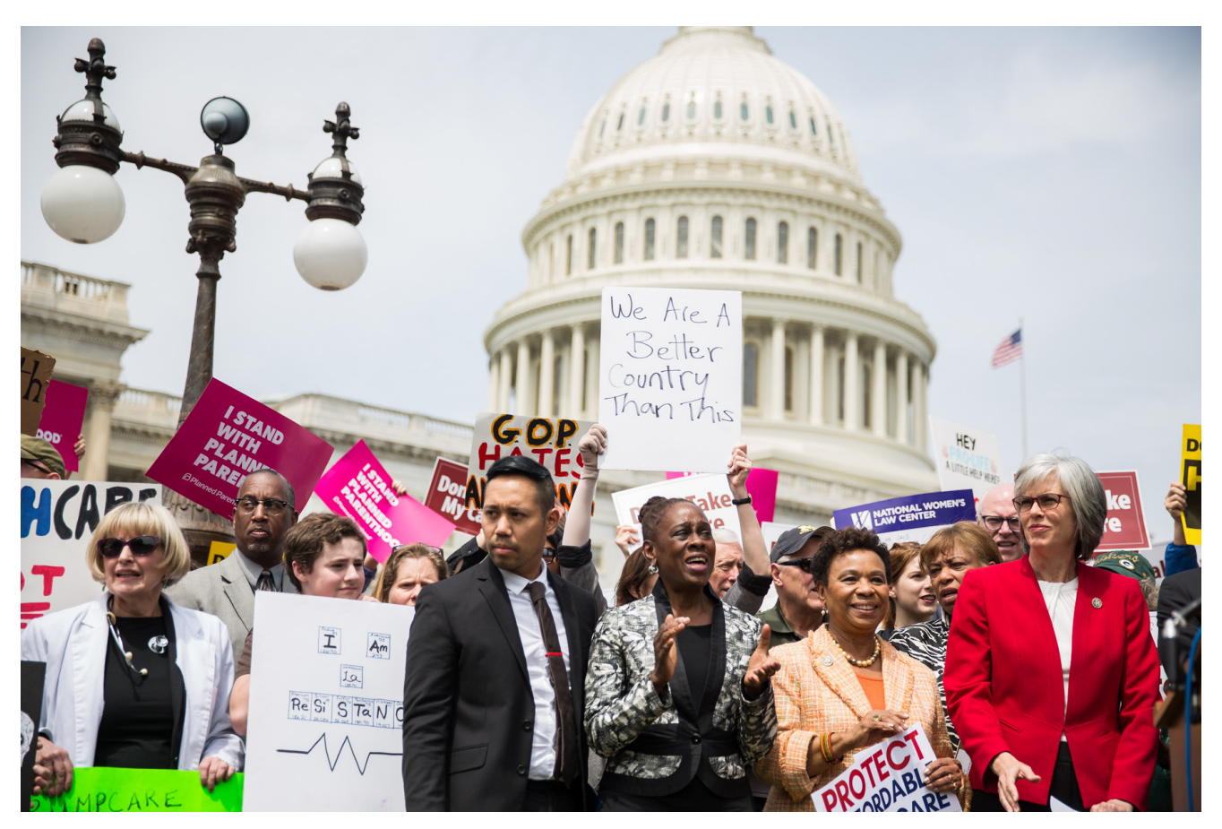
First Lady Chirlane McCray joins hundreds of people and lawmakers like Senator Chuck Schumer of New York and Bernie Sanders of Vermont to denounce the Republicans' Obamacare repeal bill at a rally with hundreds of people outside the U.S. Capitol Building in Washington D.C. as the House of Representatives prepared to vote in May, 2017.

Progress to Date: The Cities Thrive Coalition, spearheaded by the First Lady of New York City, brings together some of our nation's best thinkers on mental health to develop innovative programs, discuss best practices, create an ongoing conversation and push our federal partners to join us in making mental health and substance misuse a top priority. In one year, the Coalition has recruited and mobilized nearly 200 cities, representing all 50 states, Washington, D.C. and Puerto Rico, to advocate for a stronger, better funded and more integrated behavioral health system. The Coalition hosts monthly calls, convenes National Days of Action, writes letters and makes visits to Congress and the Administration, and leads e-advocacy by engaging social media networks.