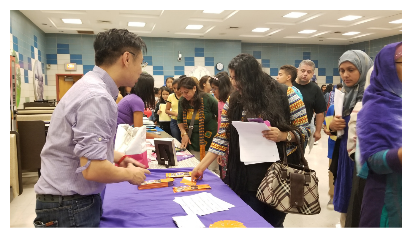
A member of the Thrive Outreach Team shares information about the benefits of NYC Well at a Back-to-School event in August, 2017

Progress to Date: Since its launch in October 2016, NYC Well has received nearly 250,000 calls, texts and chats, exceeding initial projections and expectations by almost 25 percent.