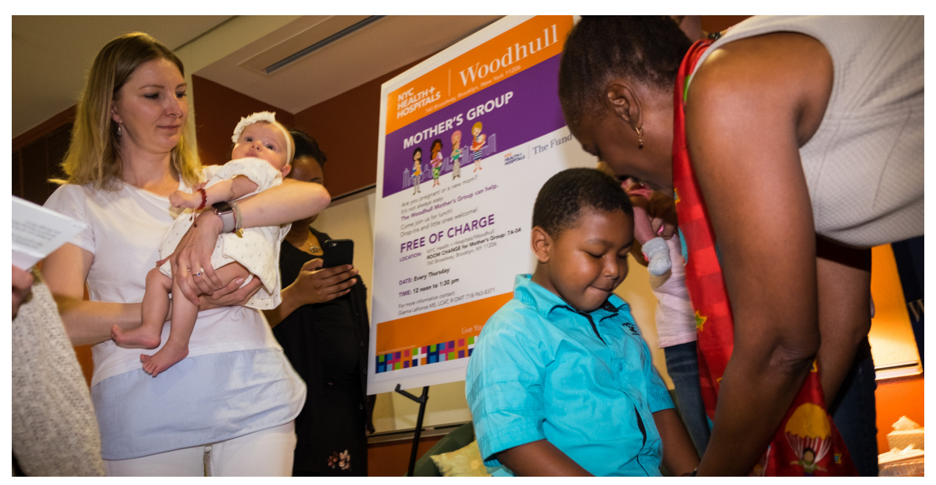
First Lady Chirlane McCray announced that all NYC Health +Hospitals locations will offer free maternal depression screenings for pregnant women and mothers at the Woodhull Hospital in Brooklyn, NY in May, 2017.

Depression in women during and immediately following pregnancy is common, with more than 10,000 cases reported in New York City each year. Most women – especially Black and Latina women – do not receive treatment. Foregoing services for maternal depression can have a lifelong negative impact on the health of a mother and her baby. The Greater New York Hospital Association and the New York City Department of Health are leading a collaborative of 30