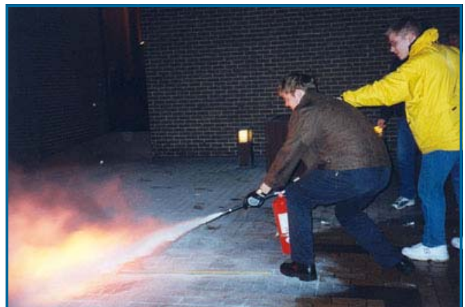
CERT member practices PASSing with a fire extinguisher

Street will be our first challenge. We need to build relationships with public safety personnel across several police precincts and firehouses. This will require a lot of activity, from street fairs to block association meetings. We got our feet wet with National Night Out and a couple of early morning “on calls” during the first taxi disruption, and we feel up to the challenge. For more information on CERT, visit NYC.gov/cert .