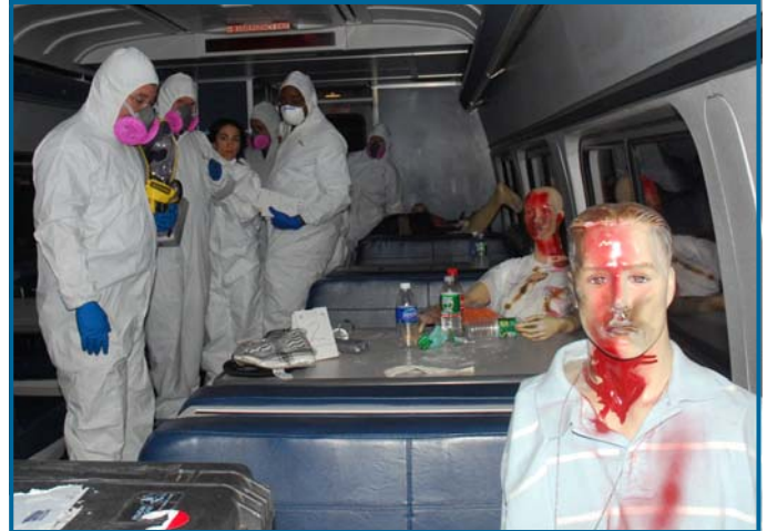
Responders from OCME investigate the scene of the bombing

Penn Station's size and busy environment added various complications to the exercise. In addition to managing substantial pedestrian traffic, players had to navigate real-life obstacles like suspicious packages. Due to the overtones of terrorism,