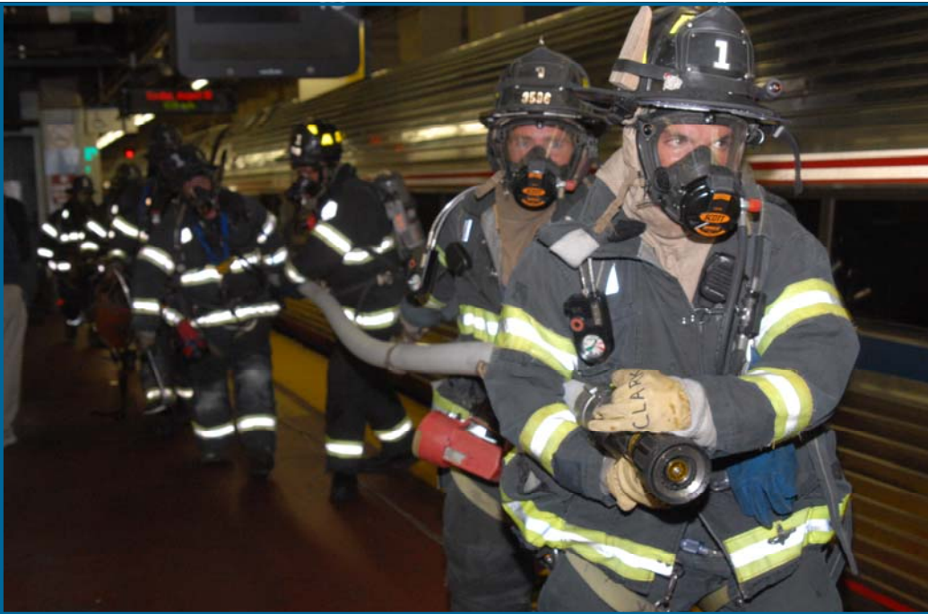
Firefighters stretch a fire hose at a drill in Pennsylvania Station

At 12:01 a.m. on August 26th, a strobe light, acting the part of a fire, pulsed through the dining car of a Washington, D.C., bound train on Pennsylvania Station's track 13. Amtrak security immediately notified first response agencies to the imagined fire, explosion, and injuries. Minutes later a cacophony of sirens eclipsed midtown's Saturday night din as 400 emergency responders converged on Penn Station.