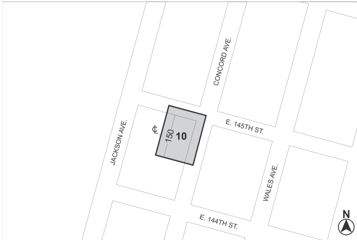
Map 9 - [date of adoption]