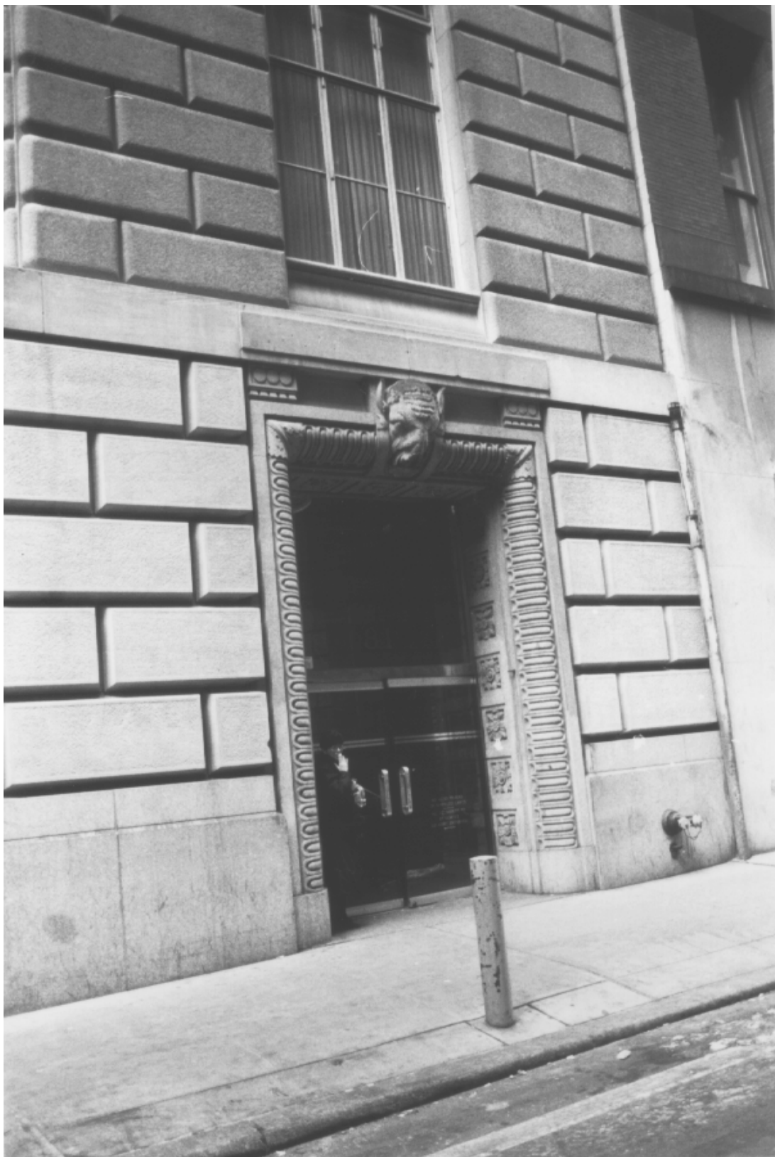
Standard Oil Building, 26 Broadway, Manhattan Entrance at 81 New Street