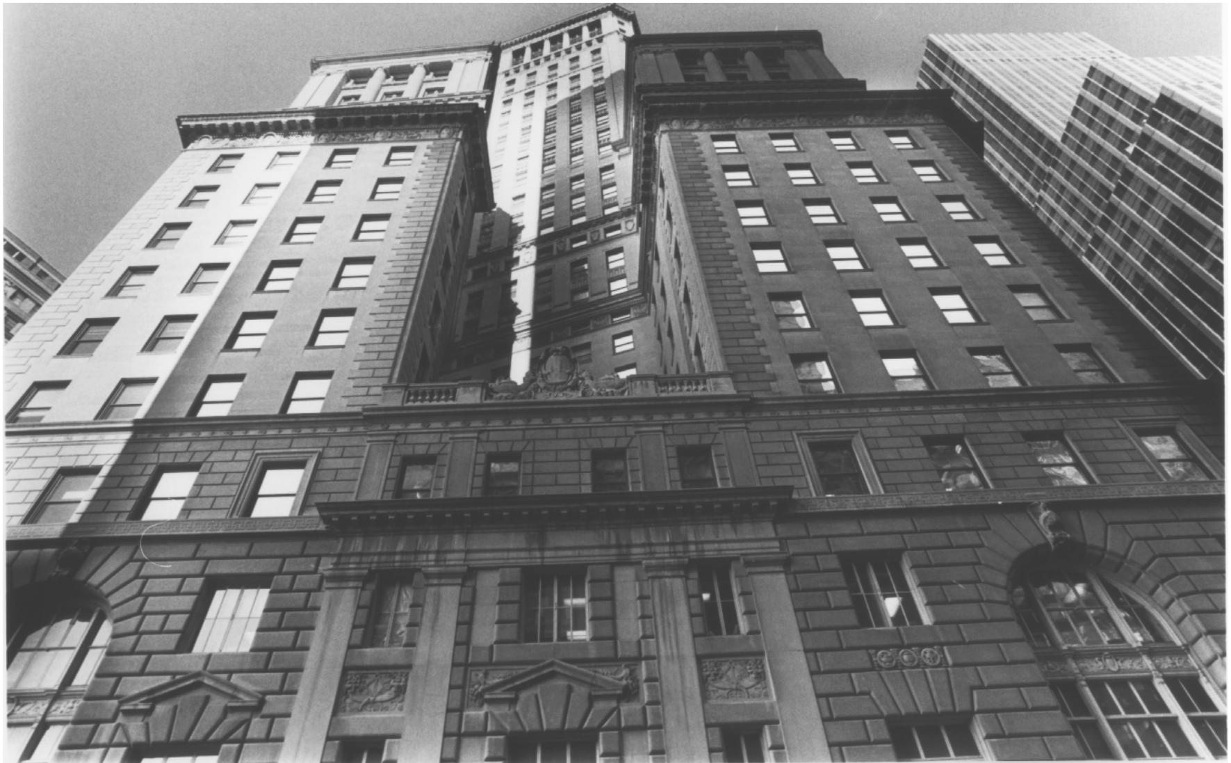
Standard Oil Building, 26 Broadway, Manhattan Beaver Street facade