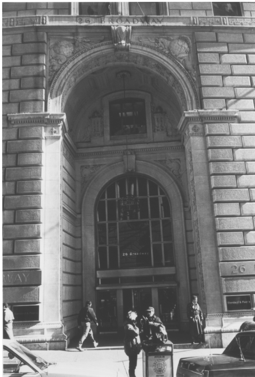
Standard Oil Building, 26 Broadway, Manhattan Main entrance at 26 Broadway