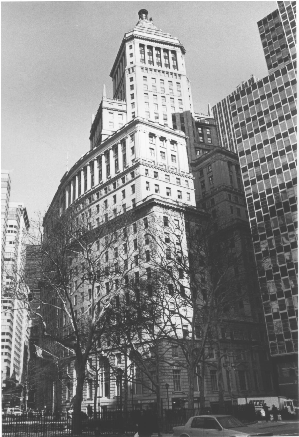
Standard Oil Building, 26 Broadway, Manhattan View from southwest across Bowling Green