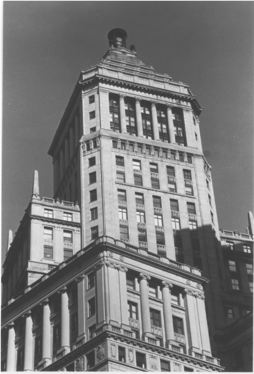
Standard Oil Building, 26 Broadway, Manhattan Upper portion of the tower