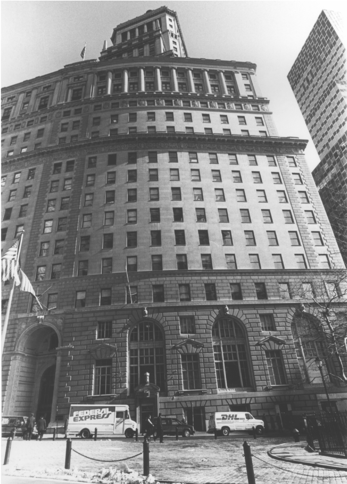
Standard Oil Building, 26 Broadway, Manhattan Southern portion of the Broadway facade.