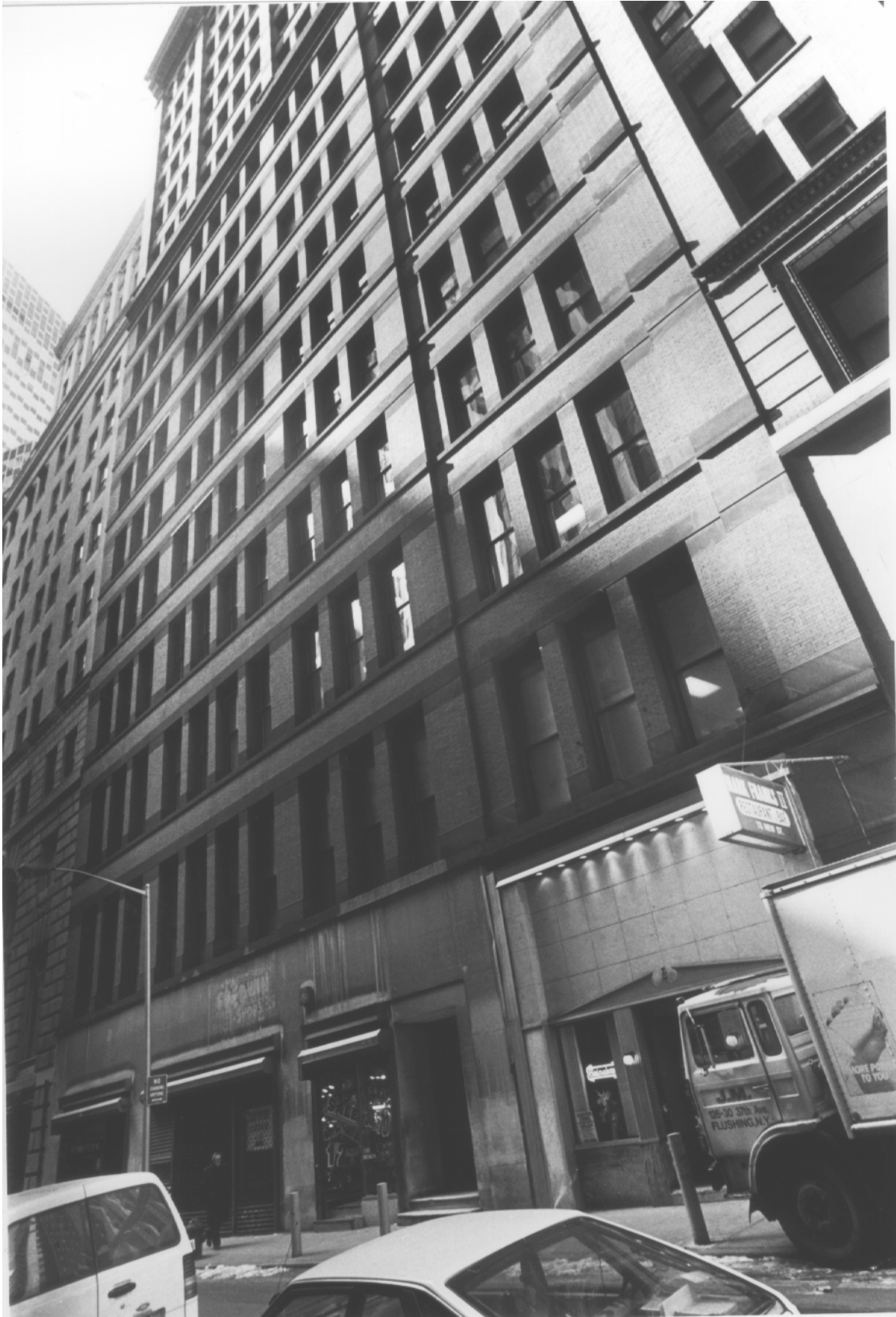
Standard Oil Building, 26 Broadway, Manhattan Northern portion of the New Street facade