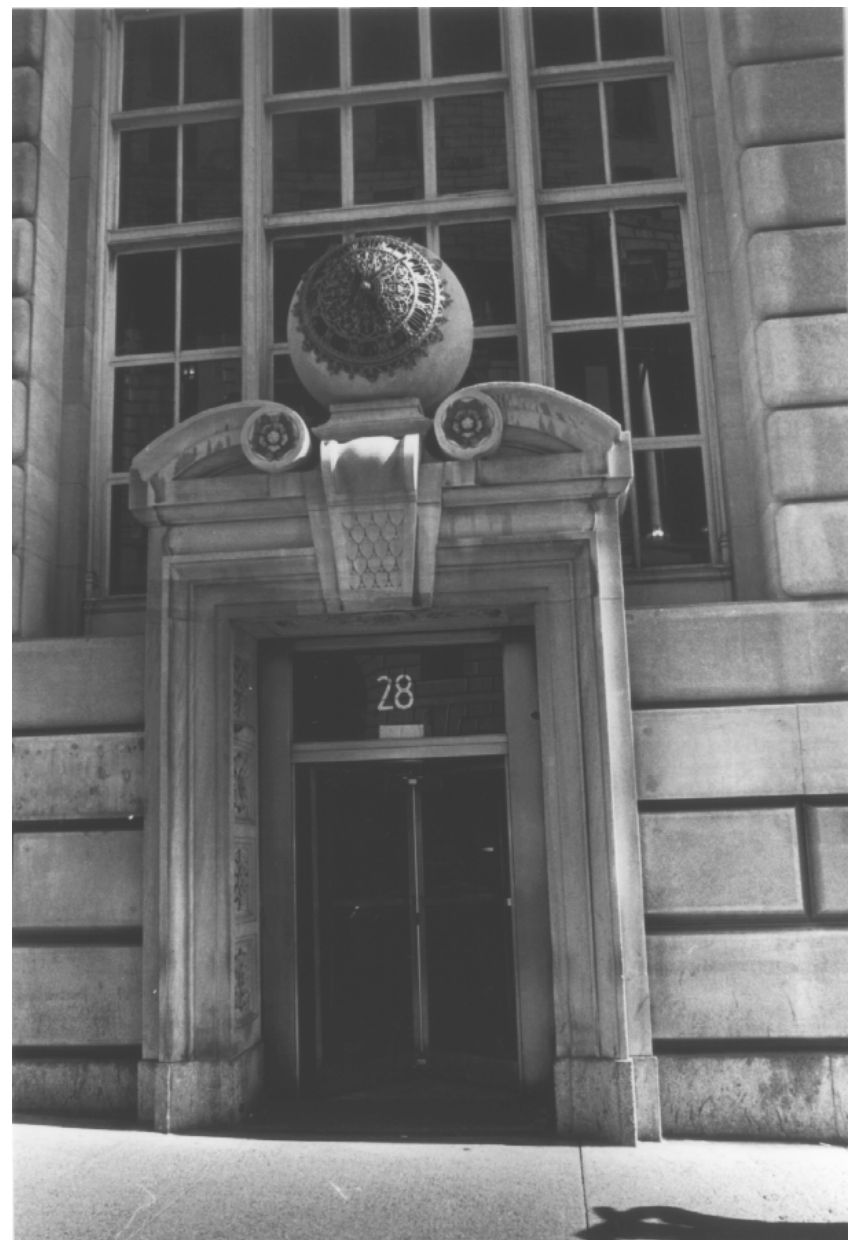
Standard Oil Building, 26 Broadway, Manhattan Secondary entrance at 28 Broadway