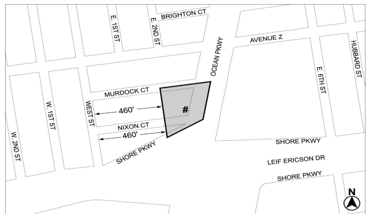
Mandatory Inclusionary Housing Area see Section 23-154(d)(3)