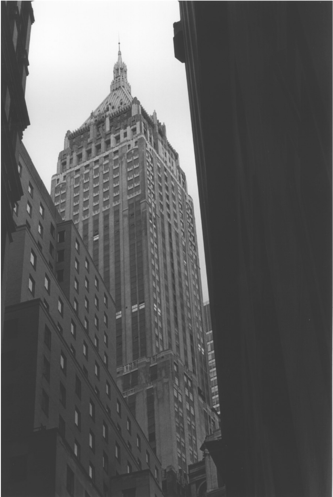
Manhattan Company Building, view of tower from the south