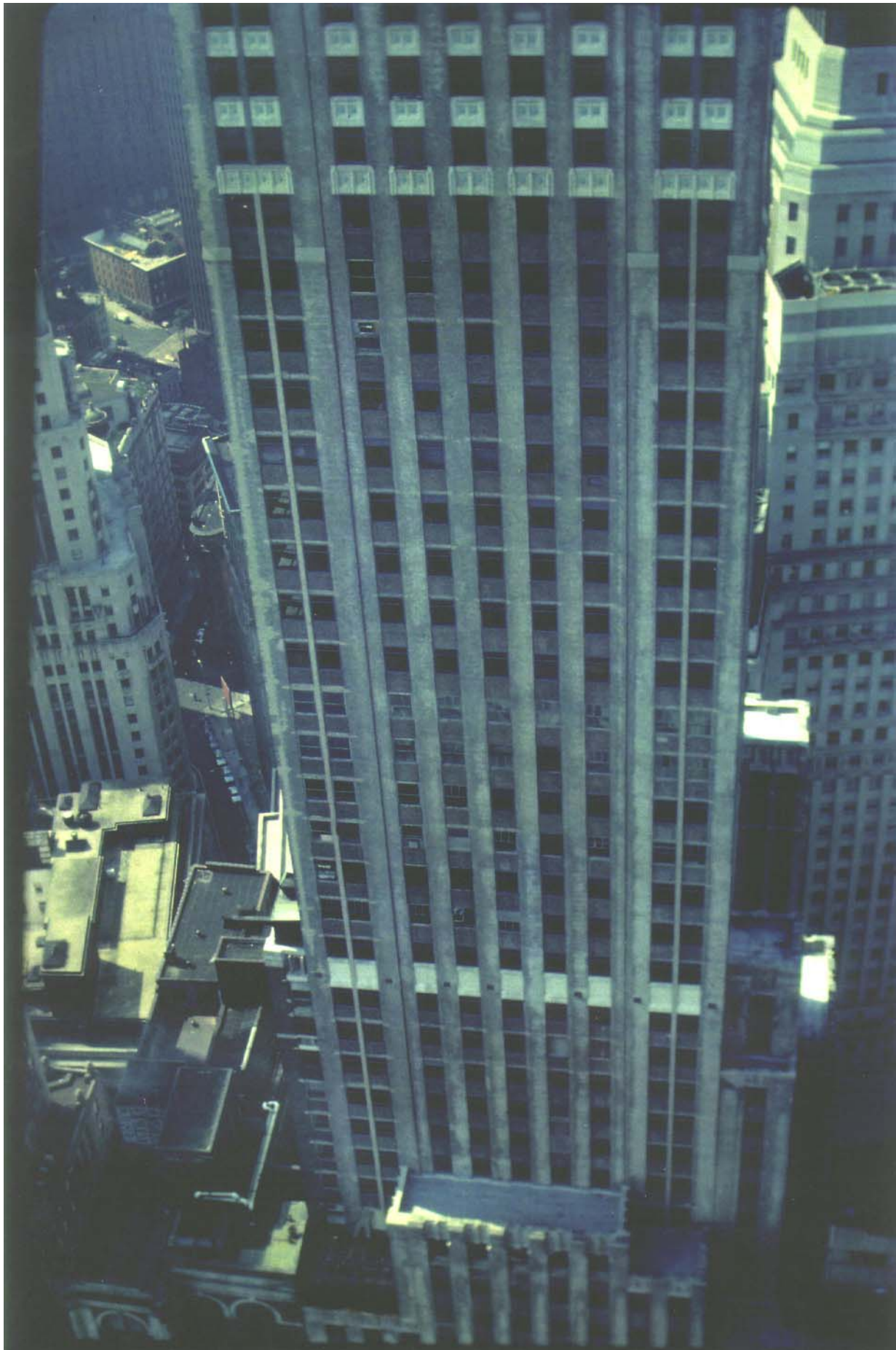
Manhattan Company Building, Pine Street tower elevation