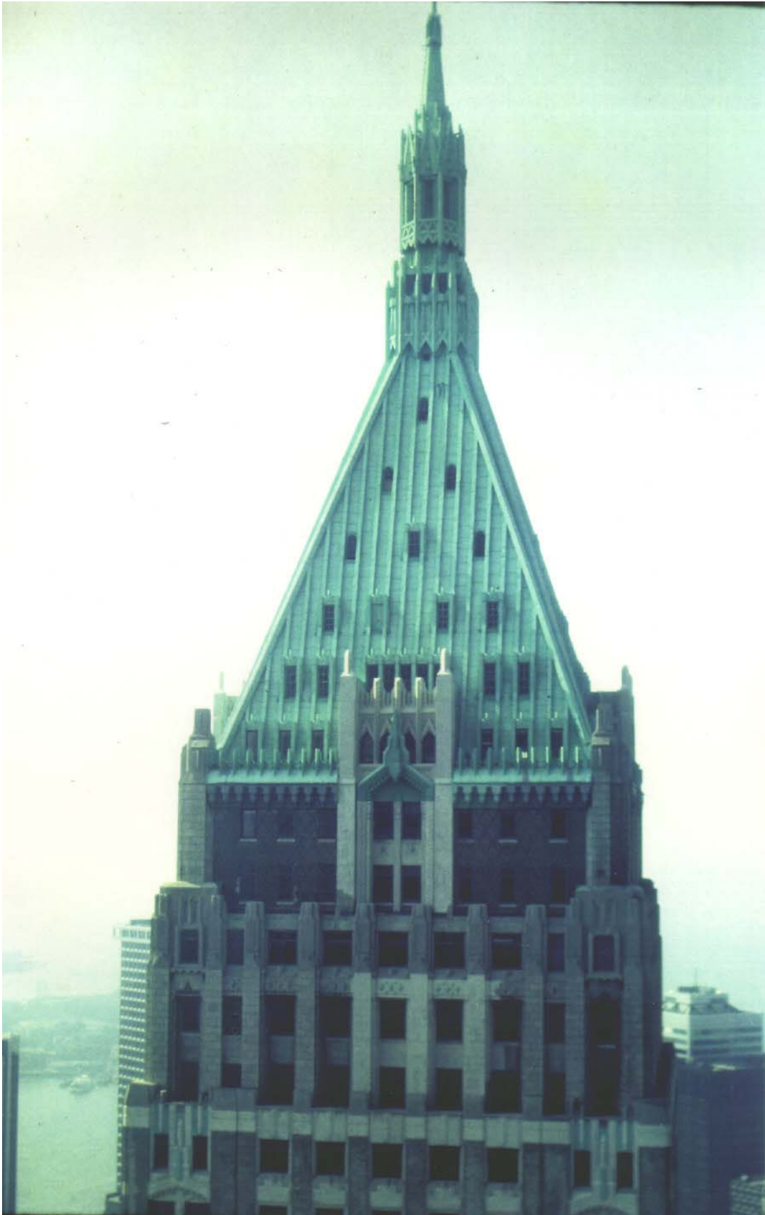
Manhattan Company Building, roof and spire