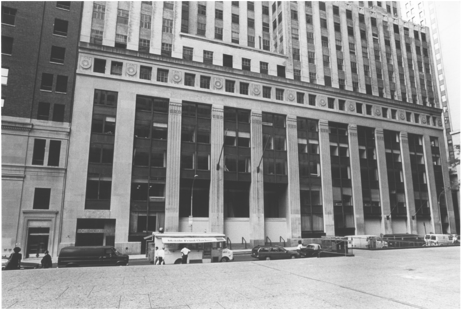
Manhattan Company Building, Pine Street colonnade