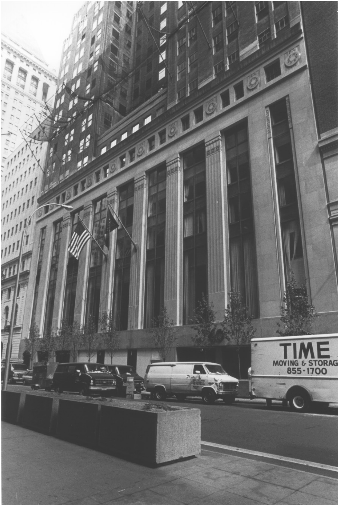
Manhattan Company Building, Wall Street colonnade