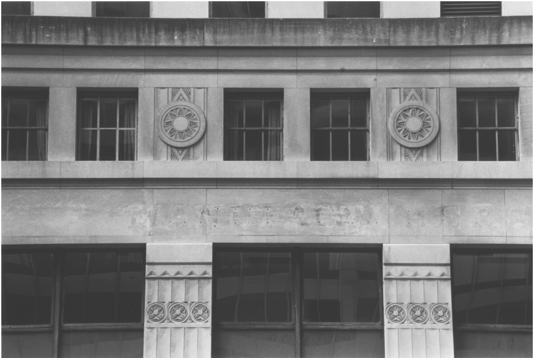
Manhattan Company Building, colonnade ornament