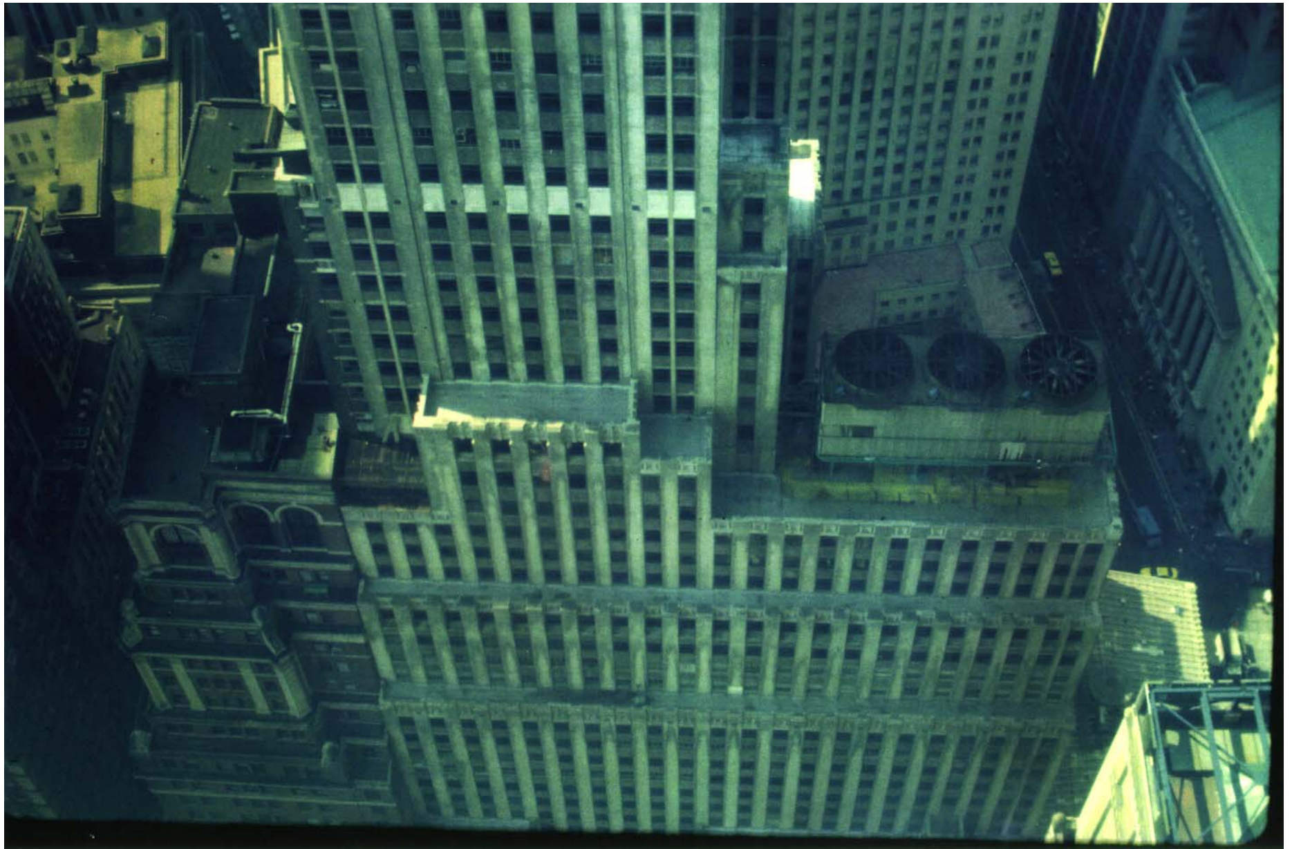
Manhattan Company Building, setbacks on Pine Street elevation