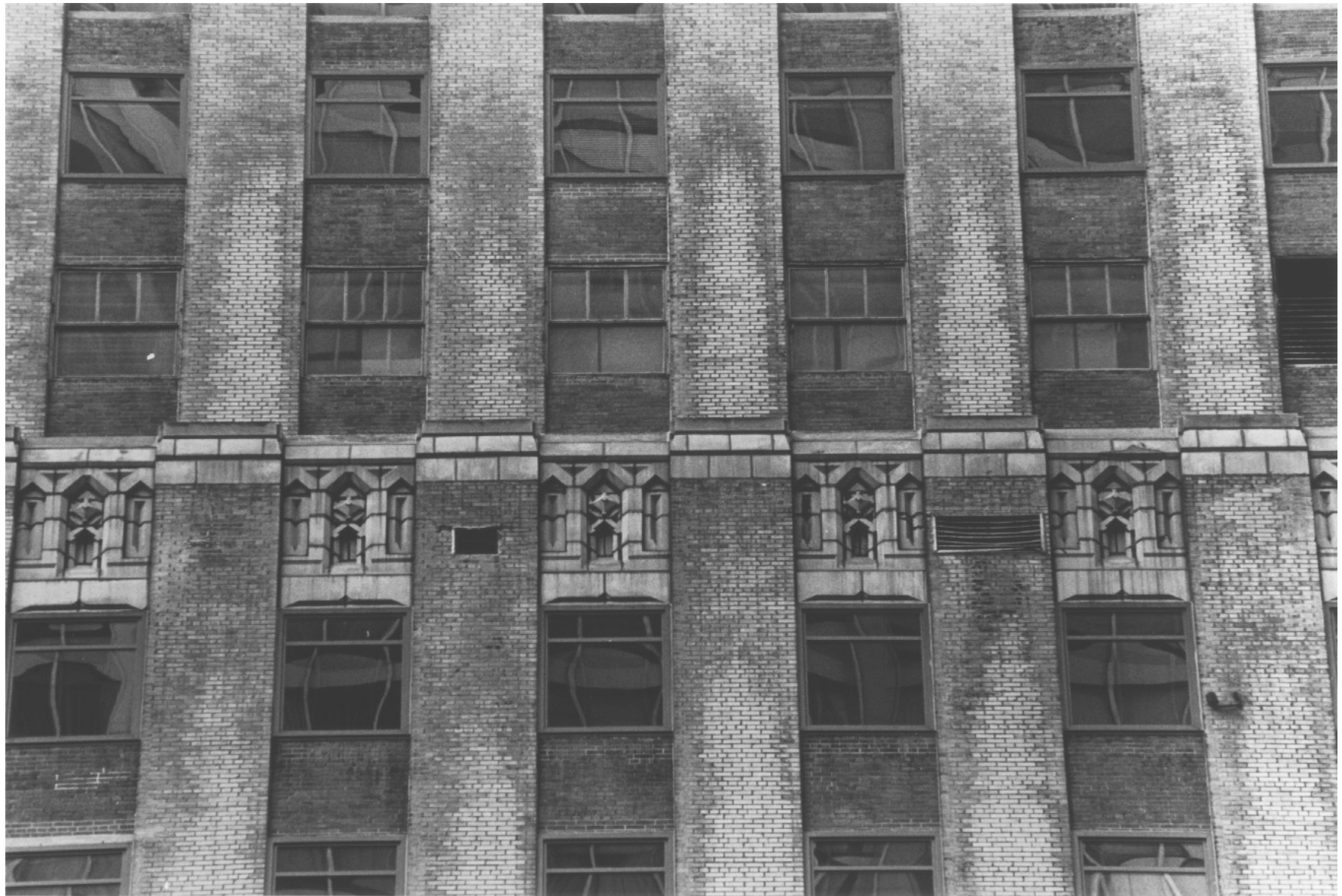
Manhattan Company Building, ornament on midsection of Pine Street elevation