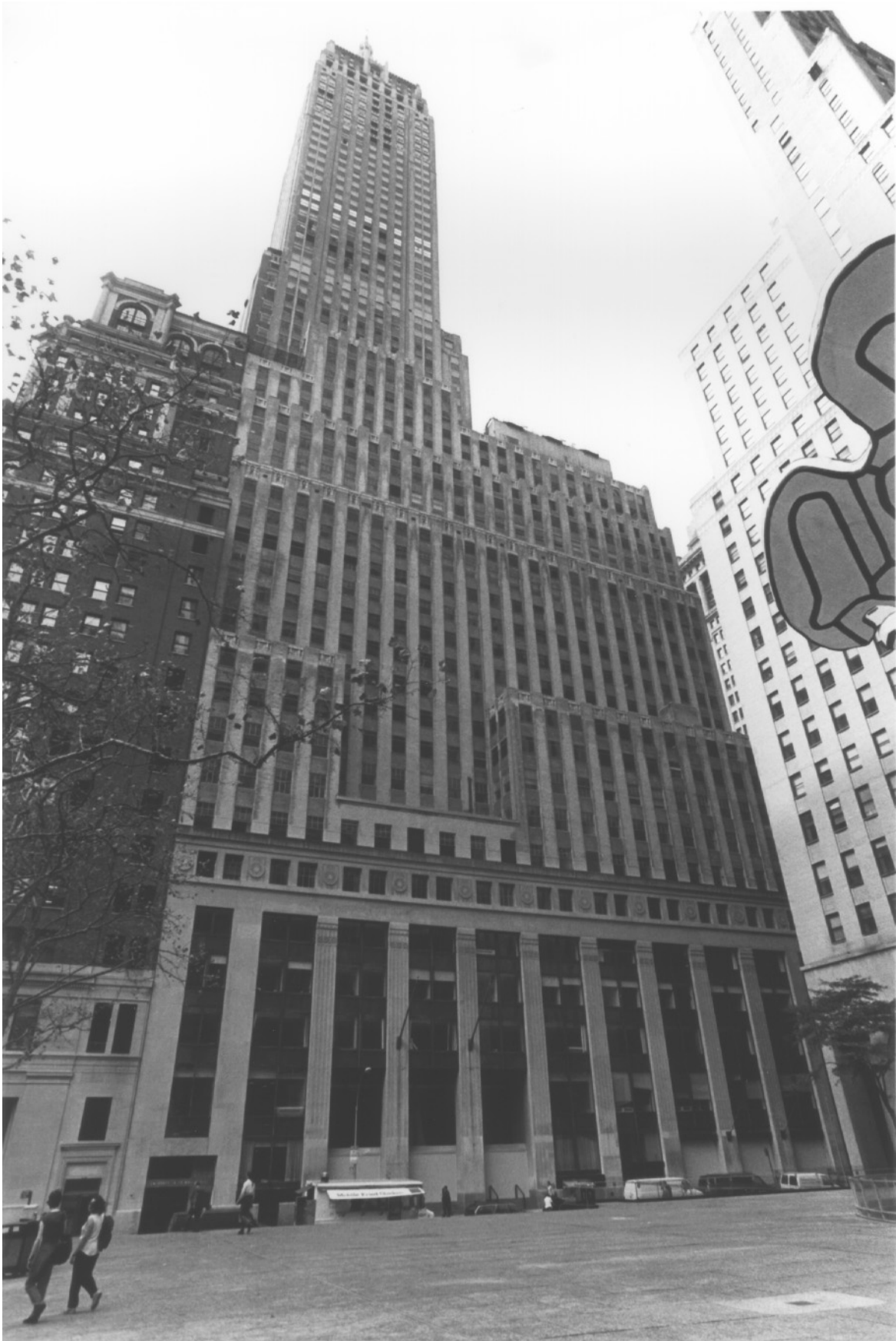
Manhattan Company Building, Pine Street elevation