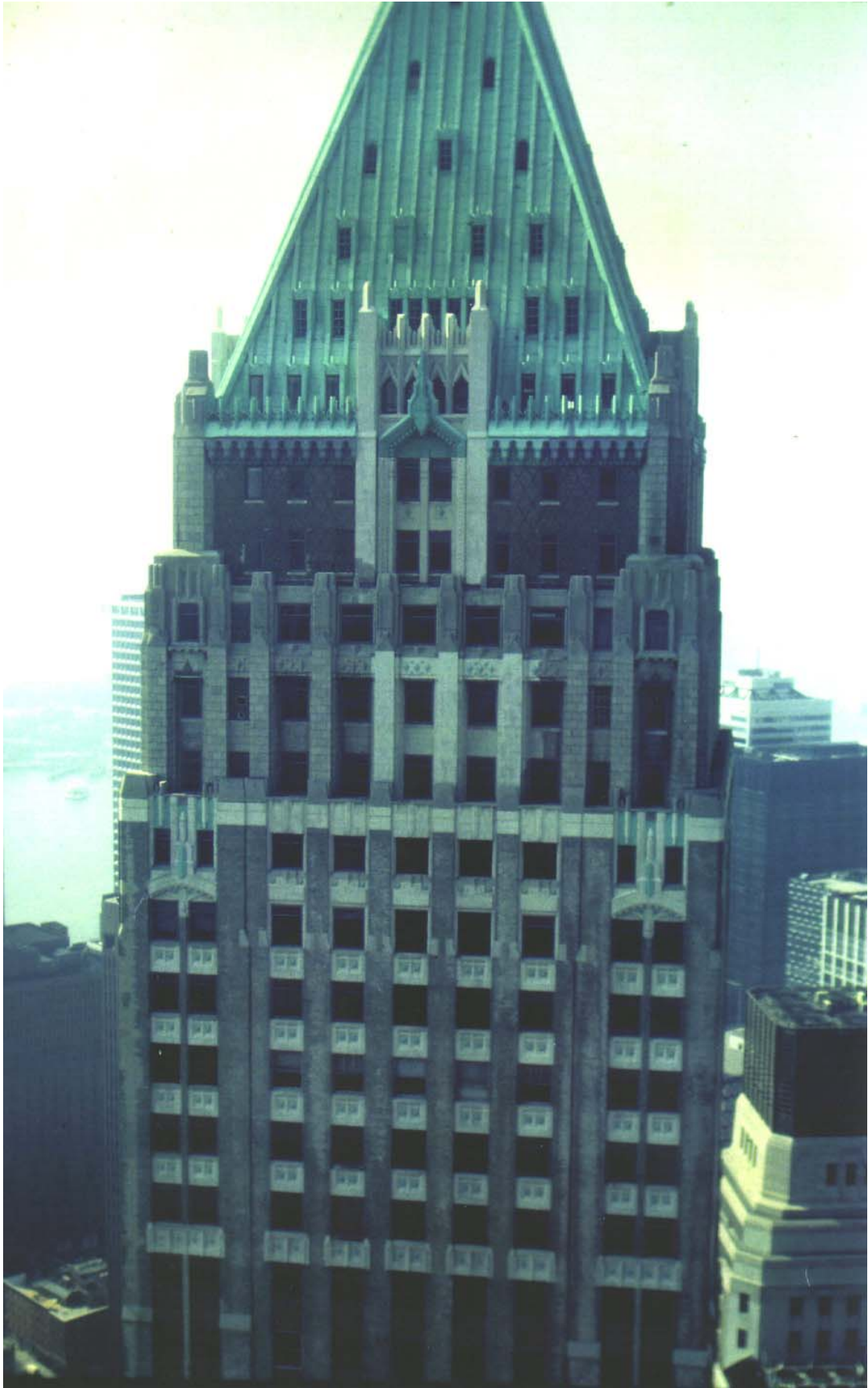
Manhattan Company Building, upper portion of tower