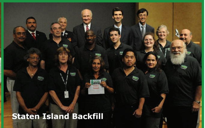
Staten Island Backfill