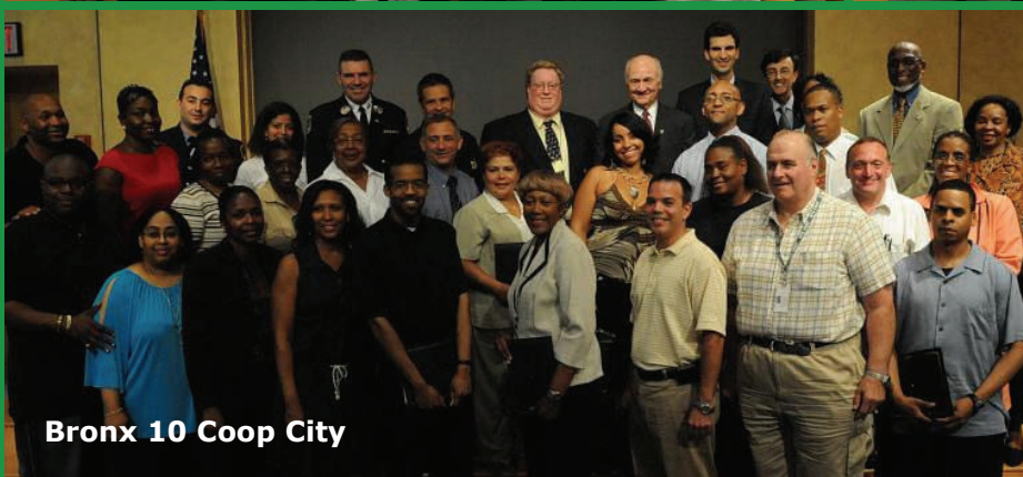
Bronx 10 Coop City