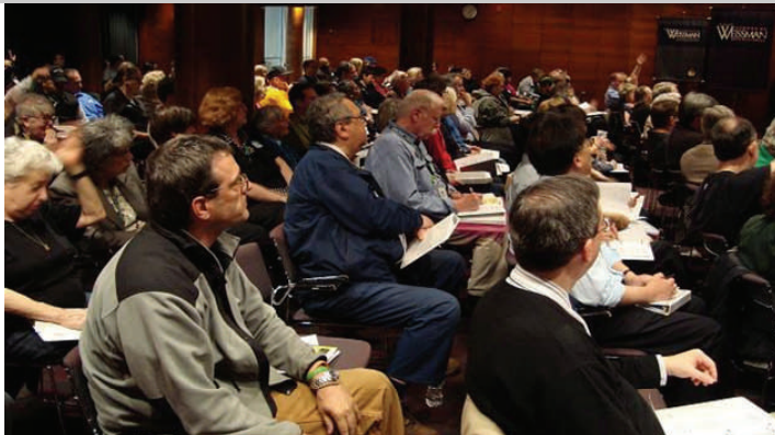
Manhattan borough-wide deployment training at Baruch Library

Two or three NYPD and FDNY officers met informally with the prospective members to answer their questions about CERT and be sure they understood what to expect from training, team activities, and deployment. Because we meet regularly (the second Monday of each month) recruits also have an early opportunity to observe a typical meeting. Usually 12–15 members attended and actively participated in