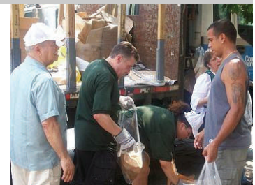
CERTs distributing dry ice

CERTs used their OEM-issued hand gloves, part of the standard equipment issued to members, to handle the dry ice