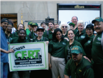
CERTs outside NBC studios

NYC Citizen Corps Council held a citywide kickoff on Thursday, September 4, 2008,