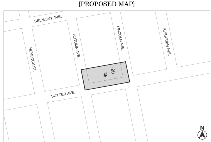
■ Mandatory Inclusionary Housing Area (see Section 23-154(d)(3)) Area # — [date of adoption] — MIH Program Option 1 and Option 2

Portion of Community District 5, Brooklyn