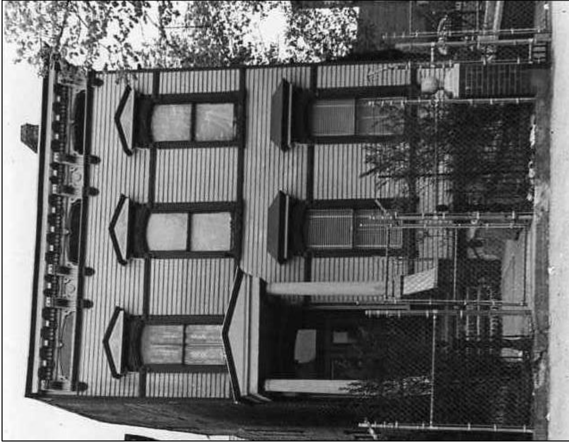
1090 Greene Avenue in 1977