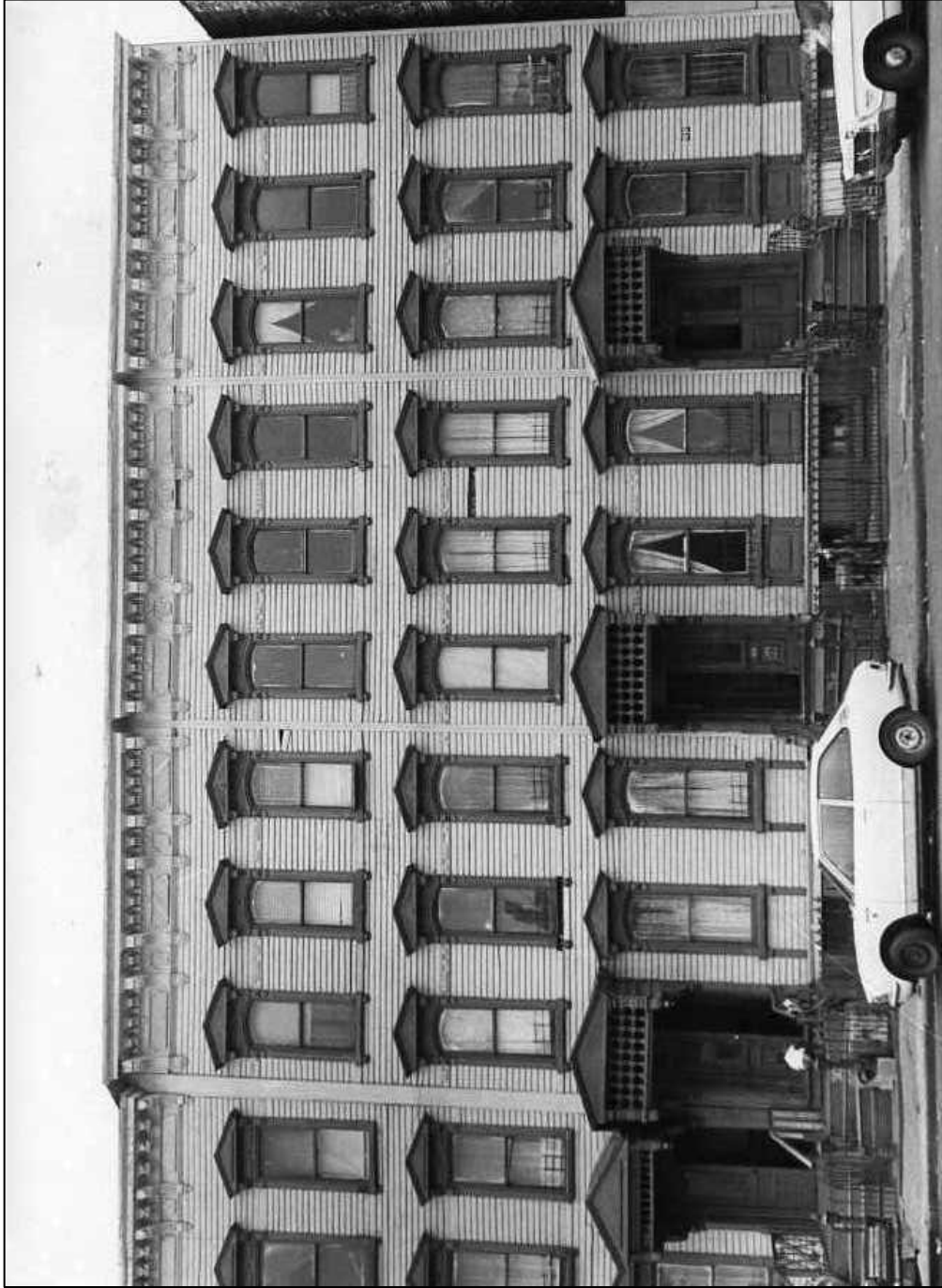
46 to 50 Goodwin Place Built for Valentin Popp in 1887 Demolished 1981