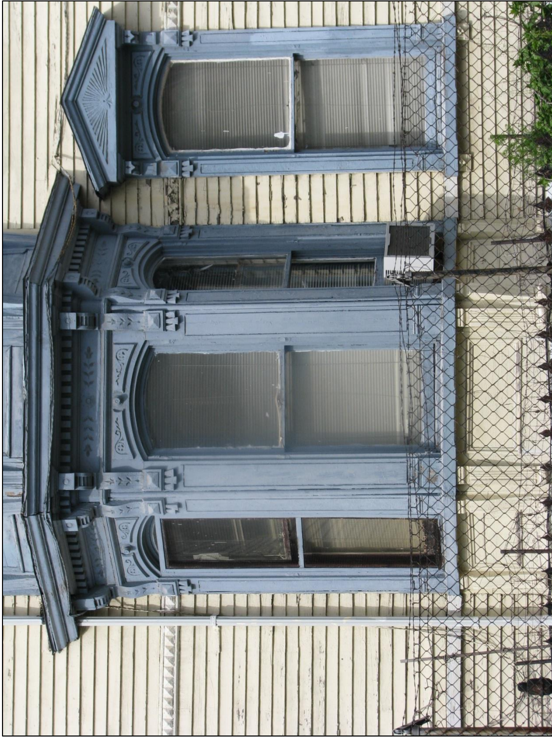
Bohack-Doering House Detail Greene Avenue façade