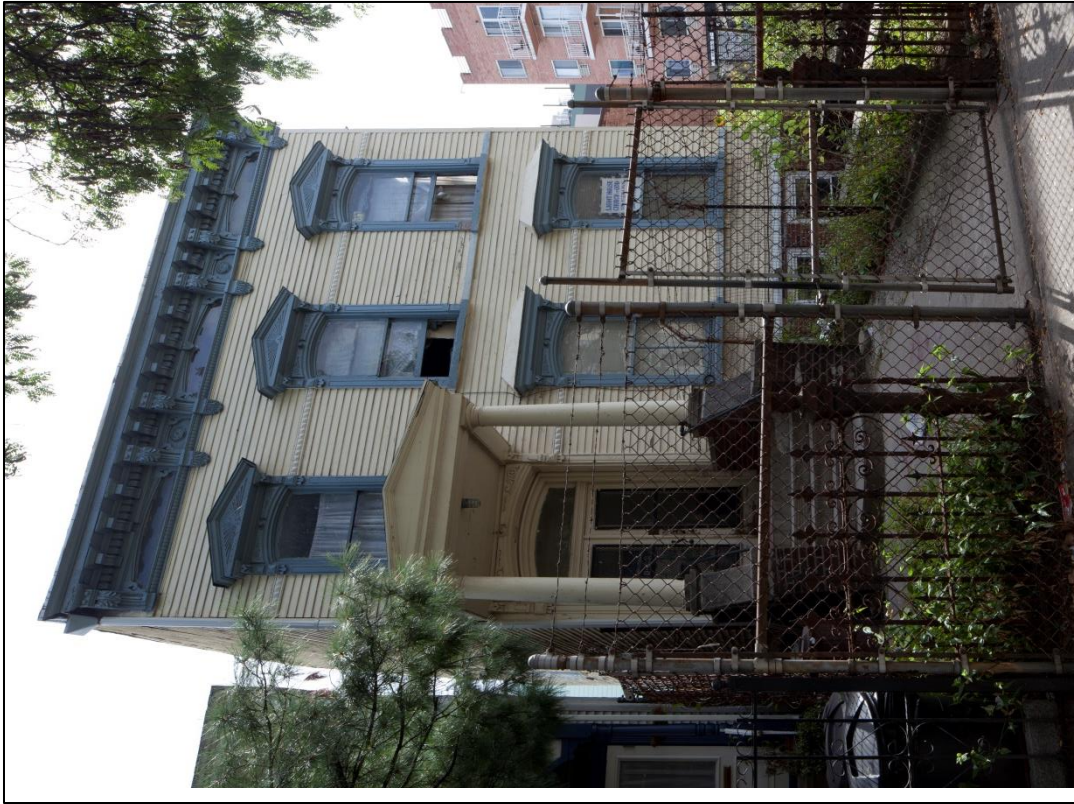
Doering-Bohack House Greene Avenue façade