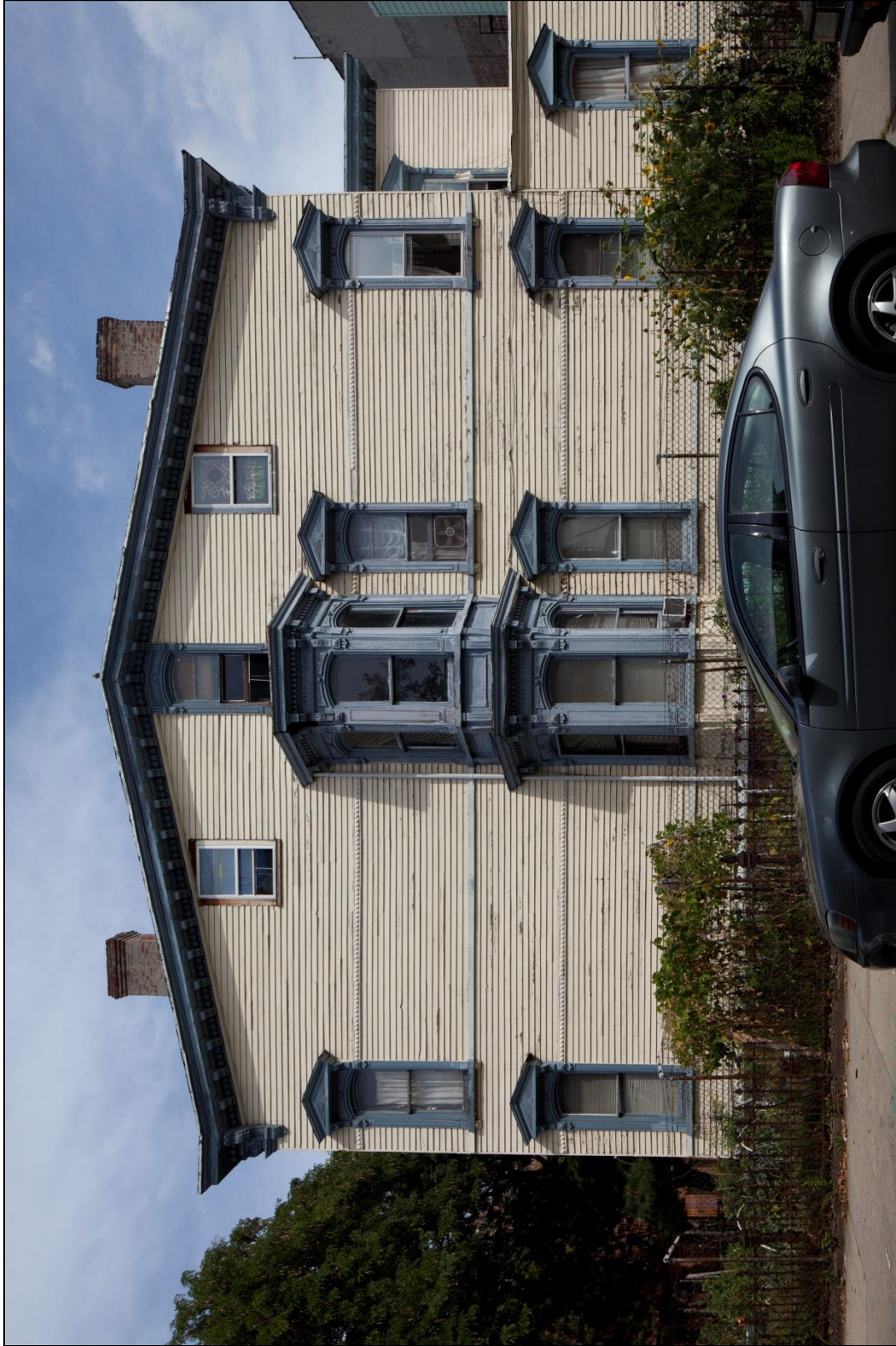
Bohack-Doering House Goodwin Place façade