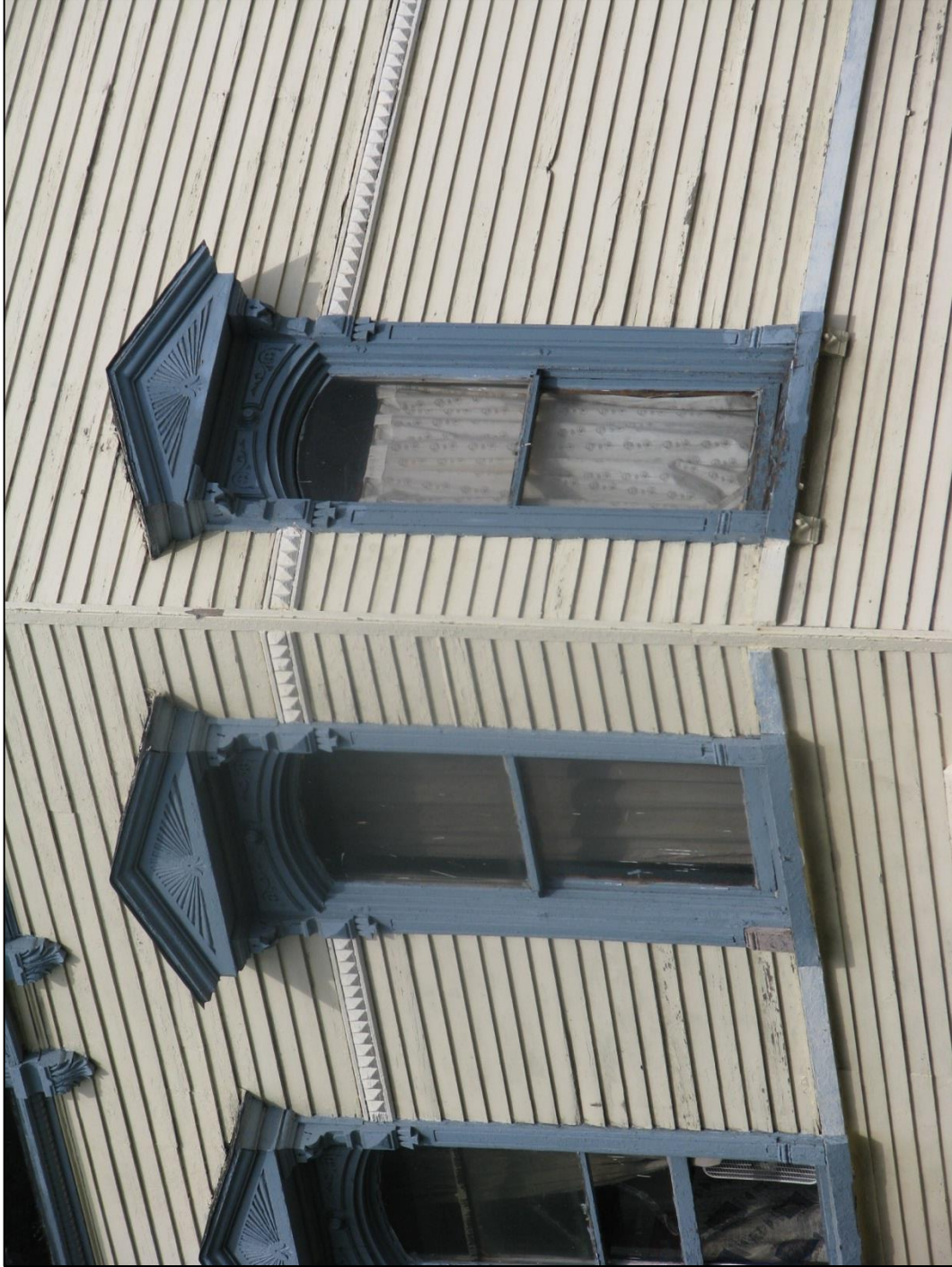
Bohack-Doering House Detail upper stories