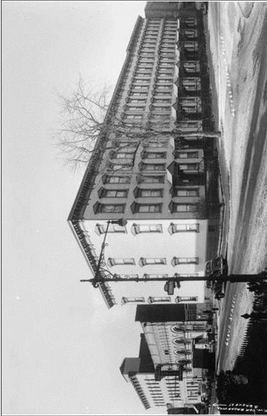
View looking southwest from intersection of Grove Street and Goodwin Place Showing 46 to 62 Goodwin Place, 1942