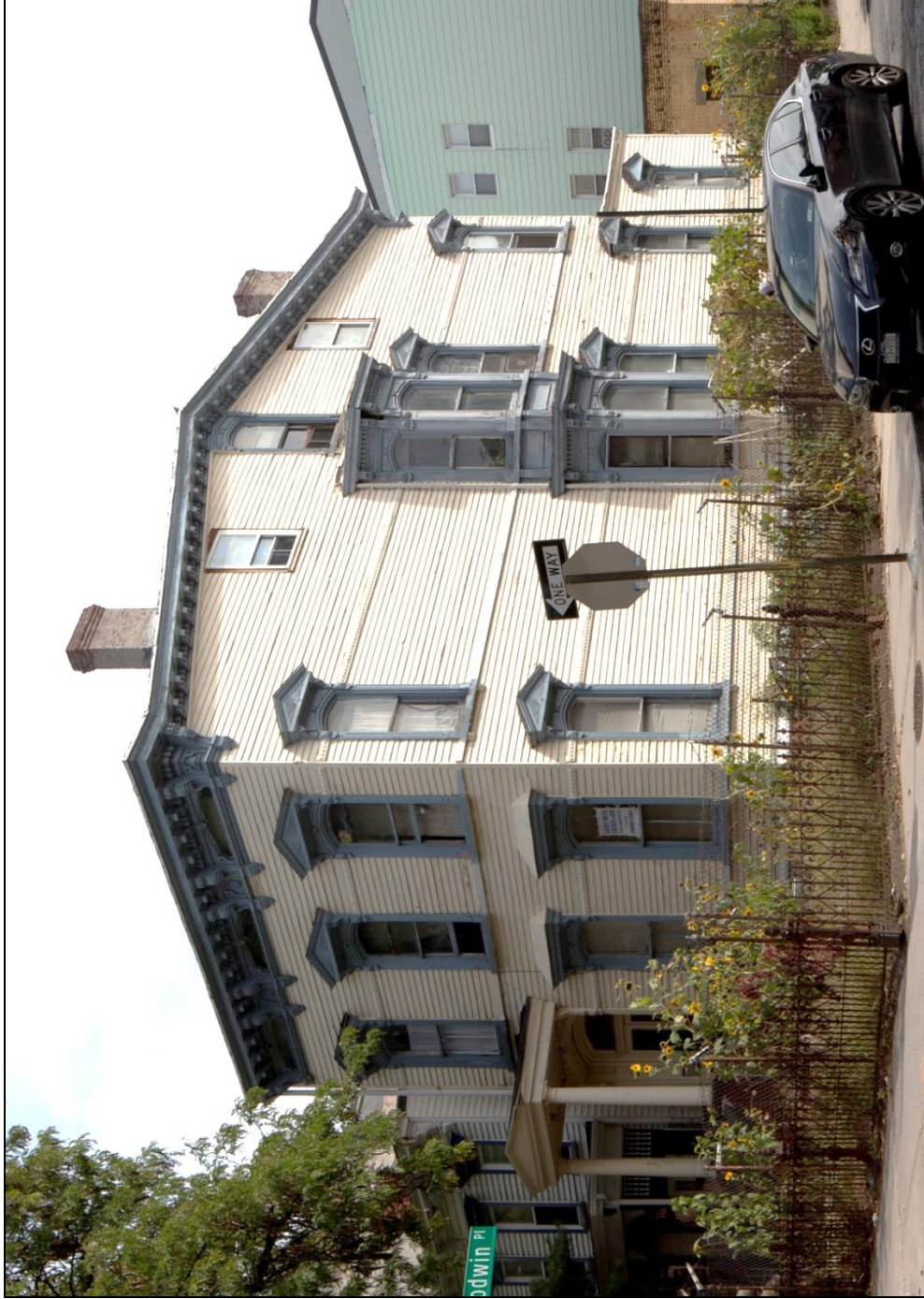
Doering-Bohack House 1090 Greene Avenue (aka 1 Goodwin Place) Borough of Brooklyn Tax Block 3294, Lot 1 Built c.1887, moved 1902