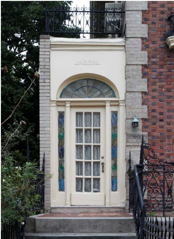
Huberty House from northwest (above)