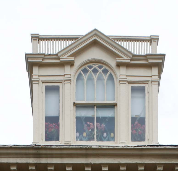
Huberty House, front facade