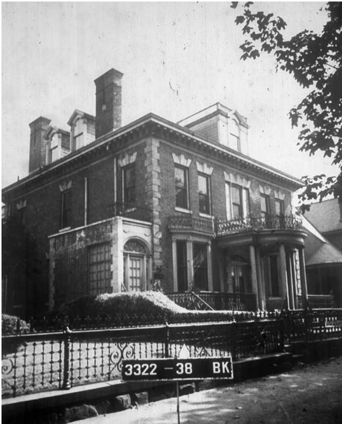
c. 1940 Tax Photo (left)