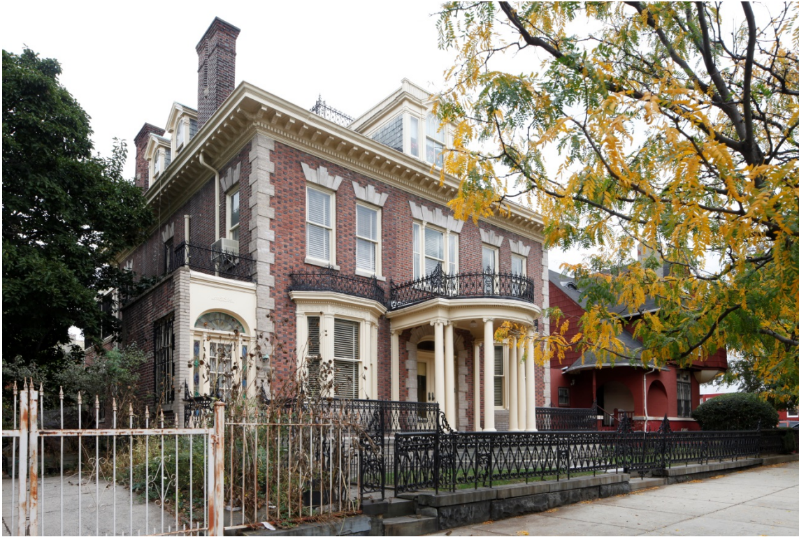
Huberty House 2017 (above)