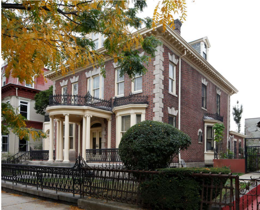
Huberty House from southwest