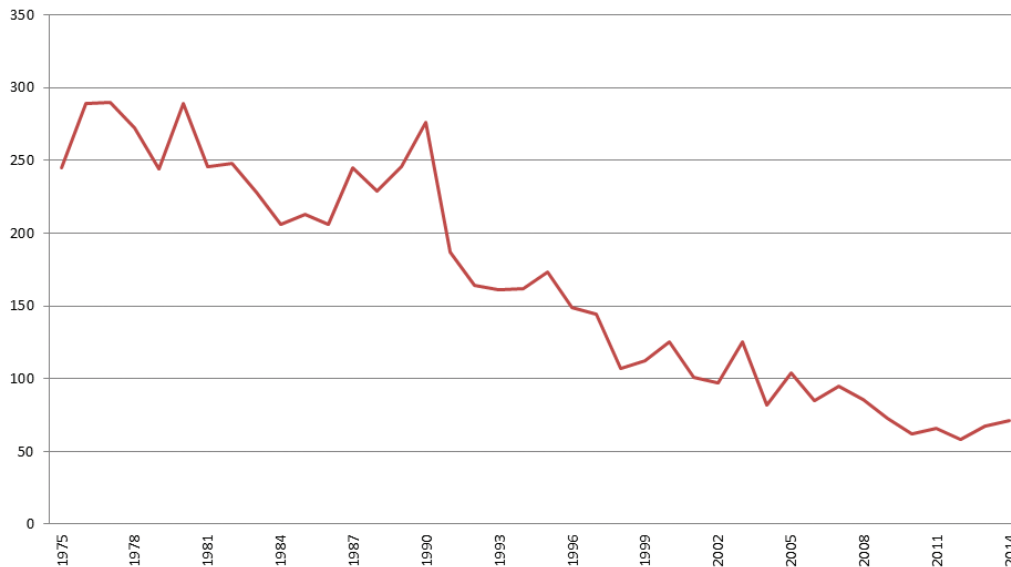
New York City Total Citywide Fire Fatalities 40-Year Trend

During the past five years, FDNY reported the lowest number of fire fatalities in New York City history.