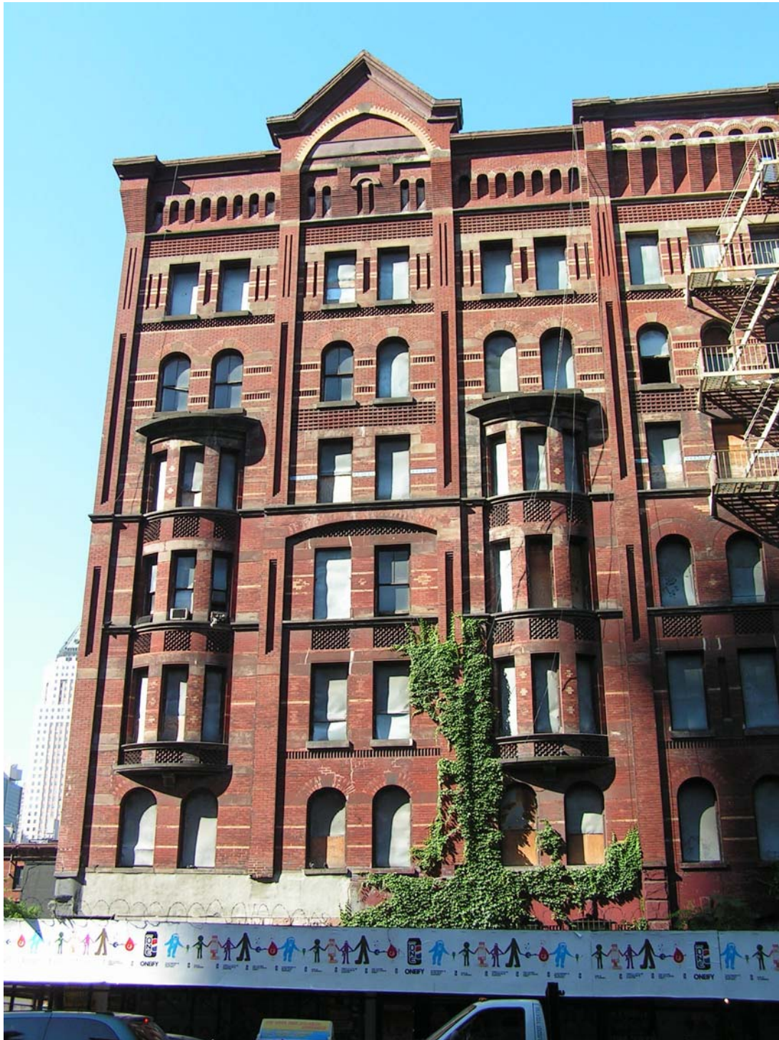
The Windermere, West 57 th Street façade of No. 400 West 57 th Street