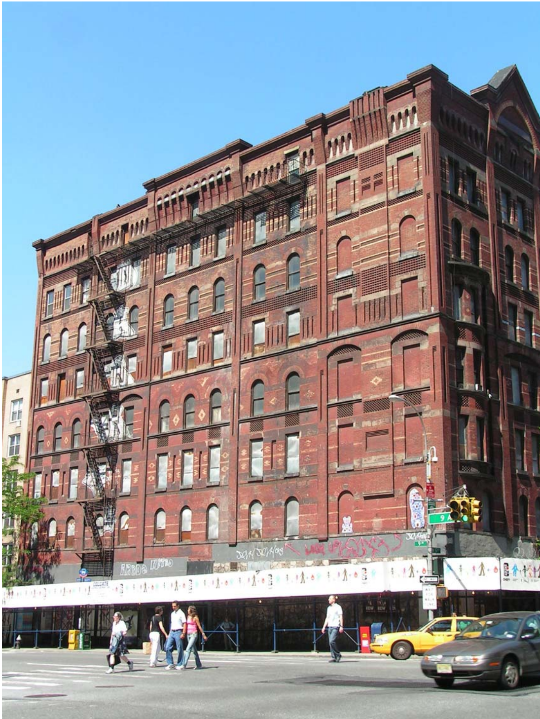
The Windermere, Ninth Avenue façade