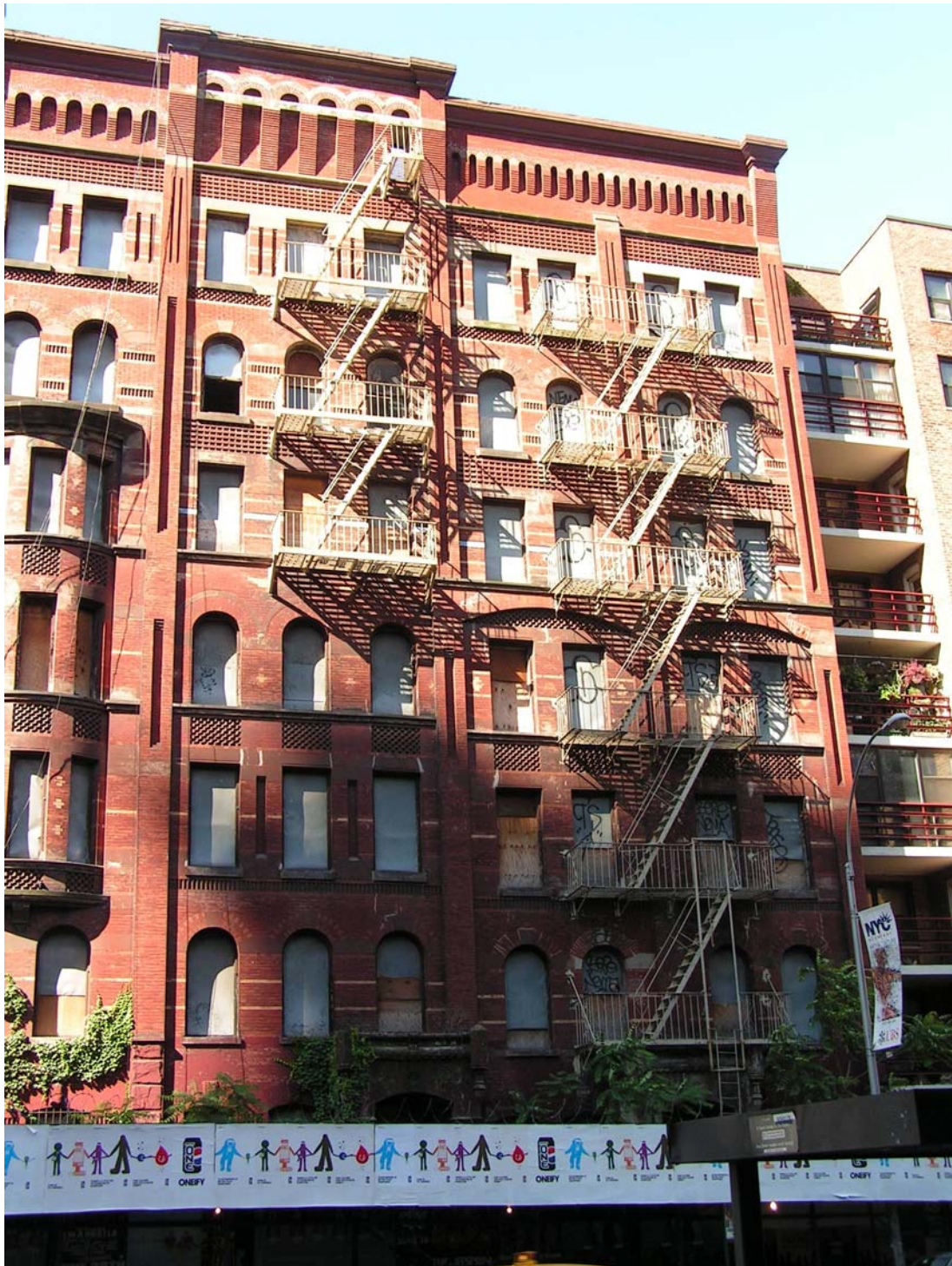
The Windermere, facades of Nos. 404 and 406 West 57 th Street, second through seventh stories