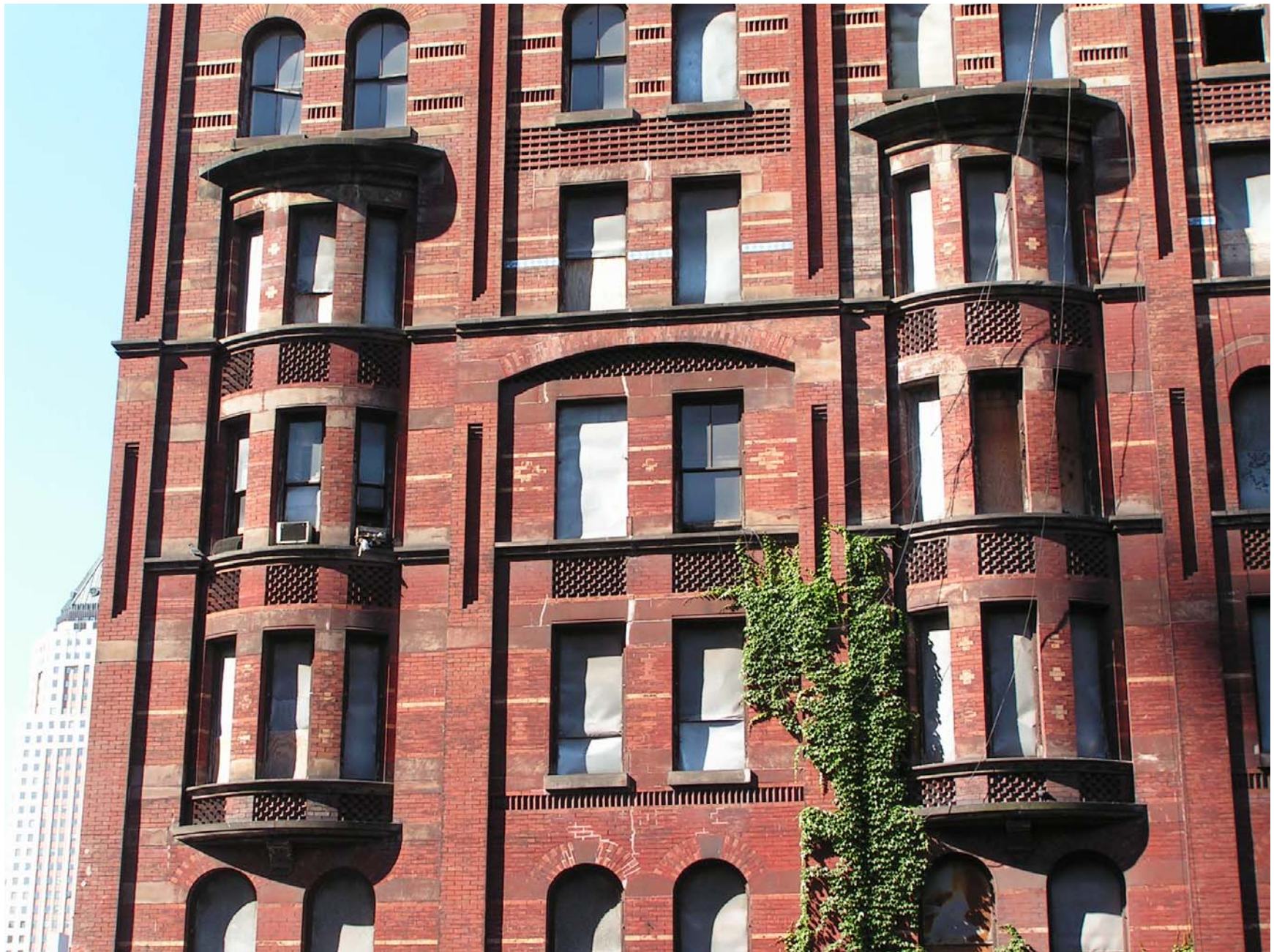
The Windermere, third through fifth stories, West 57 th Street façade of No. 400 West 57 th Street, showing oriel windows