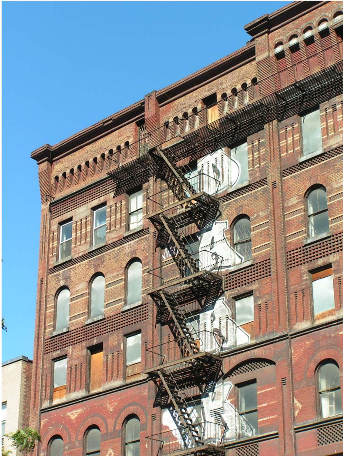
The Windermere, upper stories, southernmost portion of Ninth Avenue façade