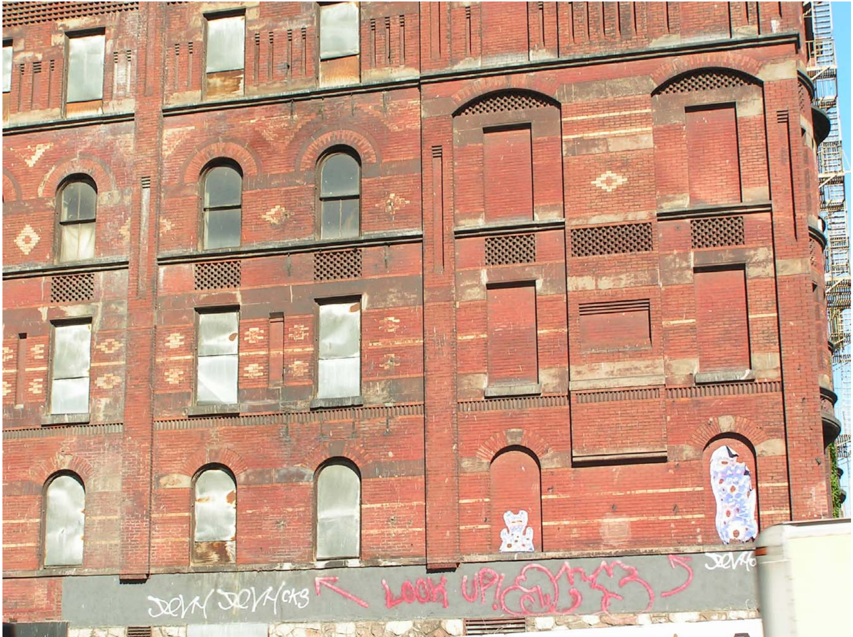
The Windermere, second through fourth stories, northernmost portion of Ninth Avenue façade