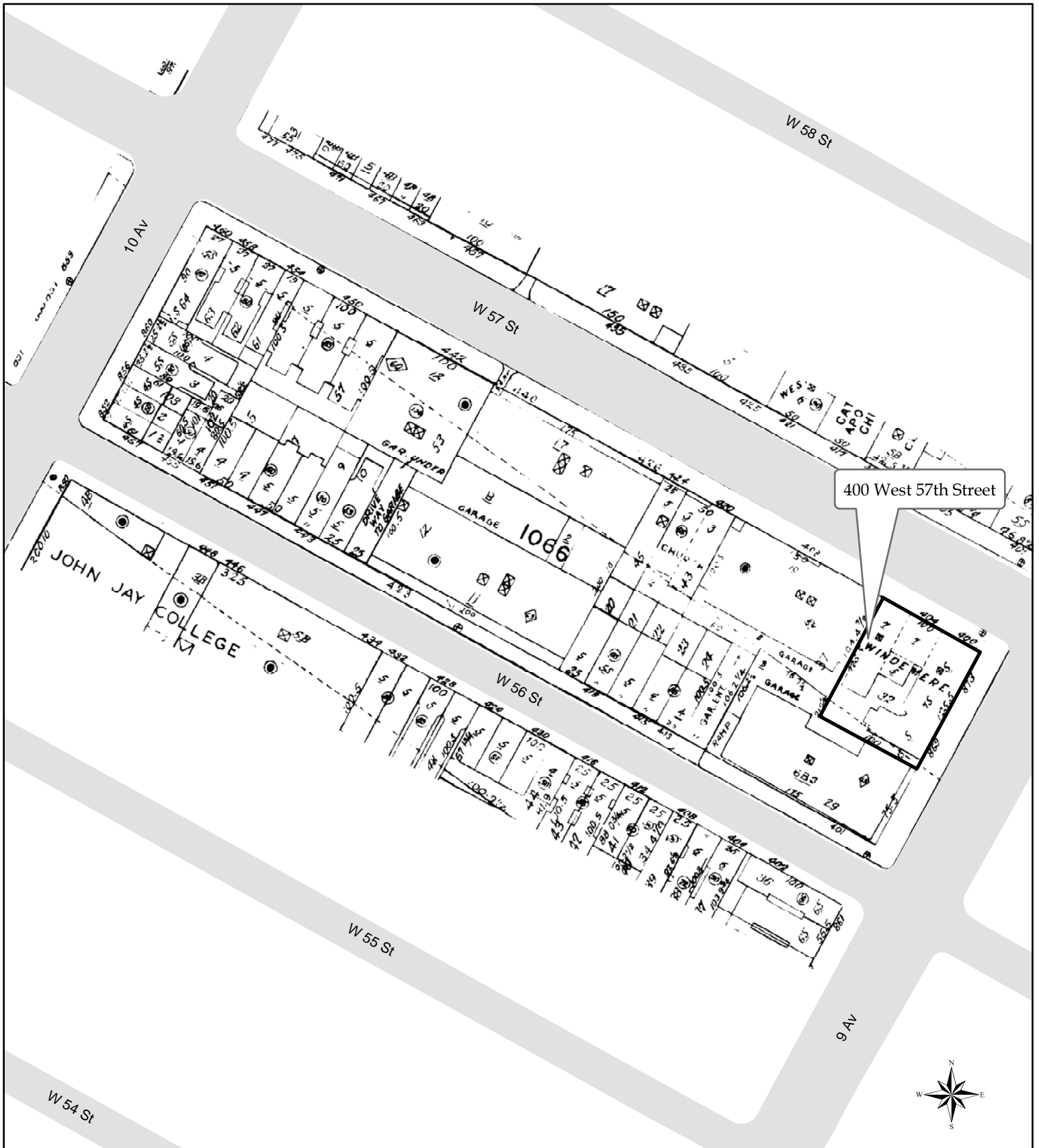
The Windermere, 400-406 West 57th Street (aka 869 9th Avenue and 871-877 9th Avenue), Manhattan Landmark Site: Borough of Manhattan Tax Map Block 1066, Lot 32 Graphic Source: Sanborn, Manhattan Land Book (2005-05), Plate 81