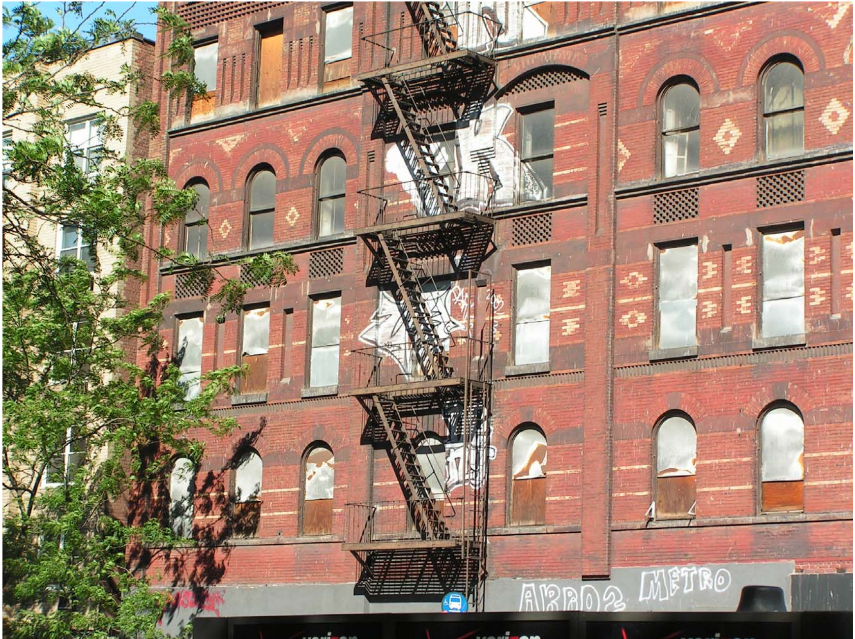
The Windermere, second through fourth stories, southernmost portion of Ninth Avenue façade