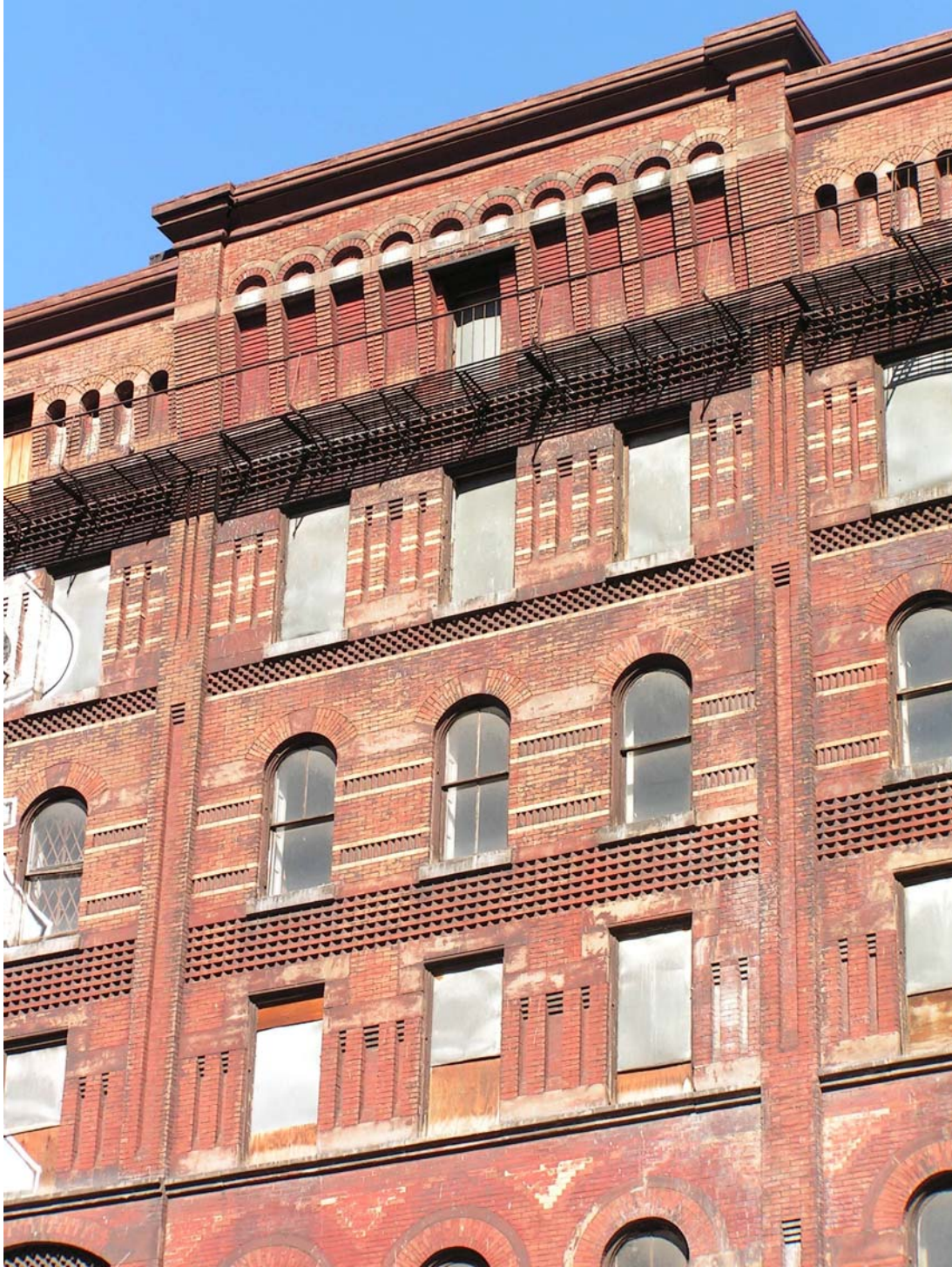
The Windermere, upper stories, central portion of Ninth Avenue façade