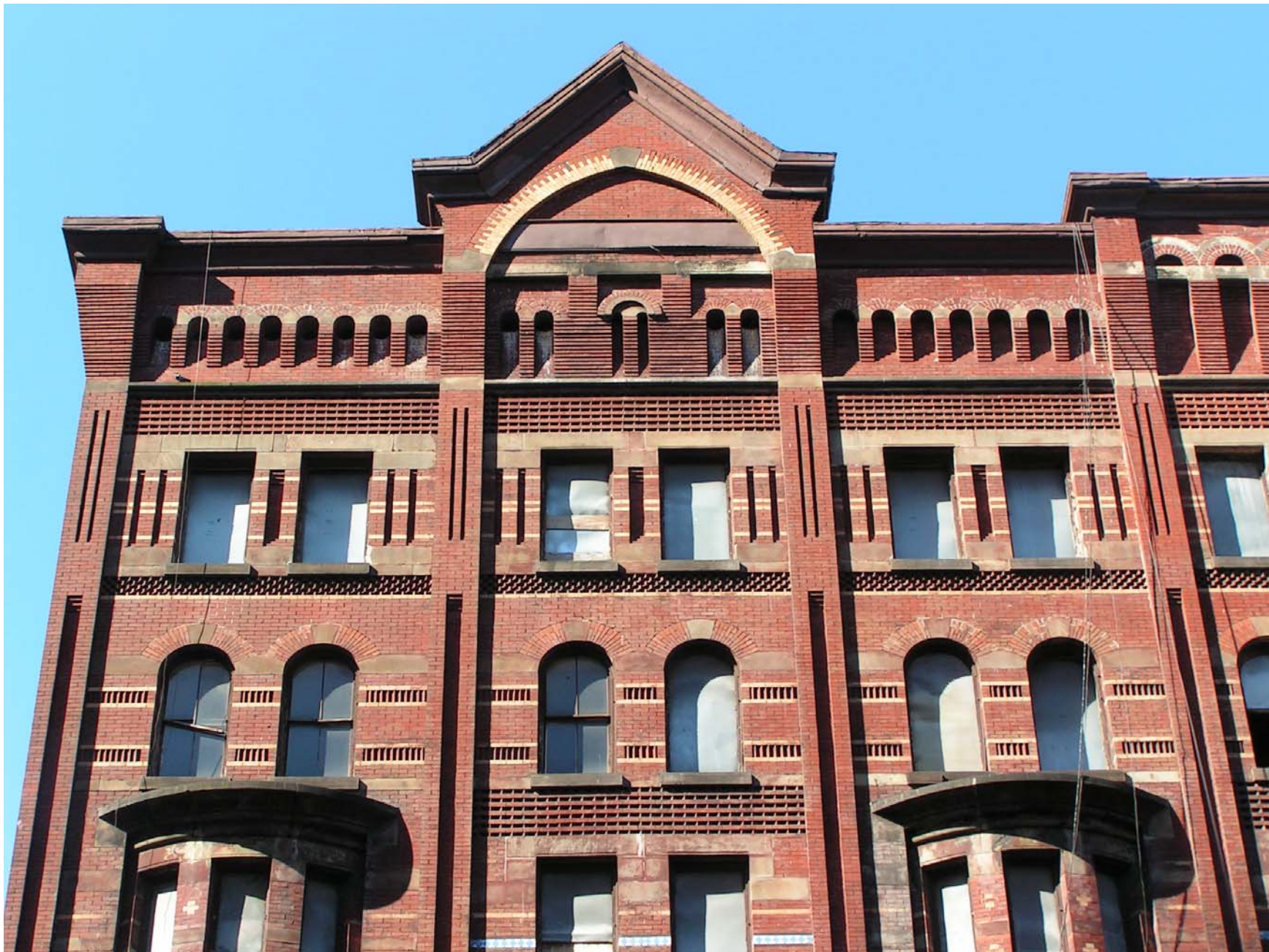
The Windermere, upper portion of West 57 th Street façade of No. 400 West 57 th Street