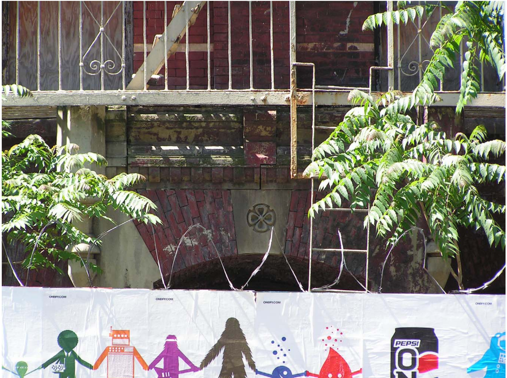
The Windermere, hood of portico at No. 406 West 57 th Street