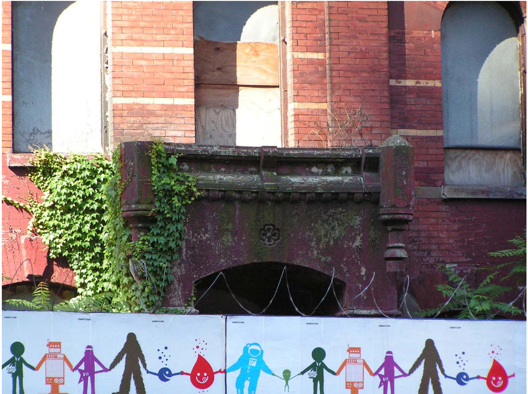
The Windermere, hood of portico at No. 404 West 57 th Street