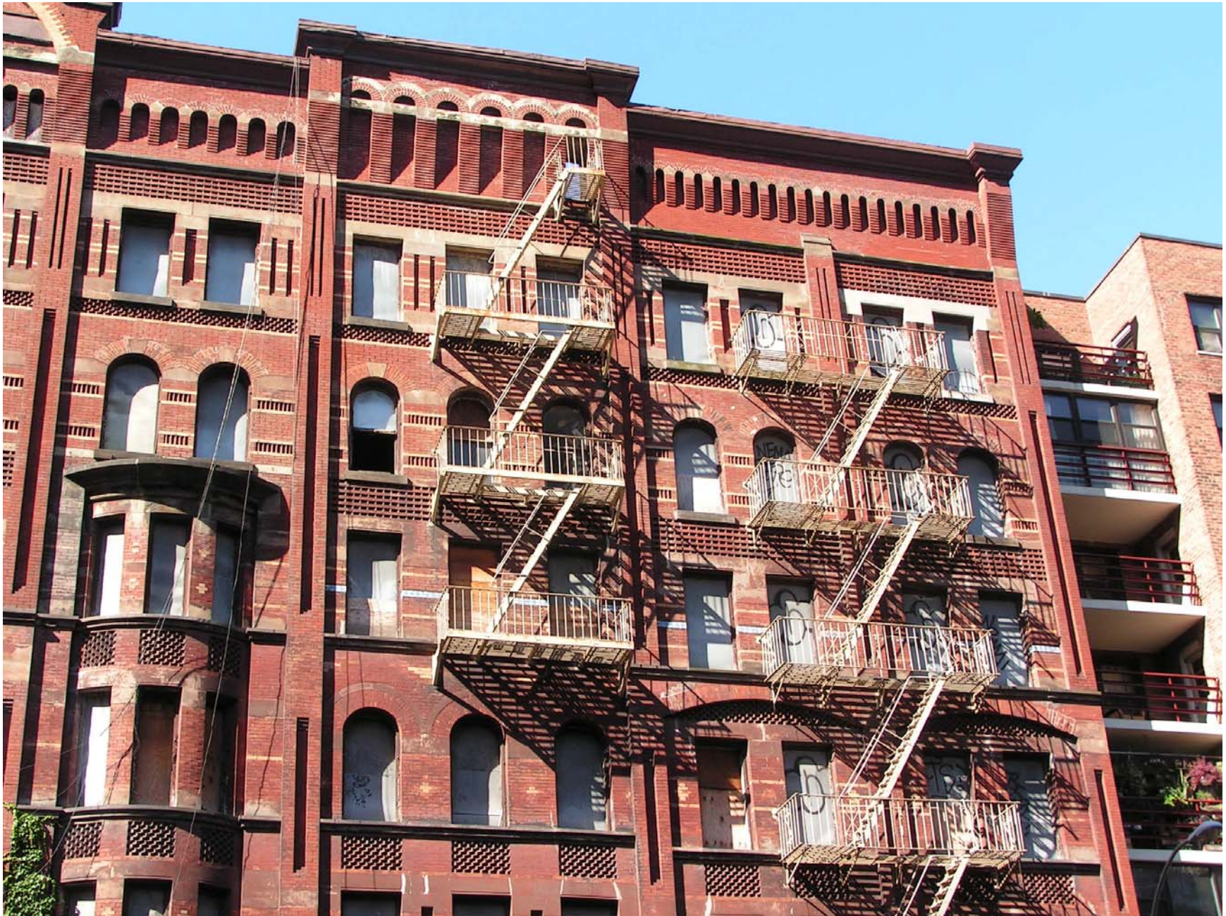
The Windermere, facades of Nos. 404 and 406 West 57 th Street, fourth through seventh stores