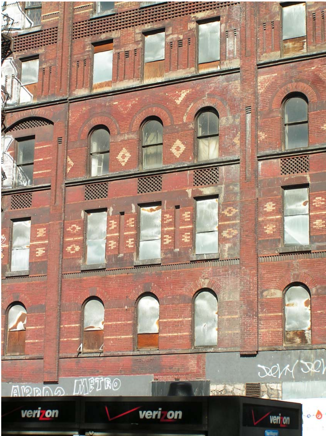
The Windermere, second through fifth stories, central portion of Ninth Avenue façade