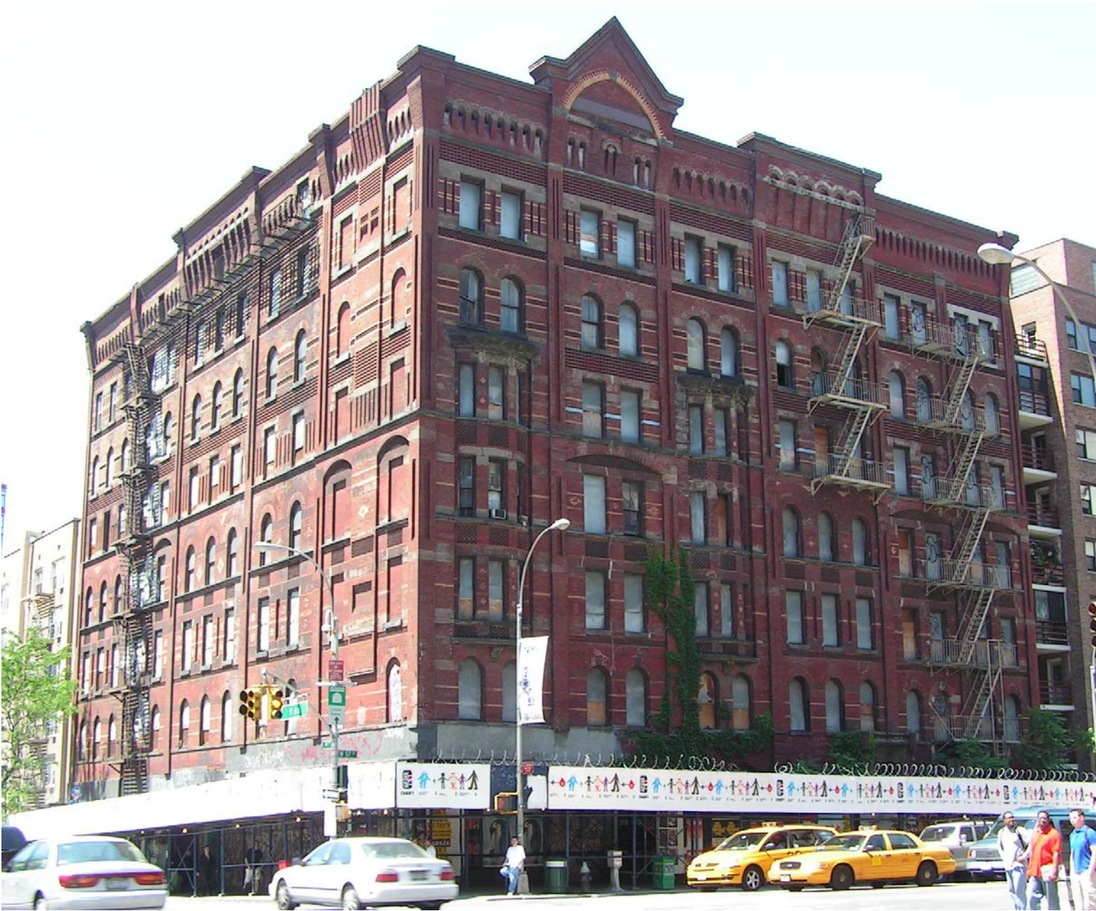
The Windermere, Ninth Avenue (left) and West 57 th Street (right) facades