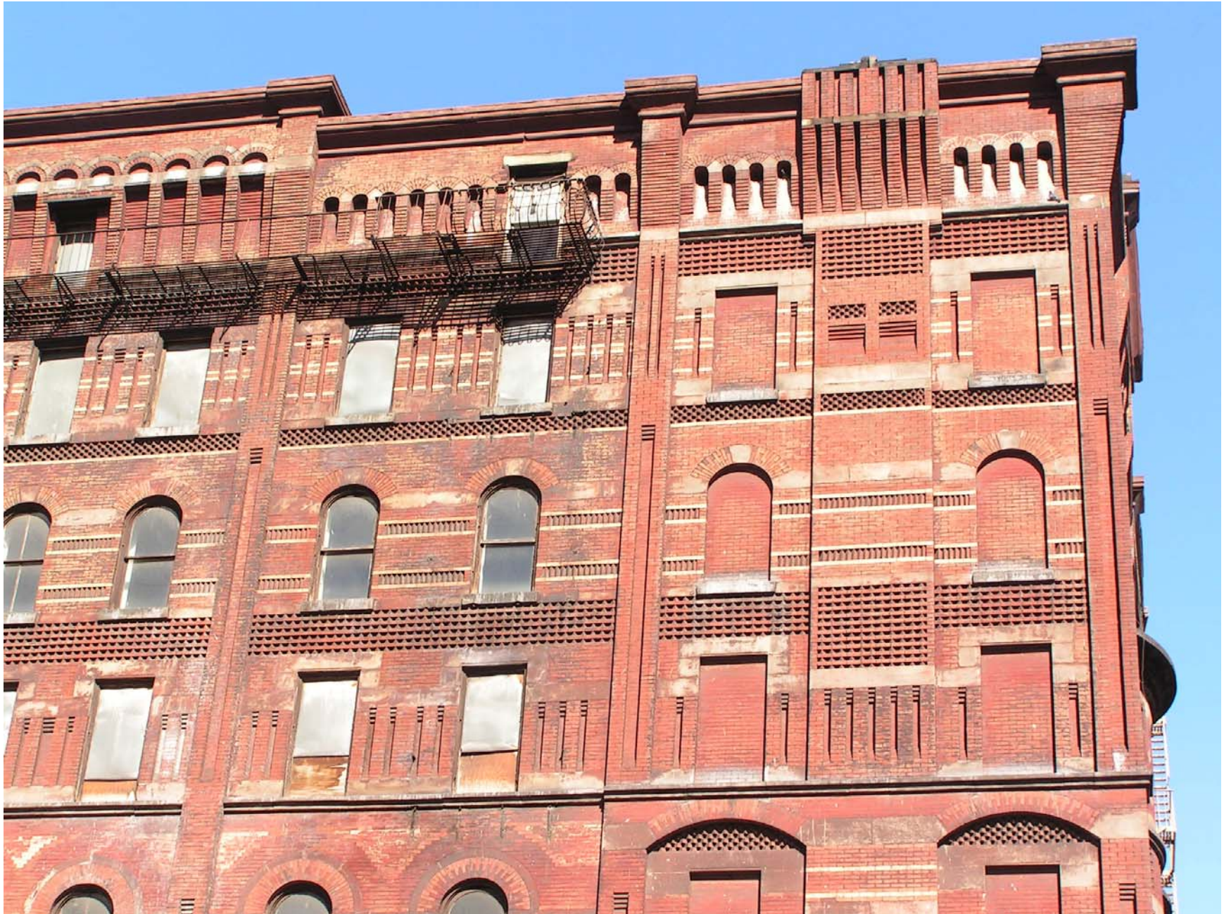
The Windermere, upper stories, northernmost portion of Ninth Avenue façade