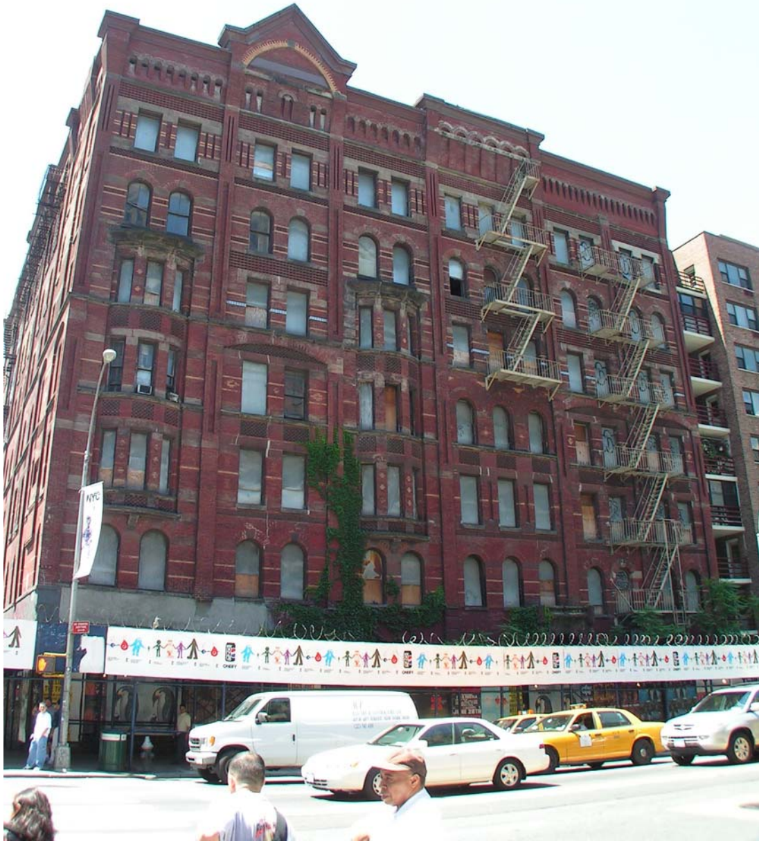
The Windermere, West 57 th Street facades of Nos. 400 (left), 404 (center), and 406 (right) West 57 th Street