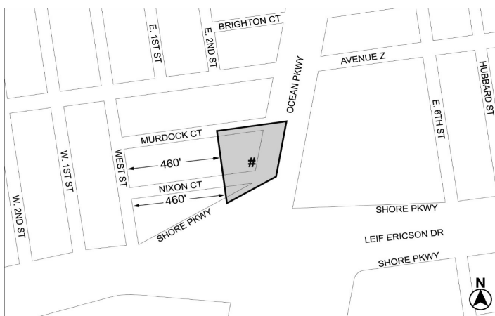
█ Mandatory Inclusionary Housing Area see Section 23-154(d)(3) Area # — [date of adoption] — MIH Program Option 1 and Option 2

Portion of Community District 13, Brooklyn