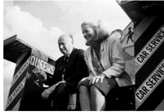
Former Mayor Ed Koch and Acting Cultural Affairs Commissioner Diane M. Coffey at the opening of Sculpture: Walk On/Sit Down/Go Through , 1987

Under Mayor Koch, The Percent for Art Law is enacted, which requires that one percent of the budget for eligible City-funded construction is dedicated to creating public artworks. The Public Art Fund administers this program from its inception until 1986, when the program moves to DCA.