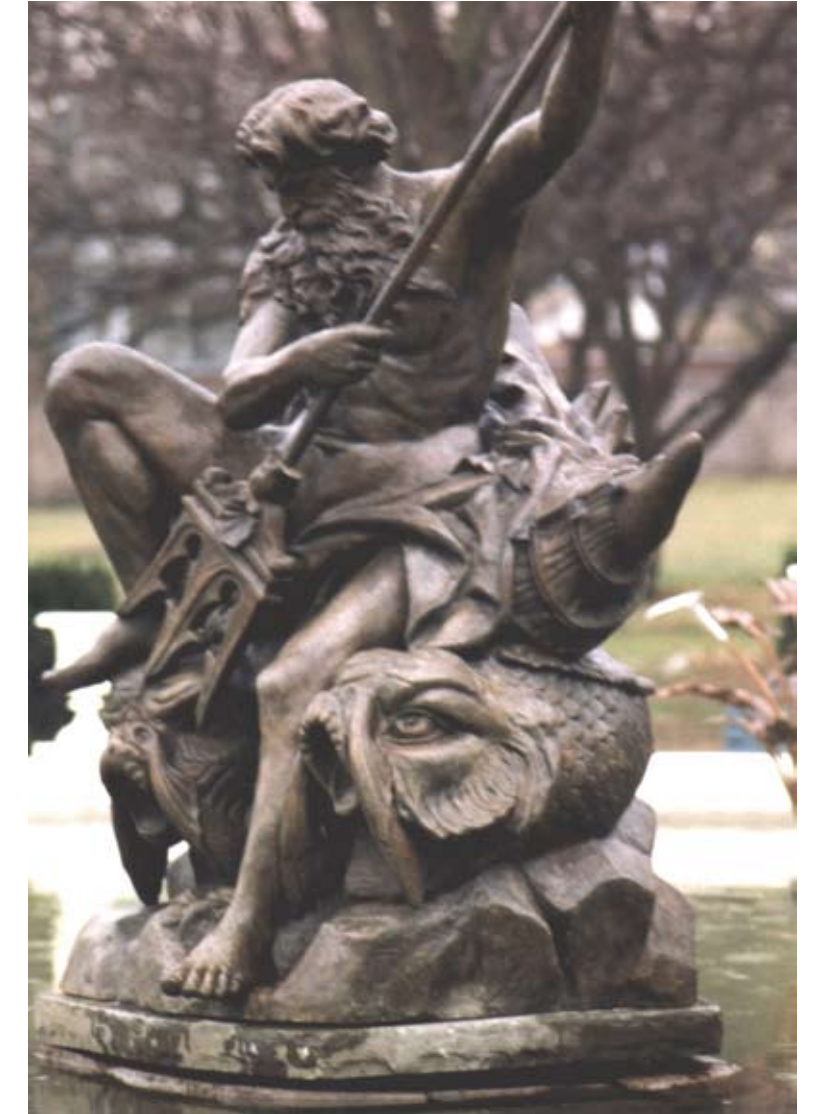
Neptune Fountain at Snug Harbor Cultural Center, Staten Island

In recognition of the outstanding work being done in arts education by the public schools, nonprofit arts organizations, and the funding community, The Wallace Foundation has awarded a major planning grant for Step Up for Arts Education , an initiative designed to ensure that every public school student has equitable access to the highest quality arts education. DCA continues to work under the leadership of the Department of Education as