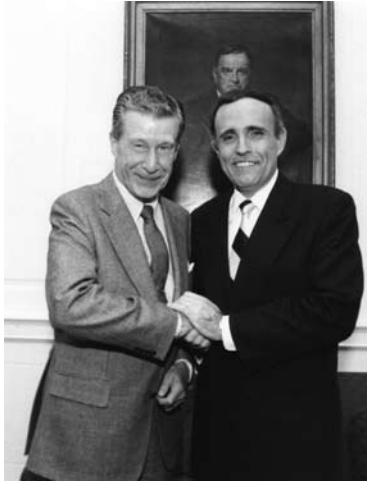
Cultural Affairs Commissioner Schuyler G. Chapin and Mayor Rudolph Giuliani, January 24, 1994