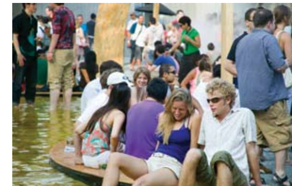
Warm Up 2006 at P.S.1, Queens

THE COMMISSION created and hosted two seminars, in 2004 and 2005, entitled Advancing Culture Through Management . These explored the relationships between