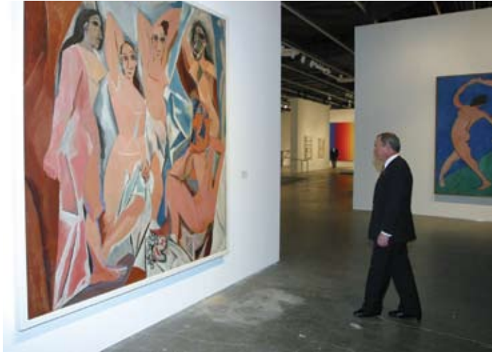
left: Mayor Michael R. Bloomberg admires Pablo Picasso's Les Femmes d'Alger at MoMA QNS, Queens right: Christo, Jeanne-Claude and Mayor Bloomberg at the opening of The Gates , Manhattan

that our Administration is providing a new home for the DCA in a landmark downtown building: the historic Surrogate's Courthouse.