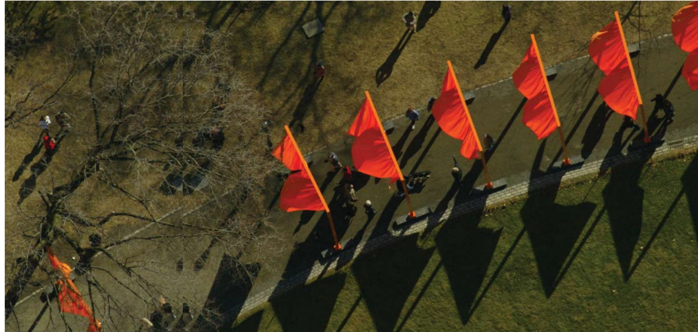
Aerial view of The Gates in Central Park, Manhattan