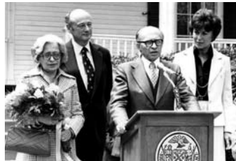
Prime Minister Menachem Begin of Israel speaks to the press, accompanied by his wife, Aliza (at left), Mayor Koch, and future Commissioner of Cultural Affairs Bess Myerson, 1978

MAYOR KOCH appoints Bess Myerson Commissioner of Cultural Affairs.