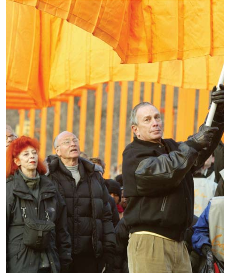
Christo, Jeanne-Claude and Mayor Bloomberg at the opening of The Gates , Manhattan