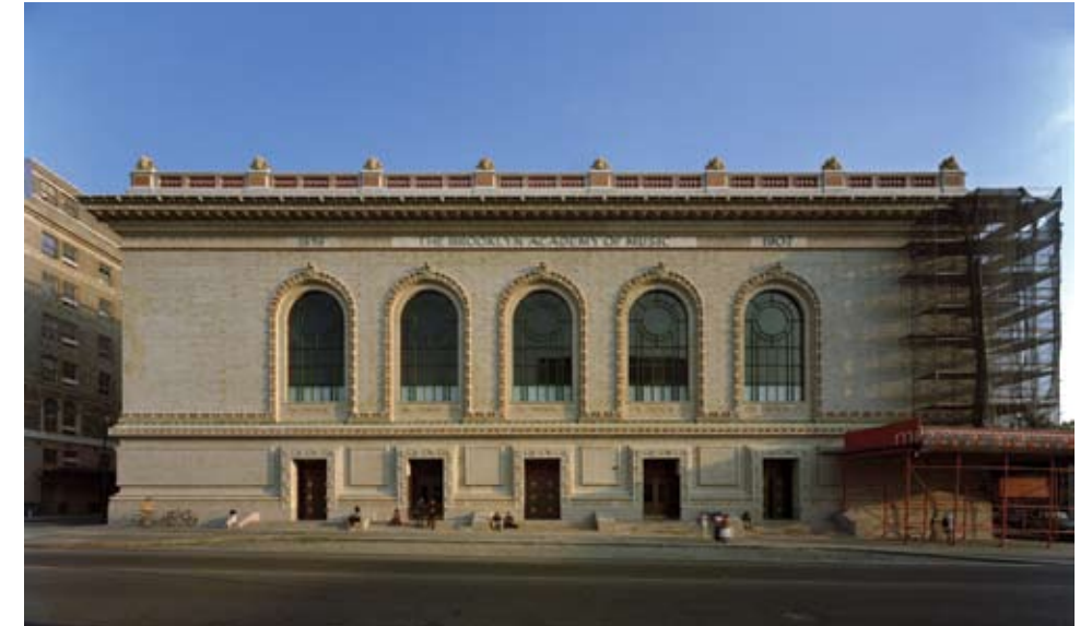
top: Brooklyn Academy of Music, Peter Jay Sharp Building

Working with other City agencies, the Lower Manhattan Development Corporation (LMDC), and the Lower Manhattan Cultural Council, DCA has focused on creating and expanding permanent cultural spaces throughout Lower Manhattan . In addition, since 2005, DCA has served as the conduit through which The September 11th Fund is administering $4 million in grants. To date, six organizations have received funding, and additional projects are currently under consideration. DCA served as a key member of LMDC's Cultural Enhancement Fund advisory panel, making recommendations for allocations out of a $35 million fund. In 2006, nearly $28 million in Cultural Enhancement grants, ranging from $20,000 to $2 million, was awarded to 63 arts organizations, which are expected to leverage more than $410 million in investments for cultural organizations below Houston Street.