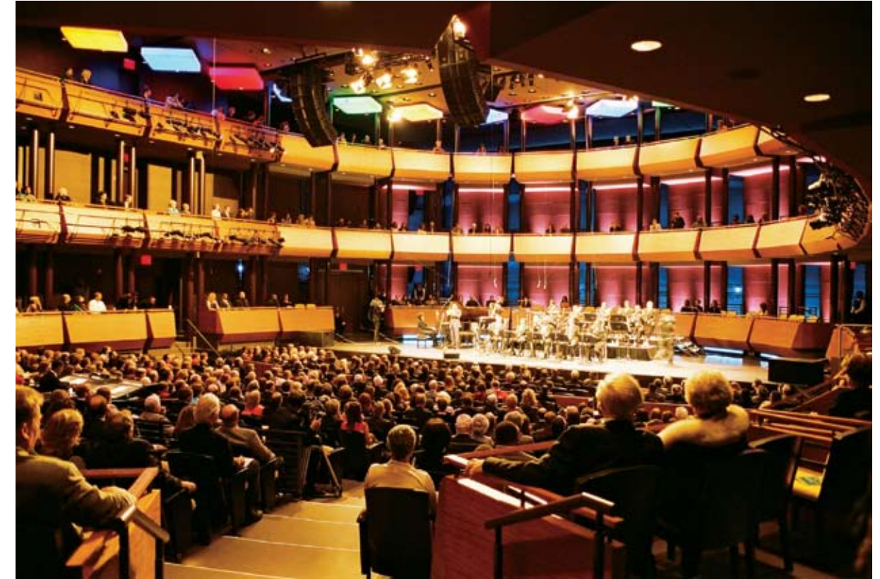
Jazz at Lincoln Center Orchestra at Rose Theater, Frederick P. Rose Hall, home of Jazz at Lincoln Center

To celebrate artistic excellence and bring attention to New York City’s artistic community, The Mayor’s Awards for Arts & Culture were created in 1976 and presented almost annually until 1994. In 2004, after almost a decade, the Commission revived the awards. To date, 27 awards have been awarded at ceremonies at Gracie Mansion and Jazz at Lincoln Center to the individual artists, cultural organizations, corporate funders, and philanthropists who contribute to the City’s creative vitality and economic well-being. ■