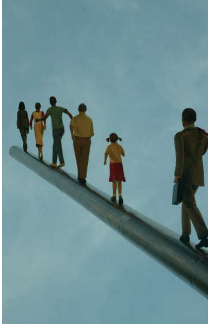
Jonathan Borofsky's Walking to the Sky at Rockefeller Center (Public Art Fund), Manhattan