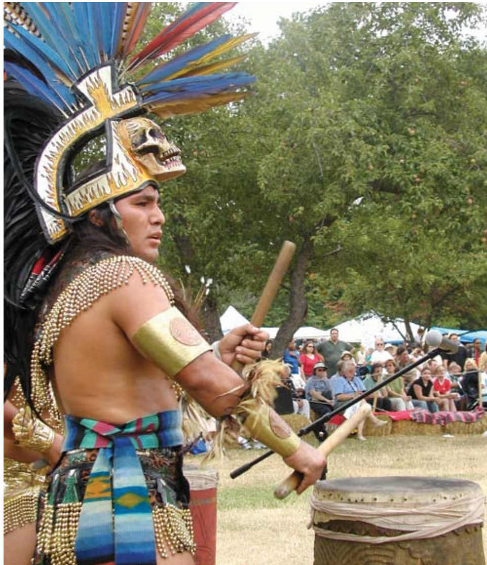
left: Pow Wow Performer, Queens County Farm Museum