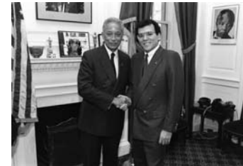
Cultural Affairs Commissioner Luis Cancel with Mayor David N. Dinkins, February 10, 1992

DCA receives matching funds from NEA to administer the Greater New York Arts Development Fund, providing local arts councils funds to re-grant to emerging arts groups.