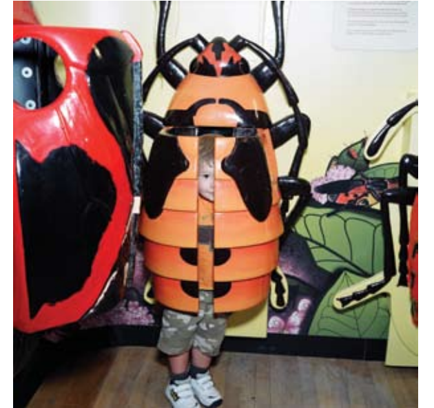
left: A Studio in a School fourth grade student at PS 196 in Brooklyn painting a plexiglass medallion, part of the group project Megaflora , which was based on the student's study of plant biology top: Bugs & Other Insects exhibition at the Staten Island Children's Museum