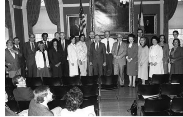
Cultural Affairs Commissioner Henry Geldzahler with Mayor Ed Koch and the Cultural Affairs Advisory Commission, April 30, 1981