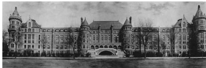
American Museum of Natural History, Exterior, South Façade, 77th Street, about 1900

A HISTORY OF NEW YORK CITY'S SUPPORT FOR THE ARTS