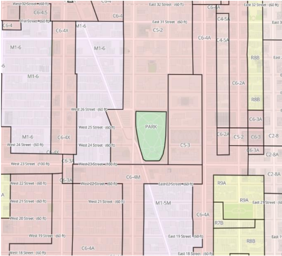
Exhibit D - Land Use Map