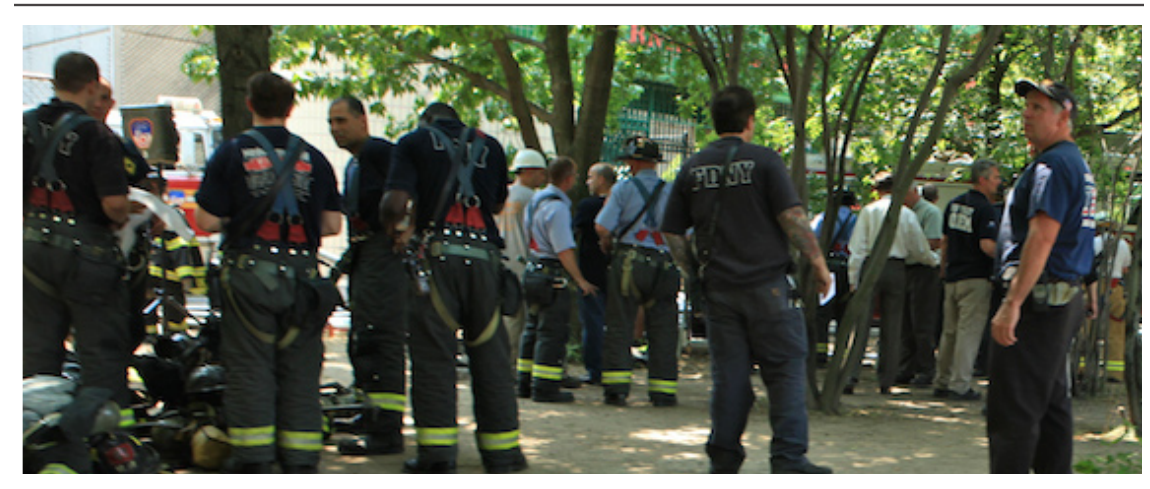
OEM responds to a fire at the North River Wastewater Treatment Plant in Harlem on July 20, 2011.