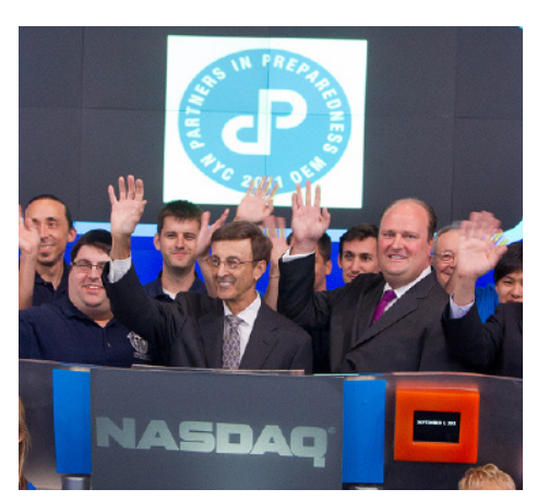
In honor of National Preparedness Month, OEM closed the NASDAQ in Times Square on 9/1.

Kick-off events took place this year at the MetroTech Center in Brooklyn, the Hub in the Bronx, Times Square, the Flushing Library and the Staten Island Ferry Terminal. Thanks to everyone who volunteered at one of the sites!