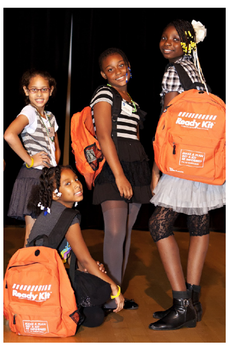
Students from Goldie Maple Academy in the Rockaways performed a song about having a Go Bag after their cartoon premiered at the reception.

On September 26, OEM honored the Red Cross in Greater NY, the NYC Department of Education, and New York University at the Partners in Preparedness Reception held at the American Museum of Natural History. OEM also premiered a student-produced cartoon, "Ready, Set, Prepare Yourself!" at the reception.