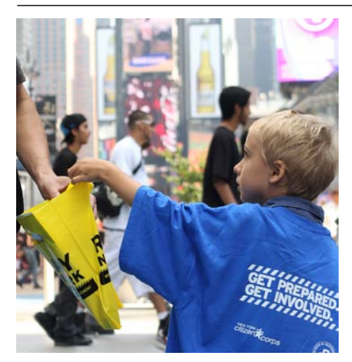
A young volunteer helps to hand out preparedness information on the streets of Times Square.

During September OEM hosted 57 emergency preparedness events, registered almost 2,000 people for Notify NYC, and teamed up with hundreds of public and private sector partners to prepare thousands of employees and volunteers through our Partners in Preparedness program. Here are some of the month's highlights: