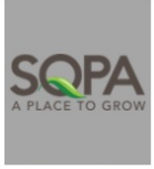
SOUTHEAST QUEENS PARK Association