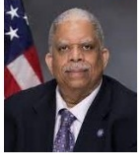
LEROY COMRIE Senator