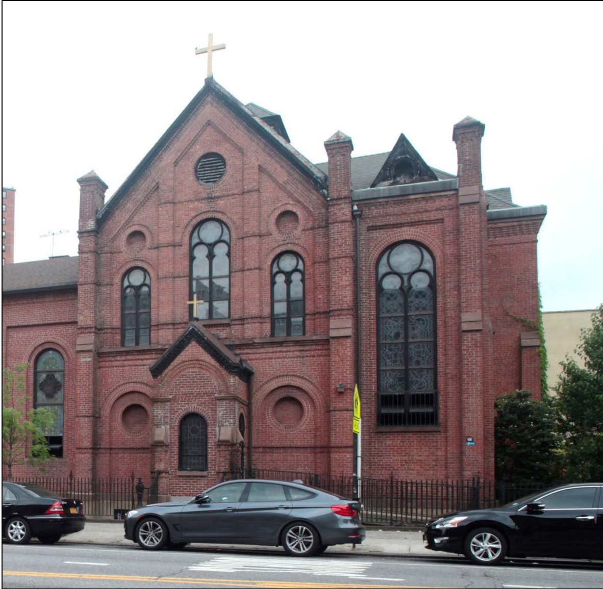
Church of St. Joseph of the Holy Family, 1889-90 Herter Brothers addition