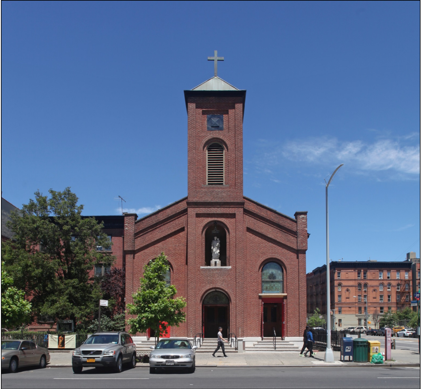
Church of St. Joseph of the Holy Family 401-403 West 125 th Street (aka 401-403 Dr. Martin Luther King Jr. Boulevard; 140-148 Morningside Avenue) Manhattan Block 1966, Lot 67 in part