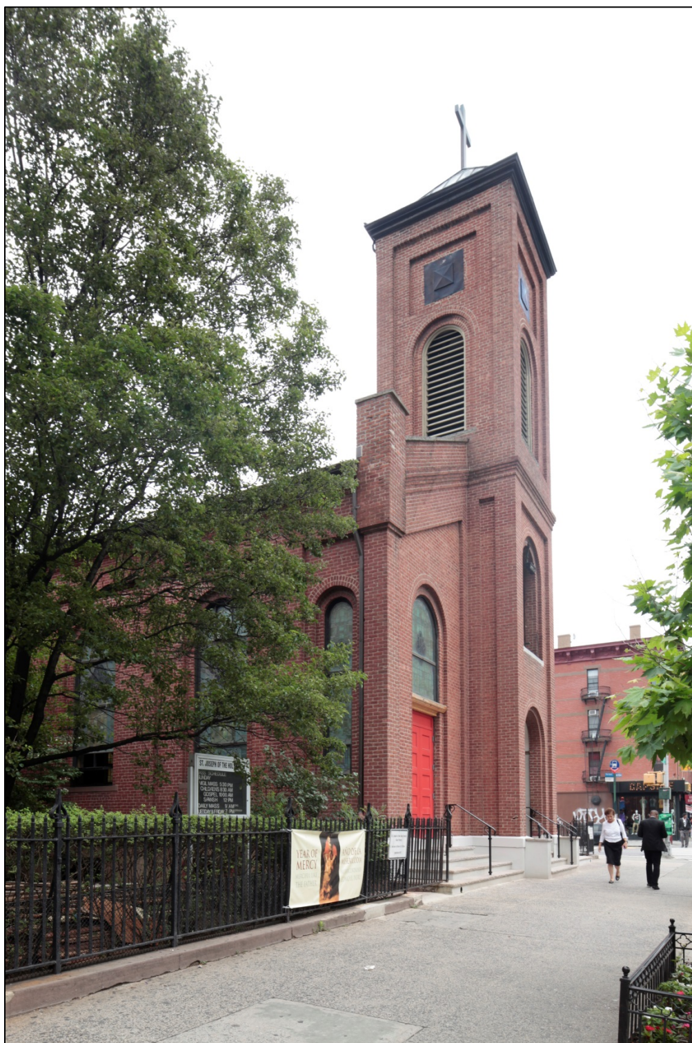
Church of St. Joseph of the Holy Family, west elevation