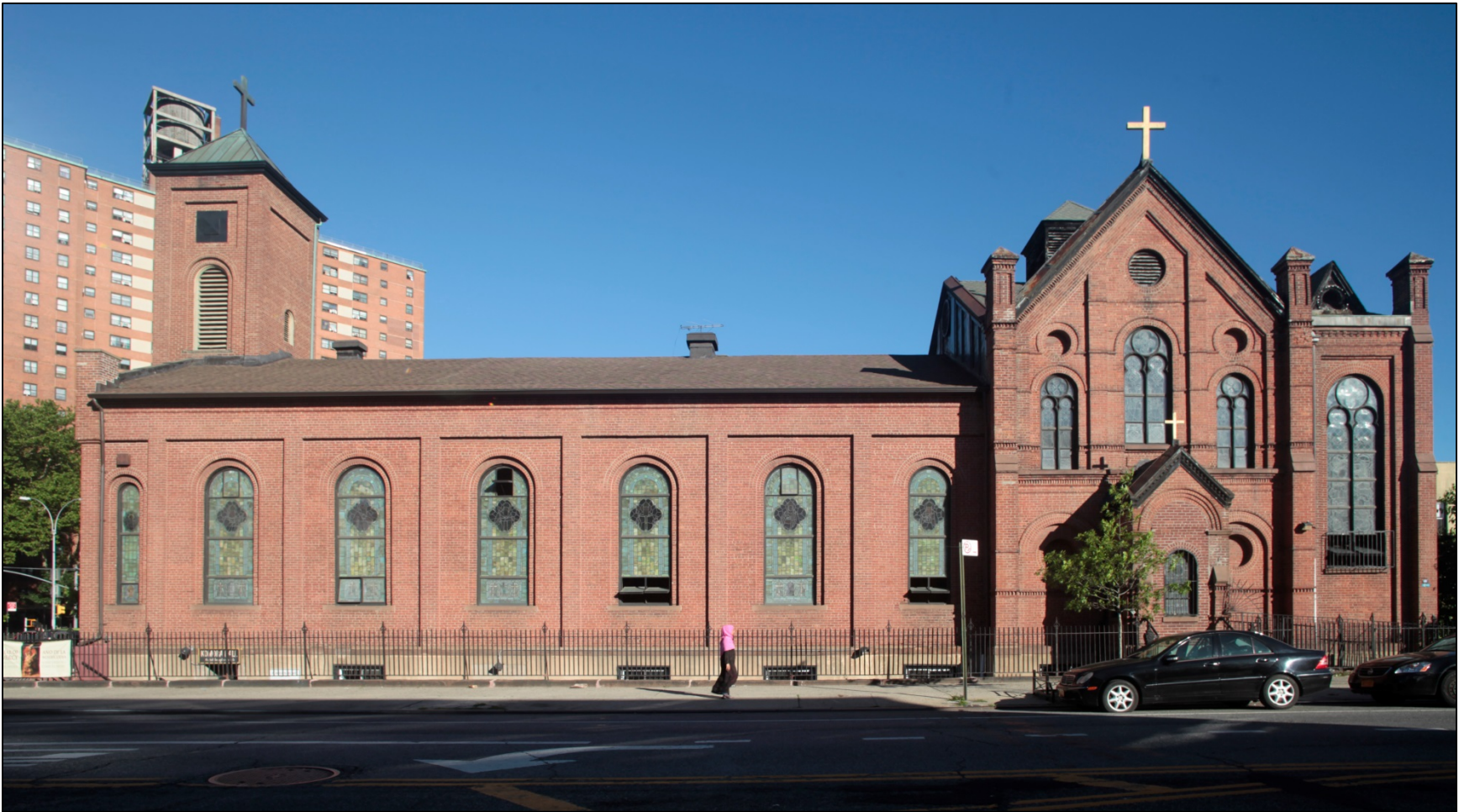
Church of St. Joseph of the Holy Family, east elevation Photo: Sarah Moses, 2016