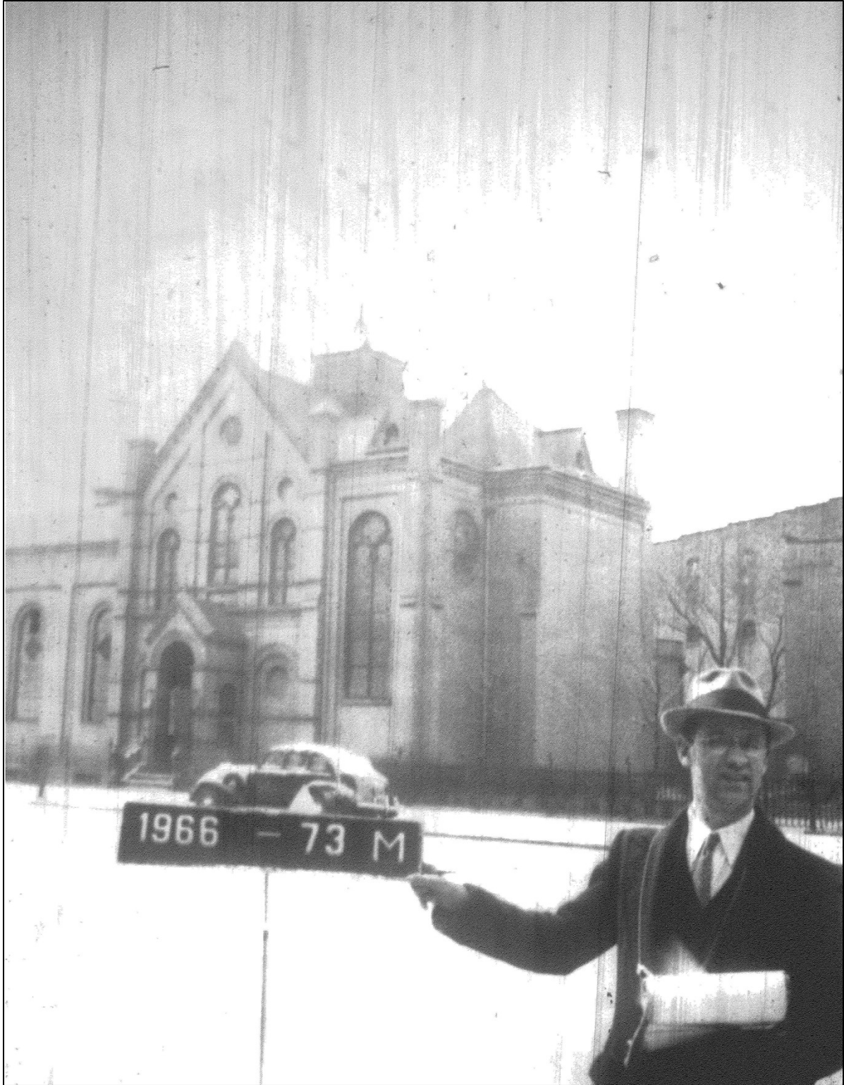
Church of St. Joseph of the Holy Family