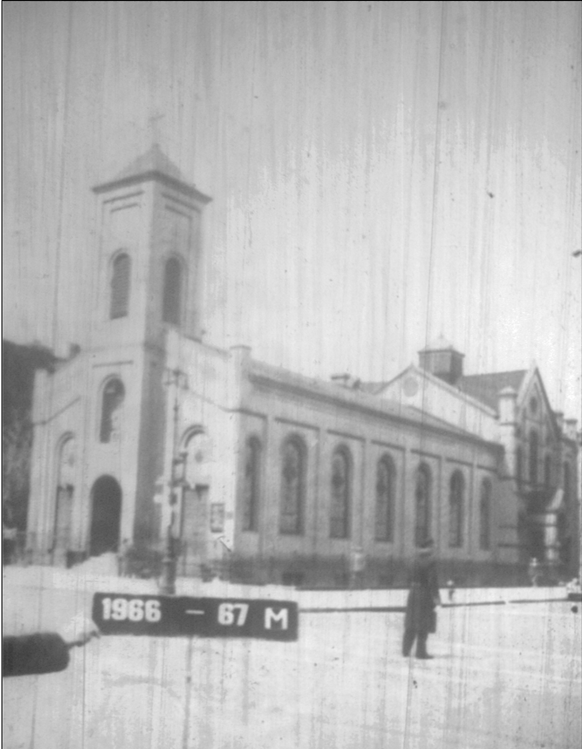
Church of St. Joseph of the Holy Family Photo: New York City Dept. of Taxes (c. 1940), Municipal Archives