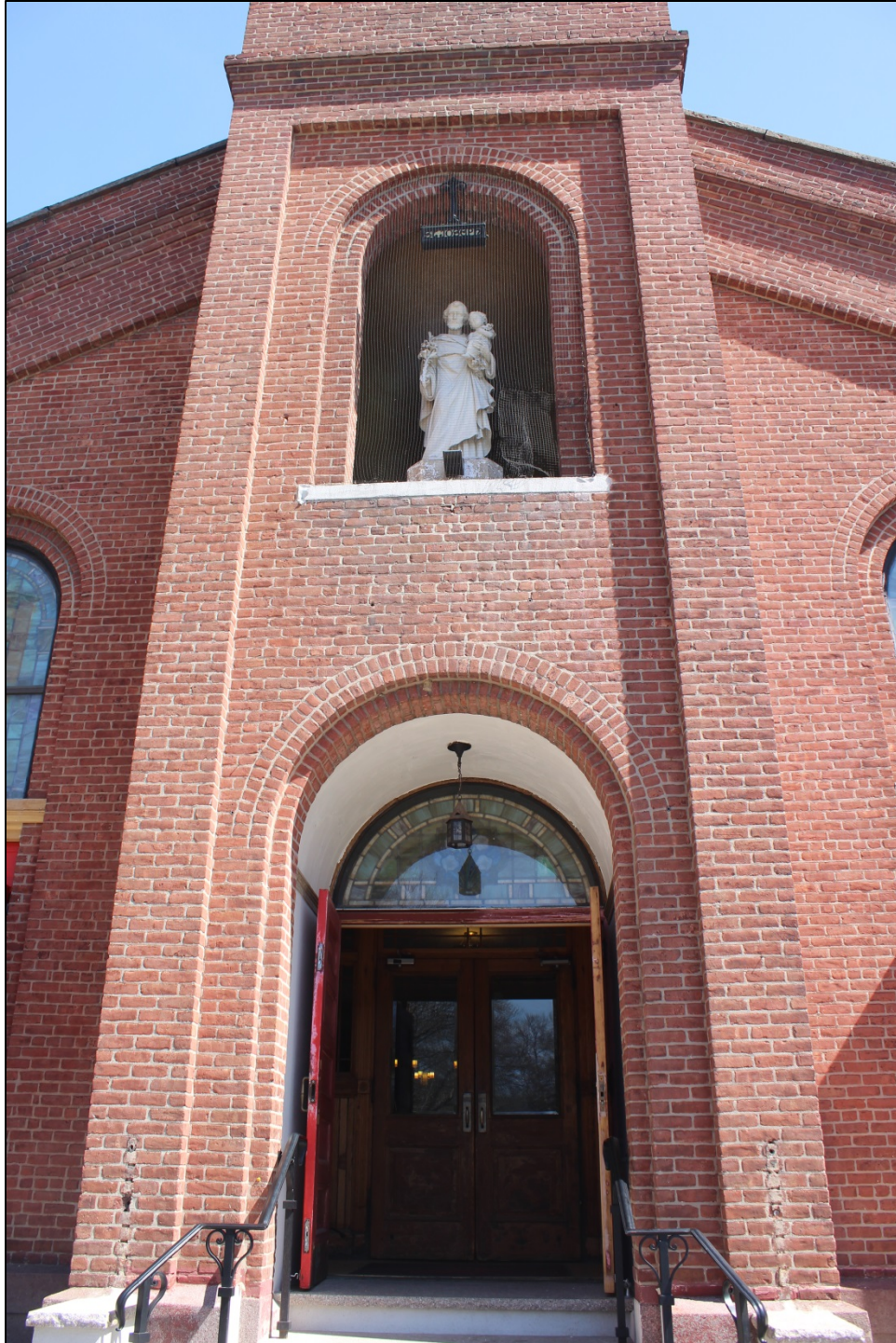
Main façade details Photo: Marianne S. Percival, 2016