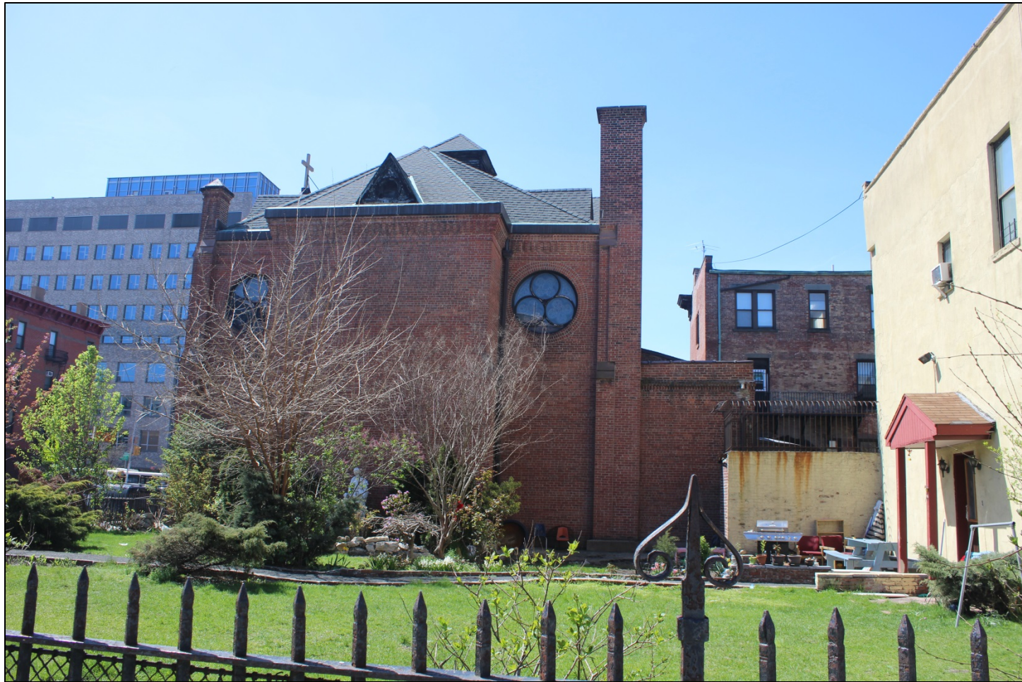
Church of St. Joseph of the Holy Family, north elevation