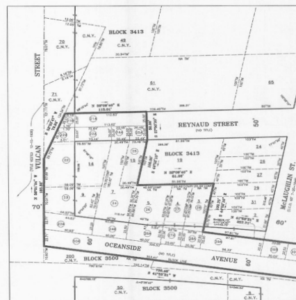
DETAIL (NOT TO SCALE OR PROPORTION)