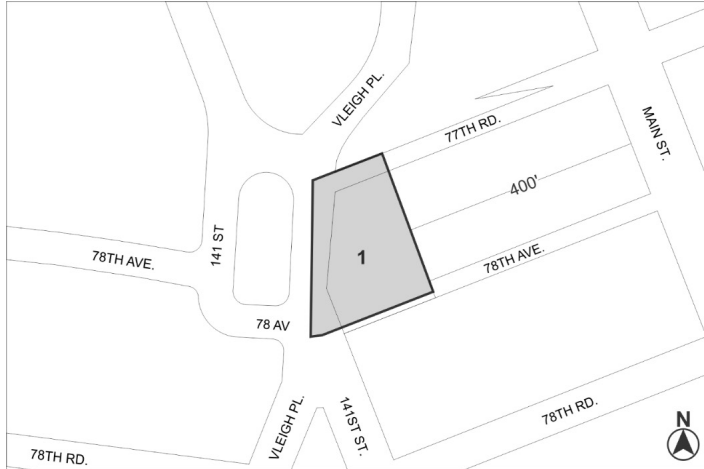
Area 1 — [date of adoption] — MIH Program Option 1 and Option 2