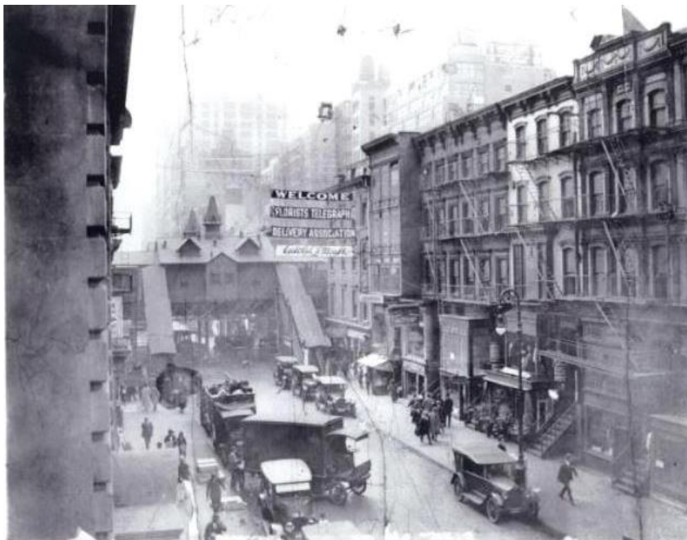
Banners welcome the Florists' Telegraph Delivery Association to West 28th Street in 1920