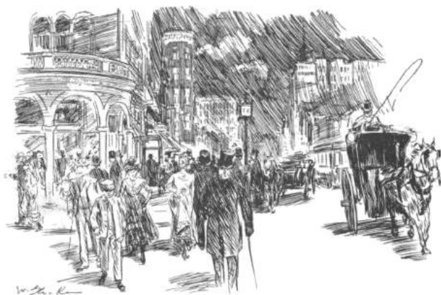
“That Fairyland of Theatres and gaudy Palaces which is Broadway.”

To host the influx of visitors and attract affluent newcomers, luxurious hotels arose from Madison to Herald squares to rival the elegant and exclusive Fifth Avenue Hotel (1859, demolished), including the Grand Hotel (1868, a designated New York City Landmark), Gilsey House (1869-71, a designated New York City Landmark), and numerous others that have since been demolished. 18 These hotels became venues for visitors to socialize, promenade, and take in of-the-moment entertainment, and for entertainment brokers and creatives to meet to meet, dine, and discuss business. 19