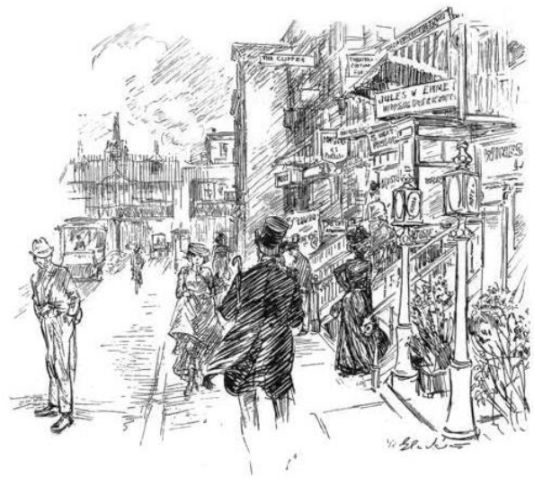
In Twenty-eighth Street.

There are an office and a reception-room, a music-chamber where songs are tried, and a stock-room. Perhaps, in case of the larger publishers, the music-rooms are two or three, but the air of each is much the same. Rugs, divans, imitation palms, make this publishing-house more studio, however, than office. A boy or two serve to bring professional copies at a word. A salaried pianist or two wait to run over pieces which the singer may desire to hear. Arrangers wait to make orchestrations or take down the melody which the popular composer cannot