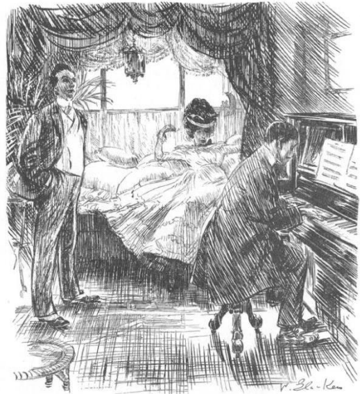
"In the exclusive Music-Room sits the Singer, critically listening."