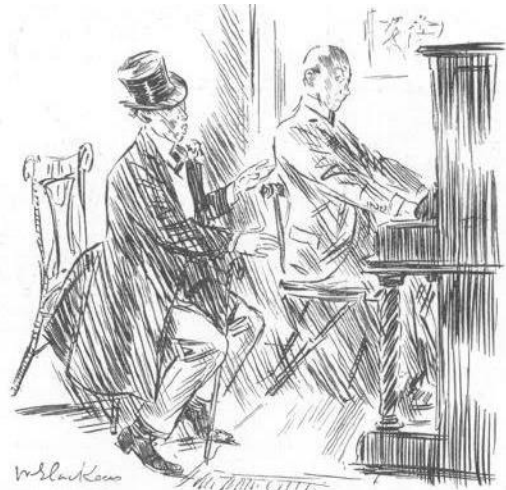
A Rehearsal in the Private Room.

(Right) Vignettes of the Tin Pan Alley streetscape and publishers' offices, William Glackens, Harper's Weekly XLIV, December 8, 1900