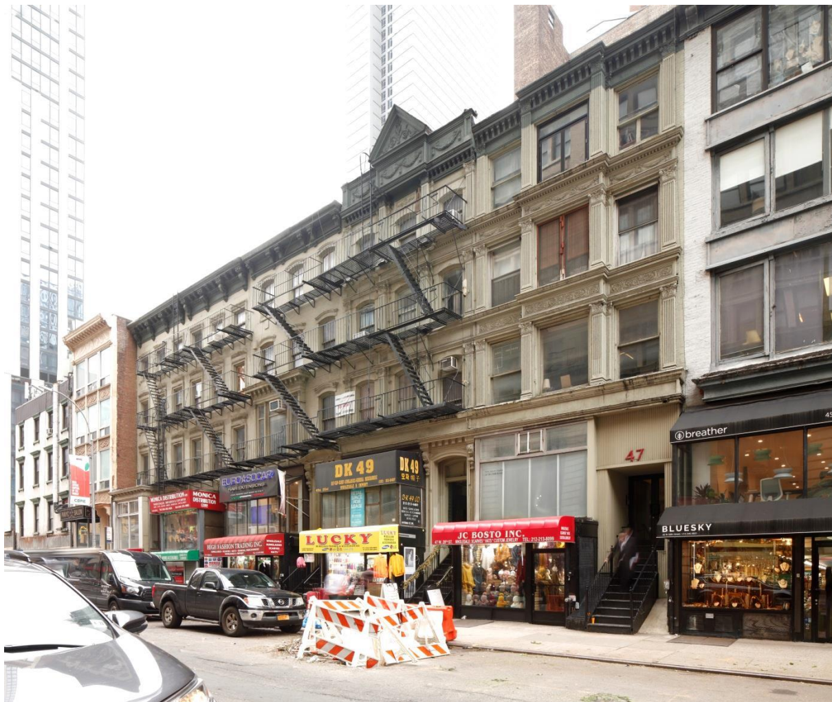
47-55 West 28th Street Buildings, Tin Pan Alley Landmarks Preservation Commission, December 2019