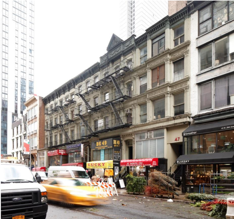
47, 49, 51, 53, and 55 West 28th Street, December 2019