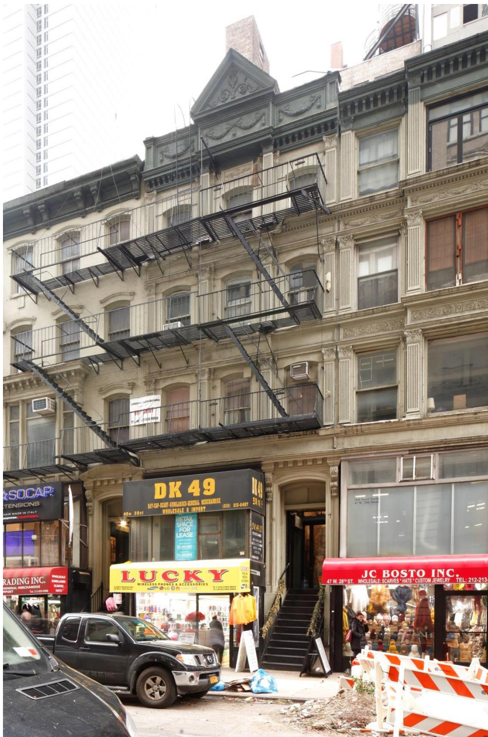
49 West 28th Street, Landmarks Preservation Commission, December 2019