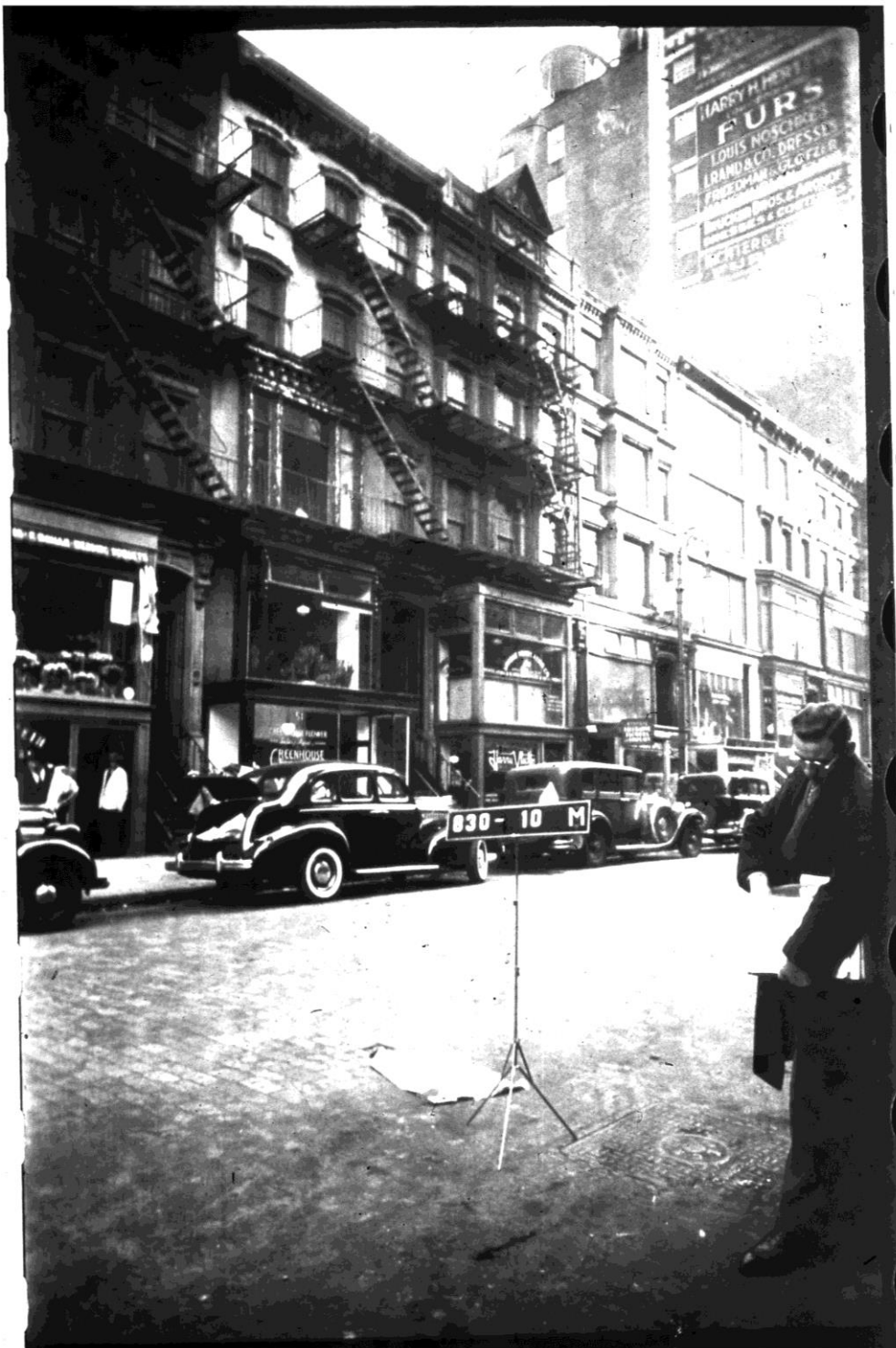
New York City Department of Taxes Photograph (c. 1938-43)