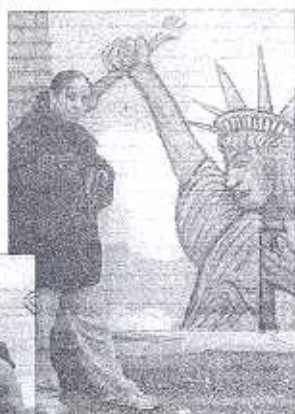
Students stand by their mural.