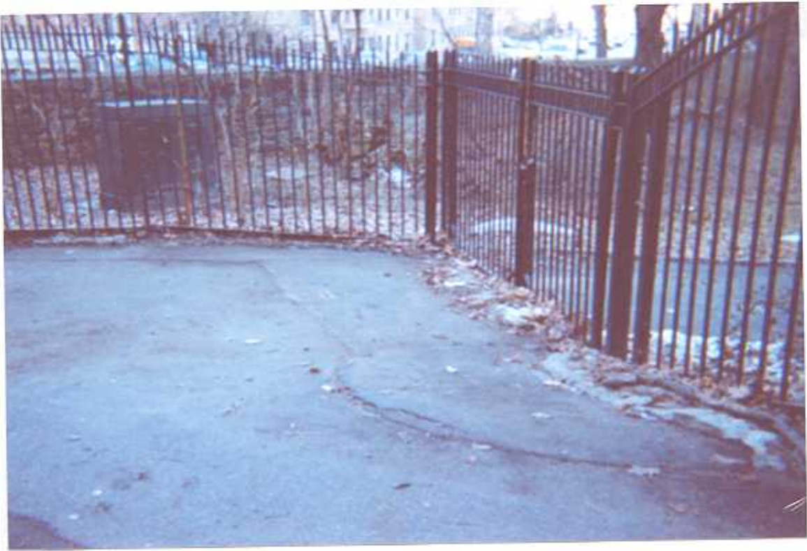
This is the way it look after we clean. CLEAN.