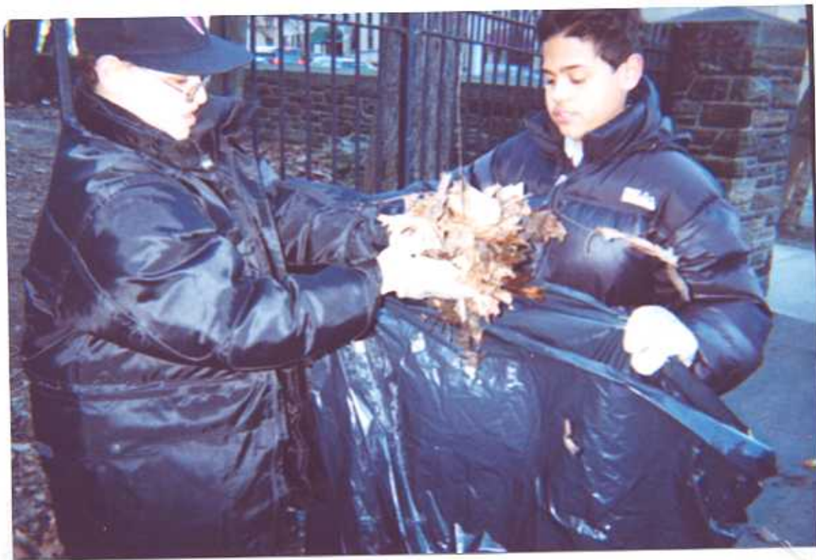
This and Aramis are picking up the leaves in the pile they have here.