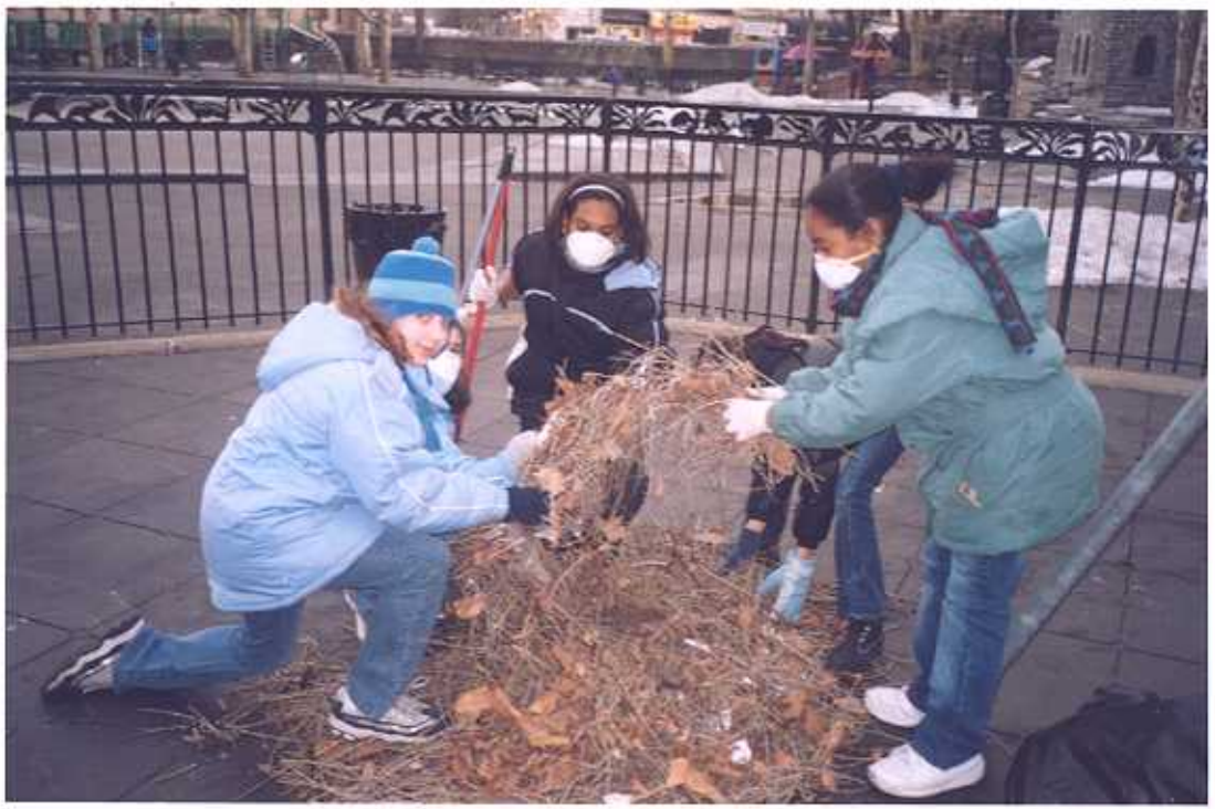
This picture shows us picking up the big pile we put together.