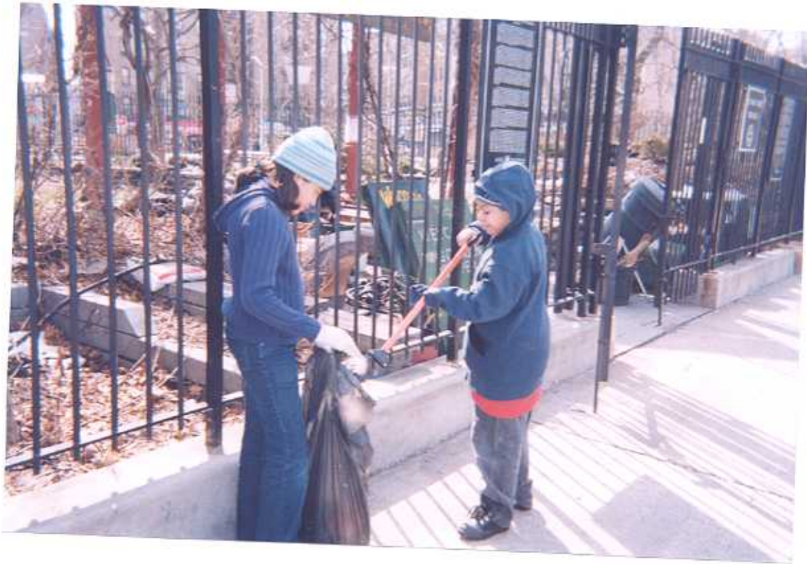
Separating the bottles and cans for recycling.