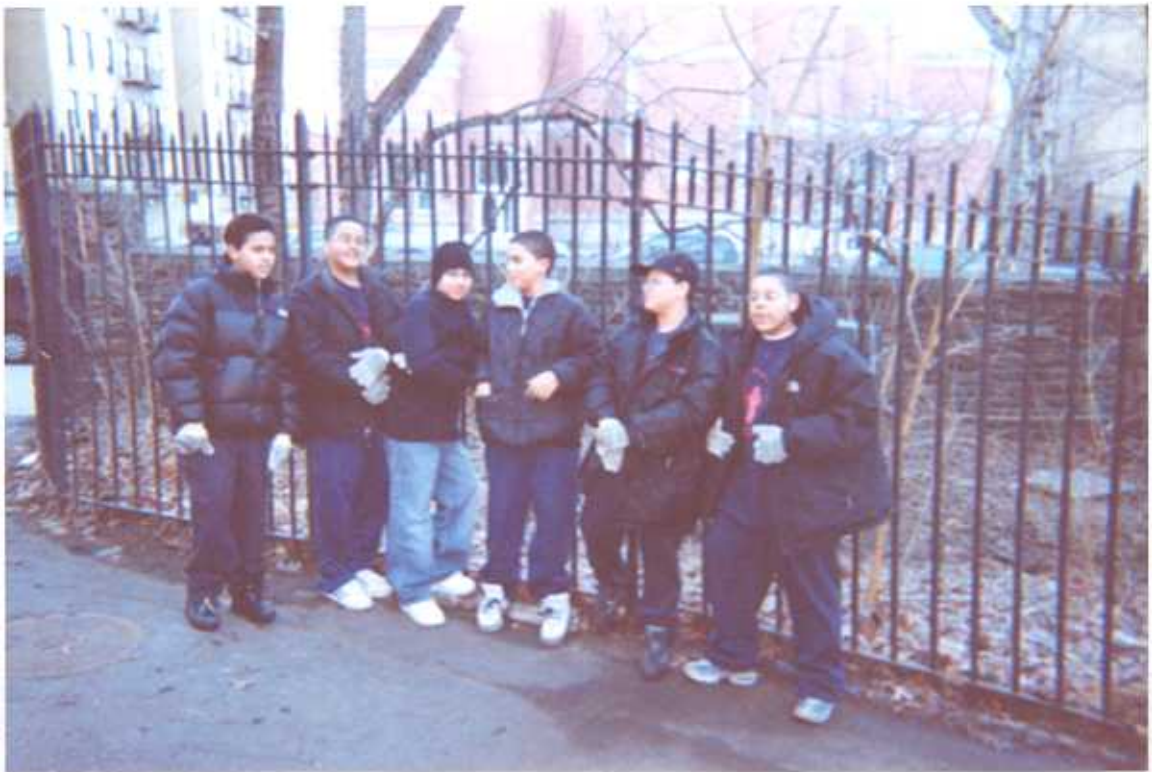
This is our group and we are proud to make our community more cleaner.