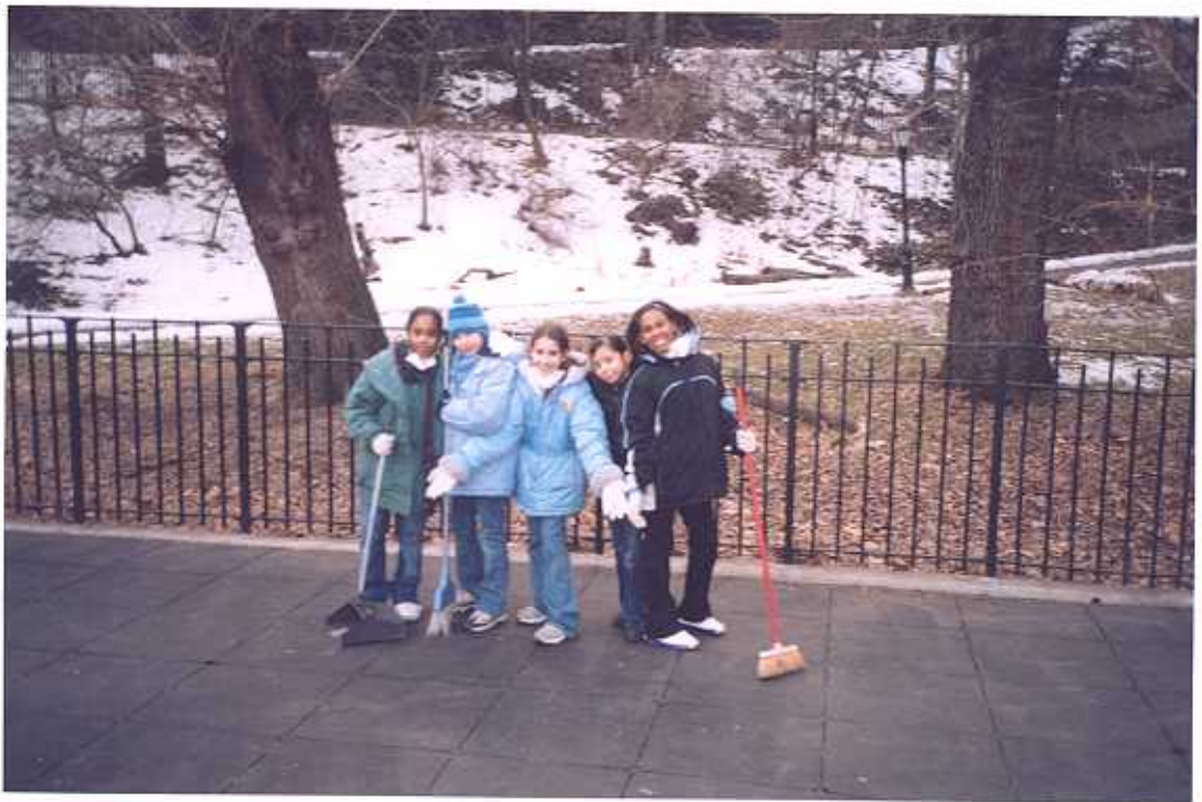
This picture shows all of us posing and showing how clean it was then before we started.