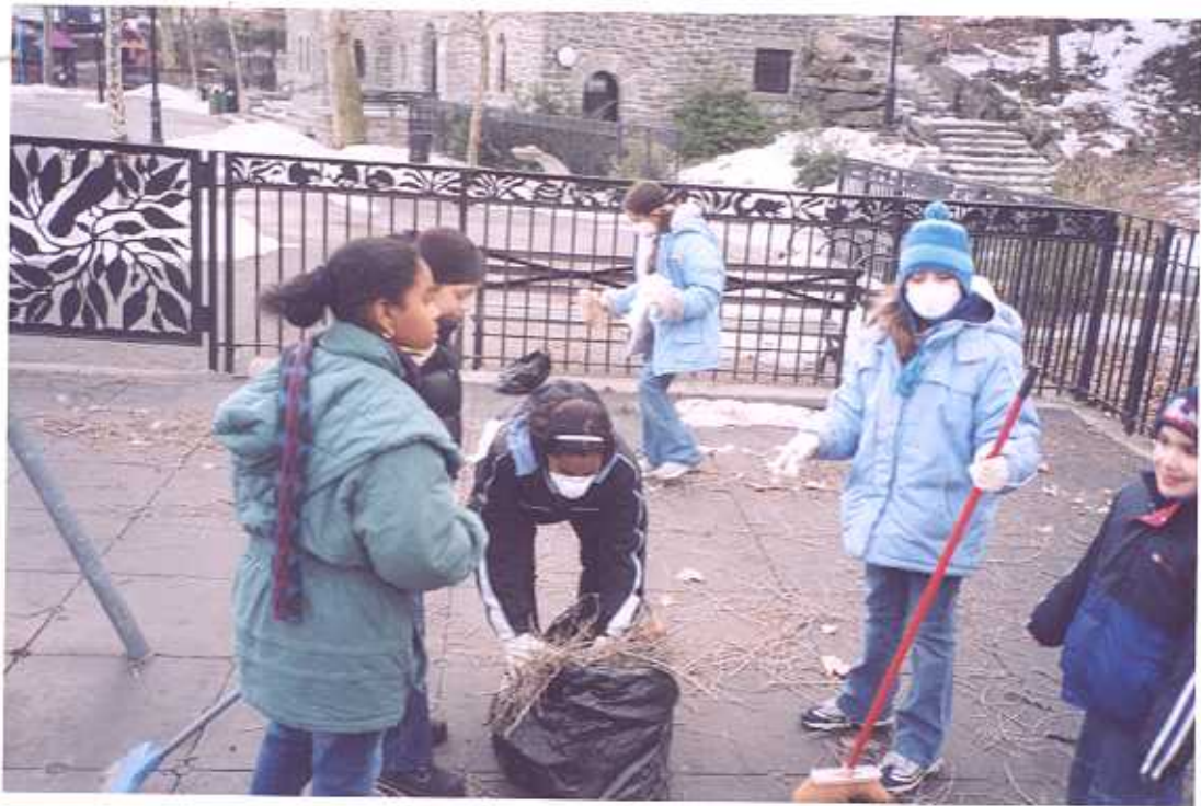
This picture shows all of us picking up garbage