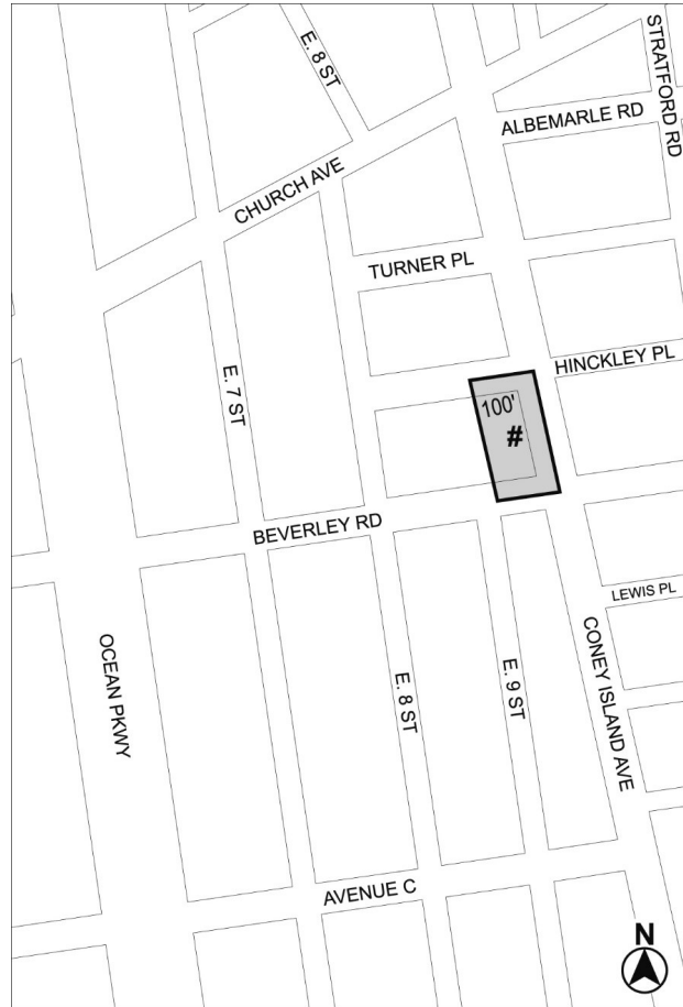
Mandatory Inclusionary Housing Program Area see Section 23-154(d)(3) Area # – [date of adoption] MIH Program Option 1 and Option 2

Portion of Community District 12, Brooklyn