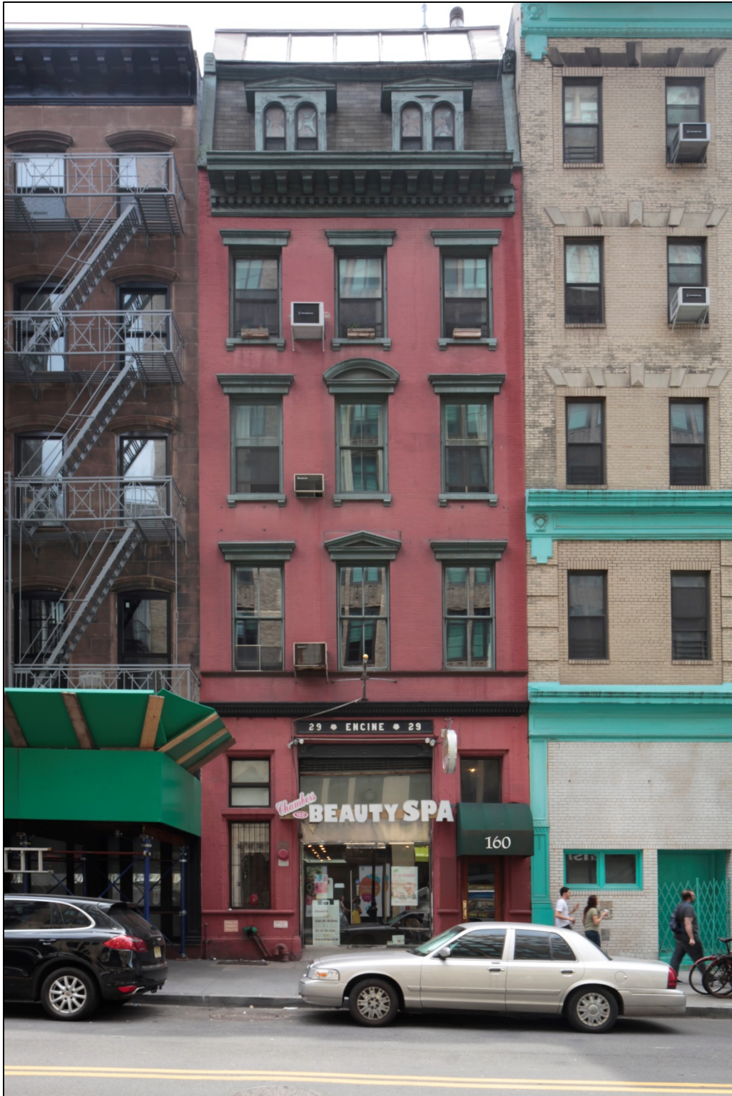
Main Façade of (Former) Firehouse, Engine Company 29, 160 Chambers Street, Manhattan