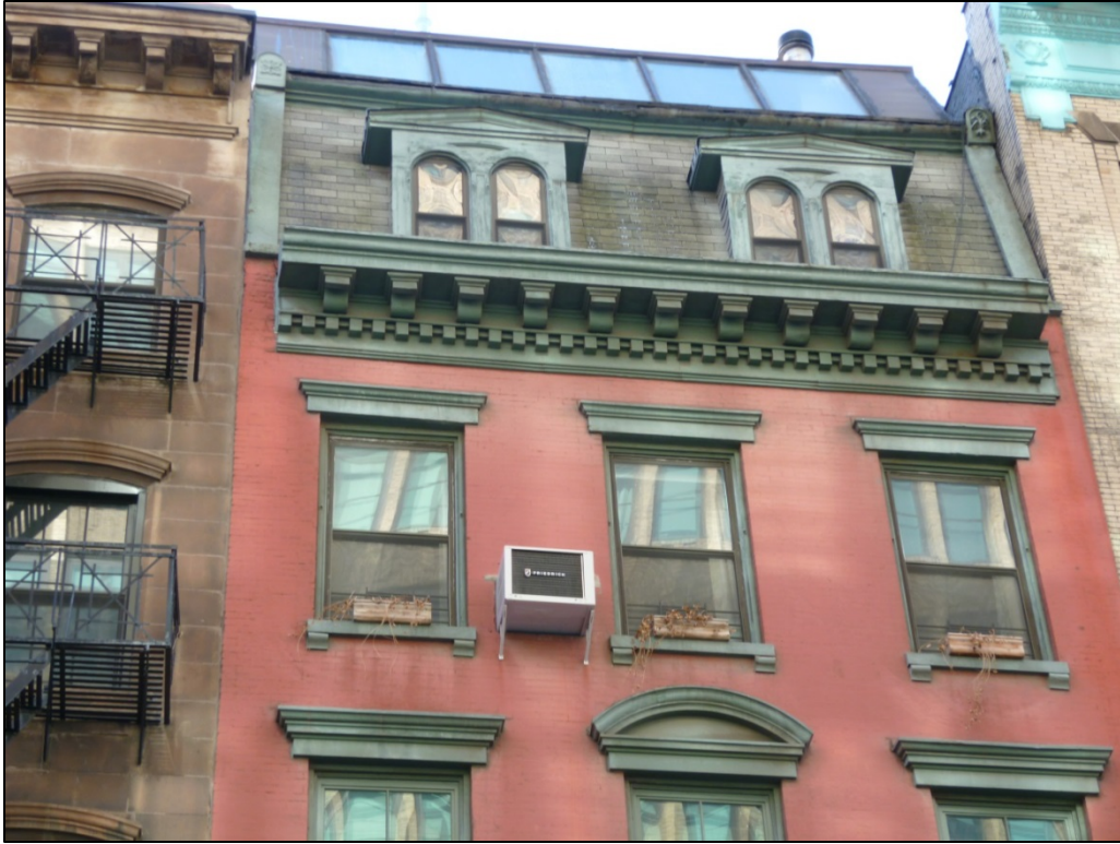
Detail of Mansard Roof and Upper Stories