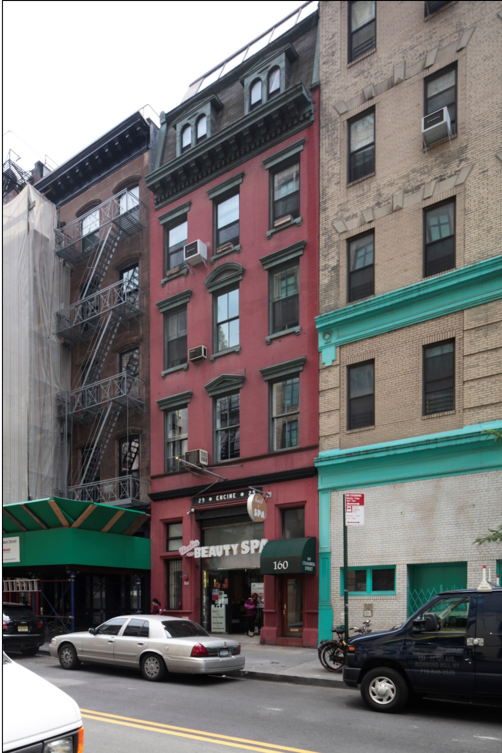
Main Façade from West Photo: Sarah Moses, 2016