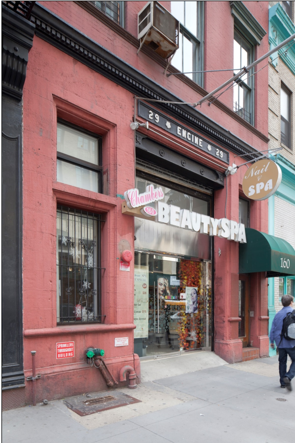
Detail of Base