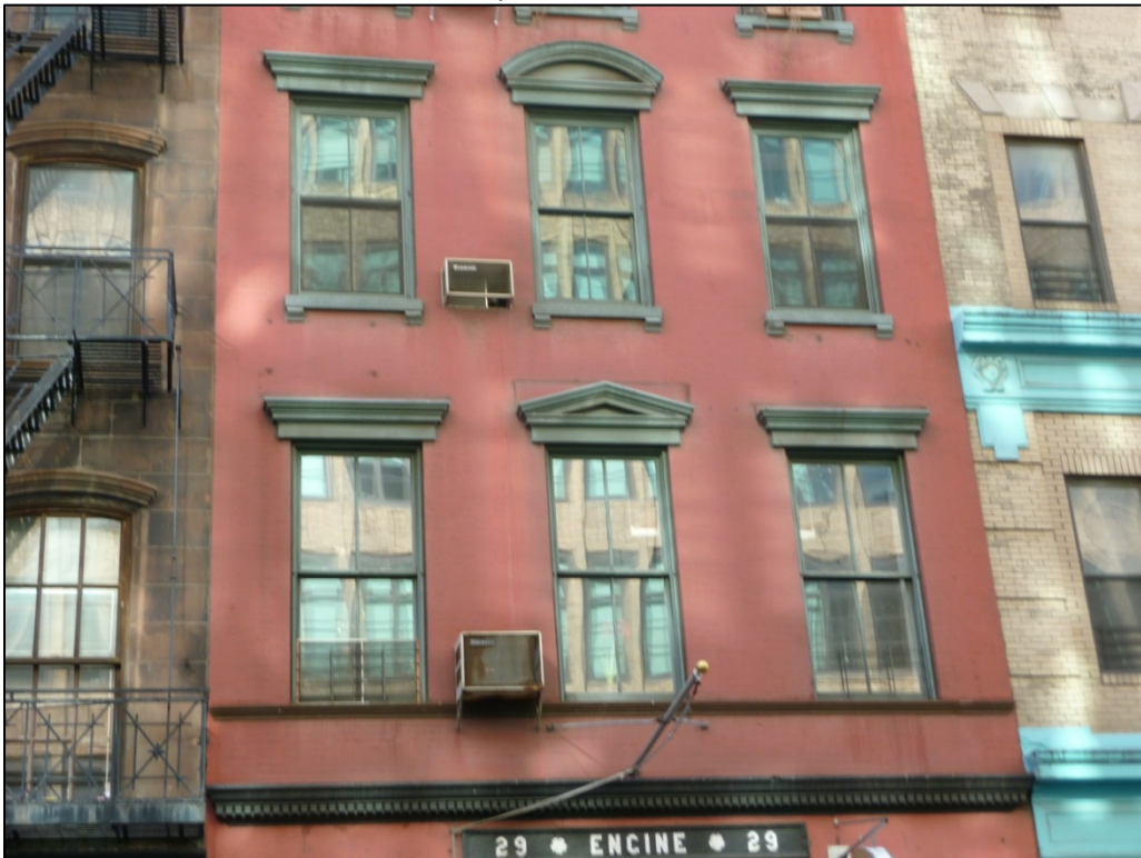
Detail of Windows