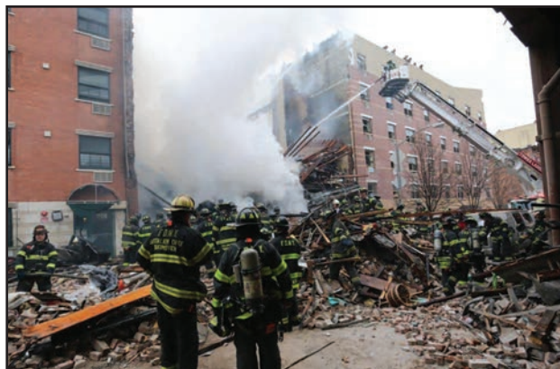
The incident for which the members of Engine 58 are presented with the Lieutenant James Curran/New York Firefighters Burn Center Foundation Medal.