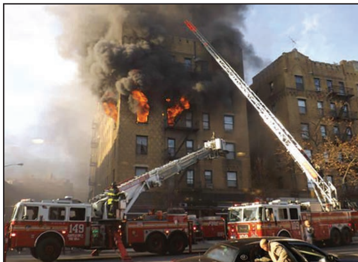
Ladder 149 members in action at Brooklyn Box 1199, 100th Street/4th Avenue, Bay Ridge, November 23, 2012.