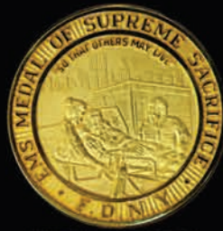
SUPREME SACRIFICE MEDAL