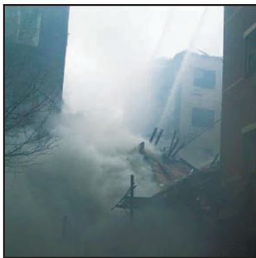
The area of the collapse/debris pile where two victims (the surviving woman is shown above) were found by Rescue 1 members following the March 12, 2014, Manhattan gas explosion/collapse.