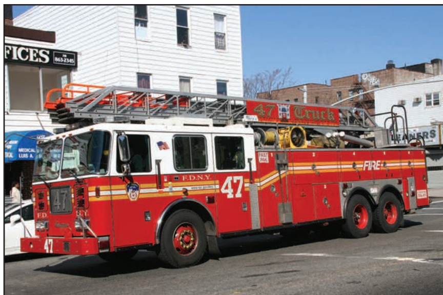
Ladder 47 apparatus.