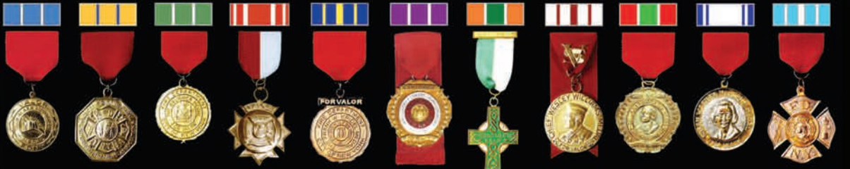
THIRD ALARM ASSOCIATION 1950