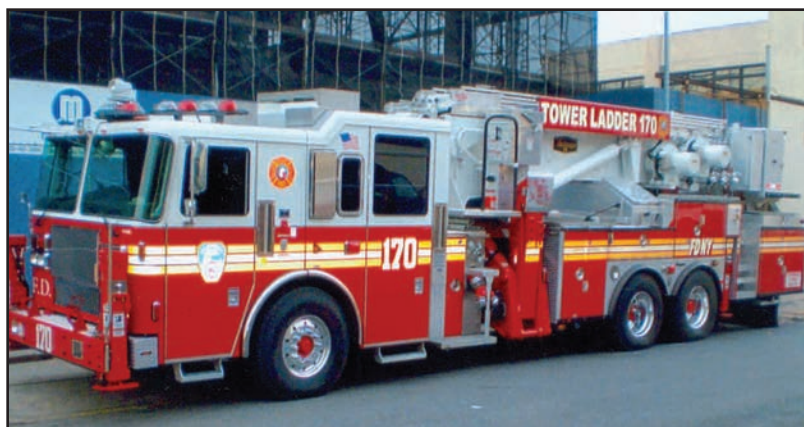
Ladder 170 apparatus.