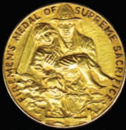
SUPREME SACRIFICE MEDAL