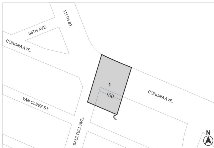
Mandatory Inclusionary Housing Area see Section 23-154(d)(3)

Area 1 — [date of adoption] — MIH Program Option 1 and Option 2