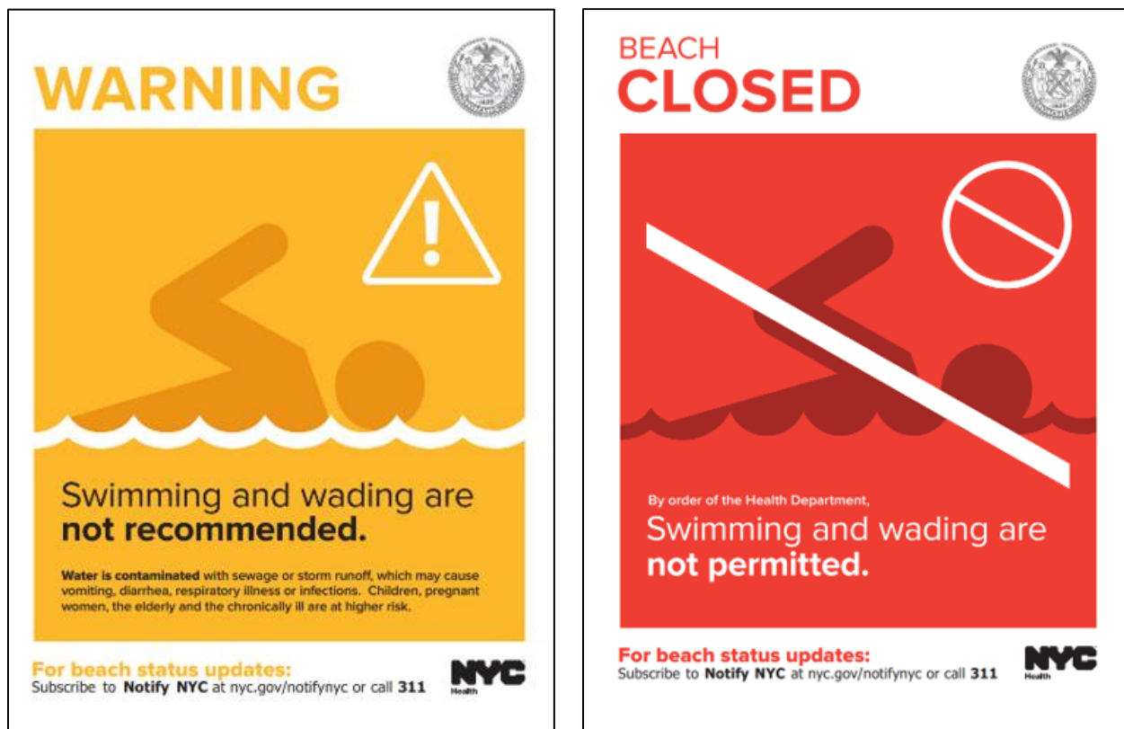
FIGURE 2: BEACH ADVISORY AND CLOSURE SIGNS

“Know Before You Go” Texting Service: The “Know Before You Go” texting service, introduced in 2014, was discontinued for the 2025 beach season. Instead, the Notify NYC app will be used for alerts and notifications in coordination with other city agencies as described below. All text messaging users were notified on how to sign up for Notify NYC and that they may also view beach status on our Beach Water Quality website and from onsite signage.