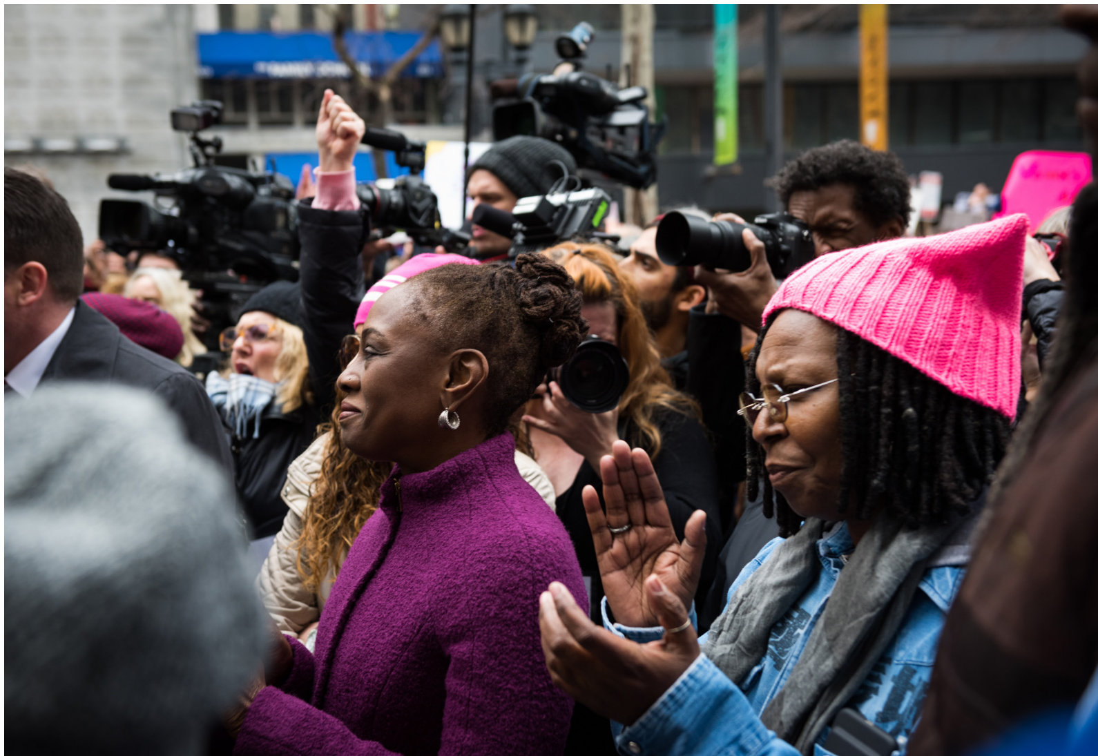
First Lady of New York City Chirlane McCray and Whoopi Goldberg at the New York City Women's March. January 21, 2017