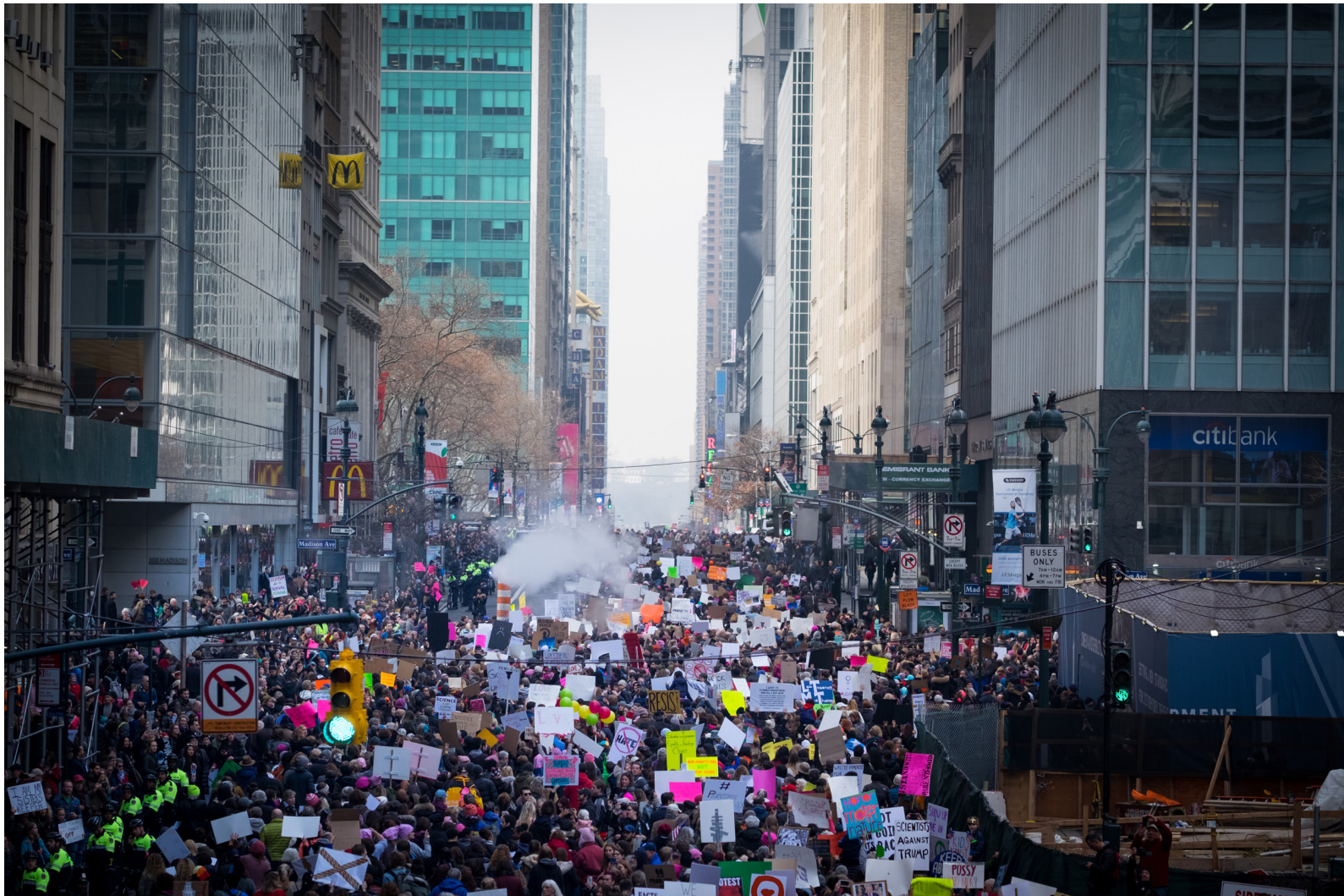
Participants at the New York City Women's March. January 21, 2017