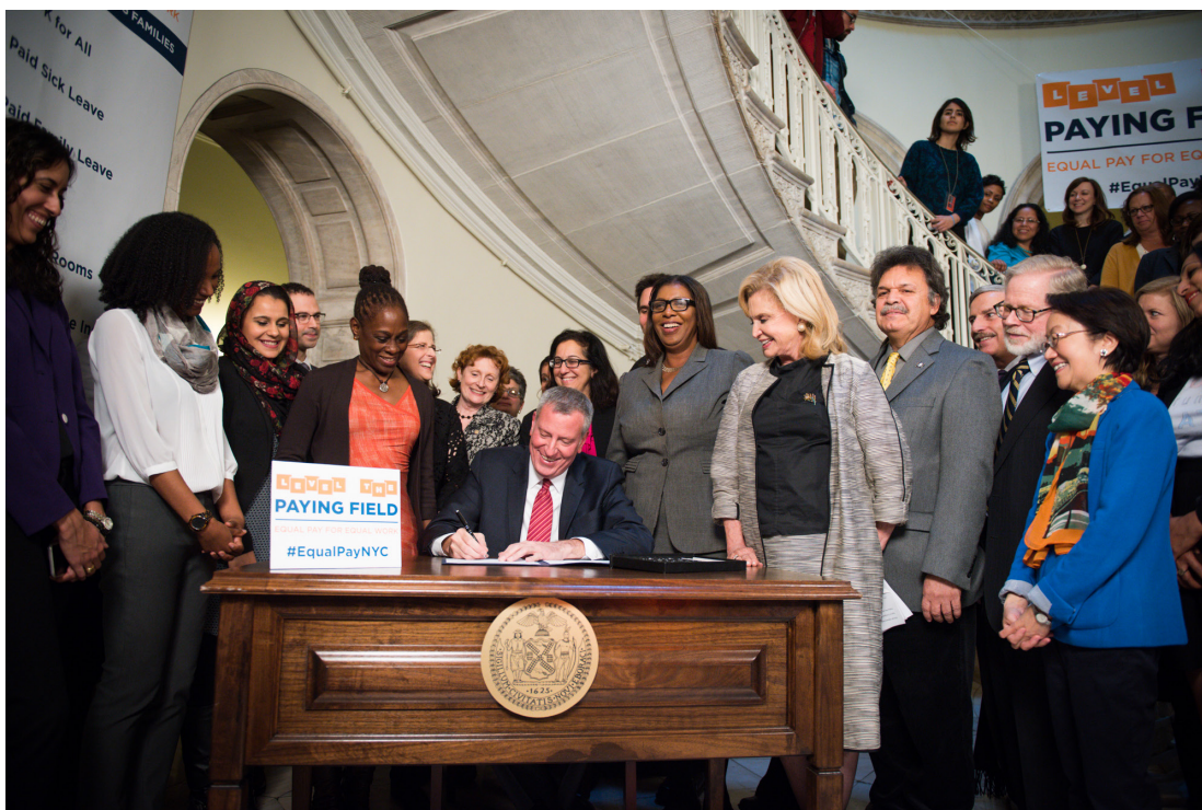
Mayor Bill de Blasio signing salary history ban legislation. 2017

This program reinforced the importance of connecting New York City's gender equity progress to similar progress across the globe.