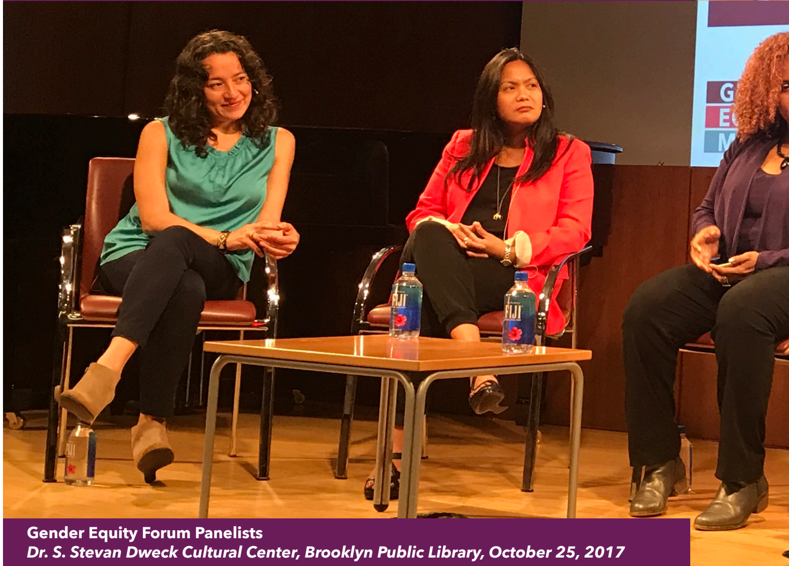
Gender Equity Forum Panelists Dr. S. Stevan Dweck Cultural Center, Brooklyn Public Library, October 25, 2017