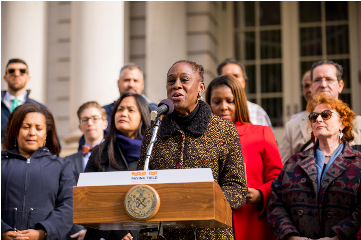
First Lady of New York City Chirlane McCray announcing the introduction of New York City's salary history ban. October 31, 2017