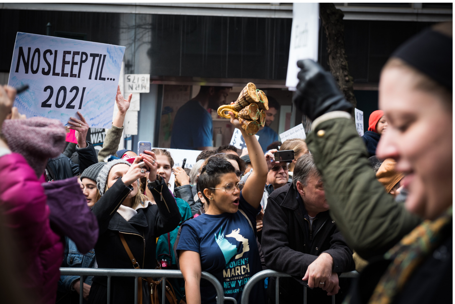
Participants at New York City Women's March. January 21, 2017