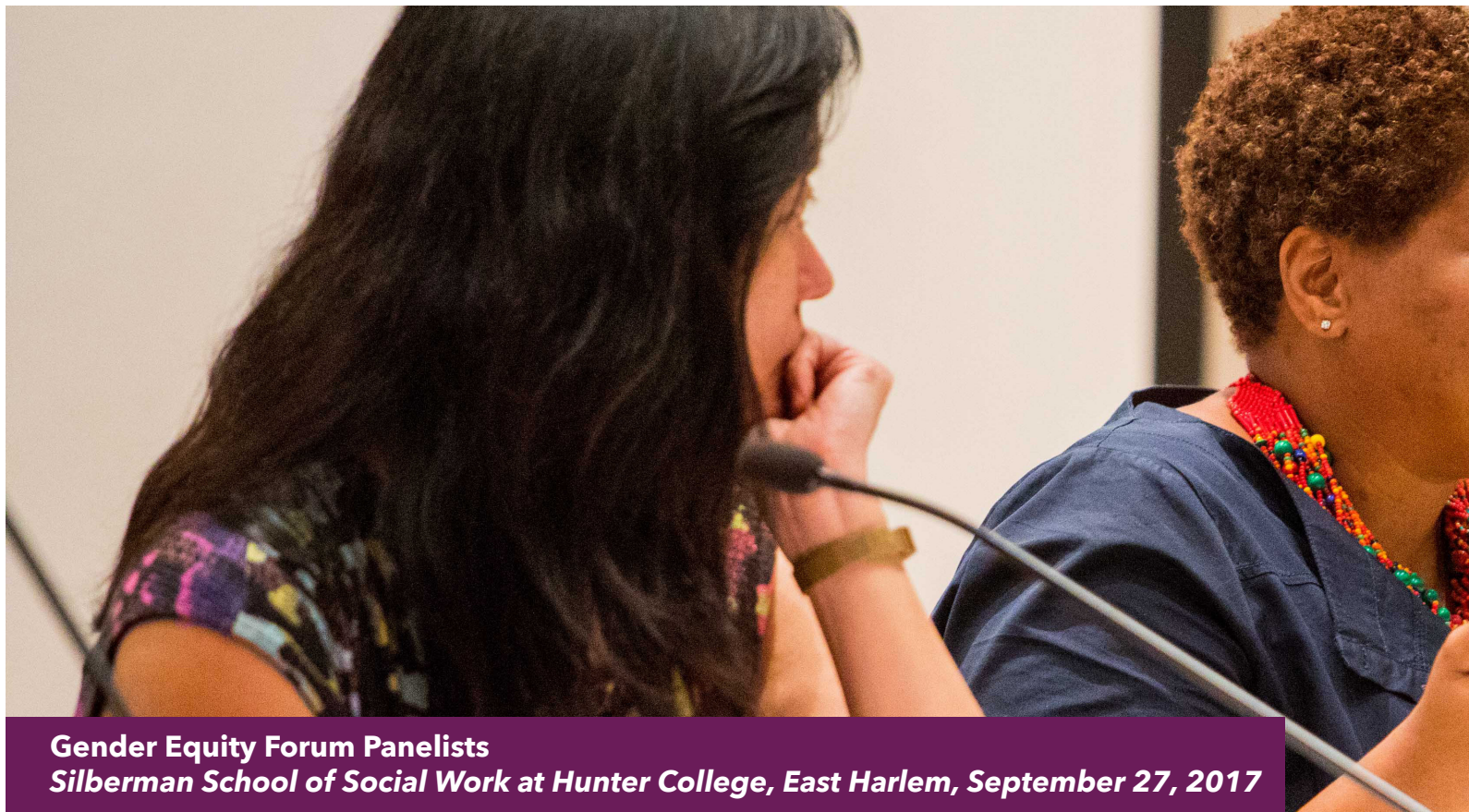
Gender Equity Forum Panelists Silberman School of Social Work at Hunter College, East Harlem, September 27, 2017