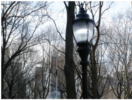
LED luminaire in Central Park