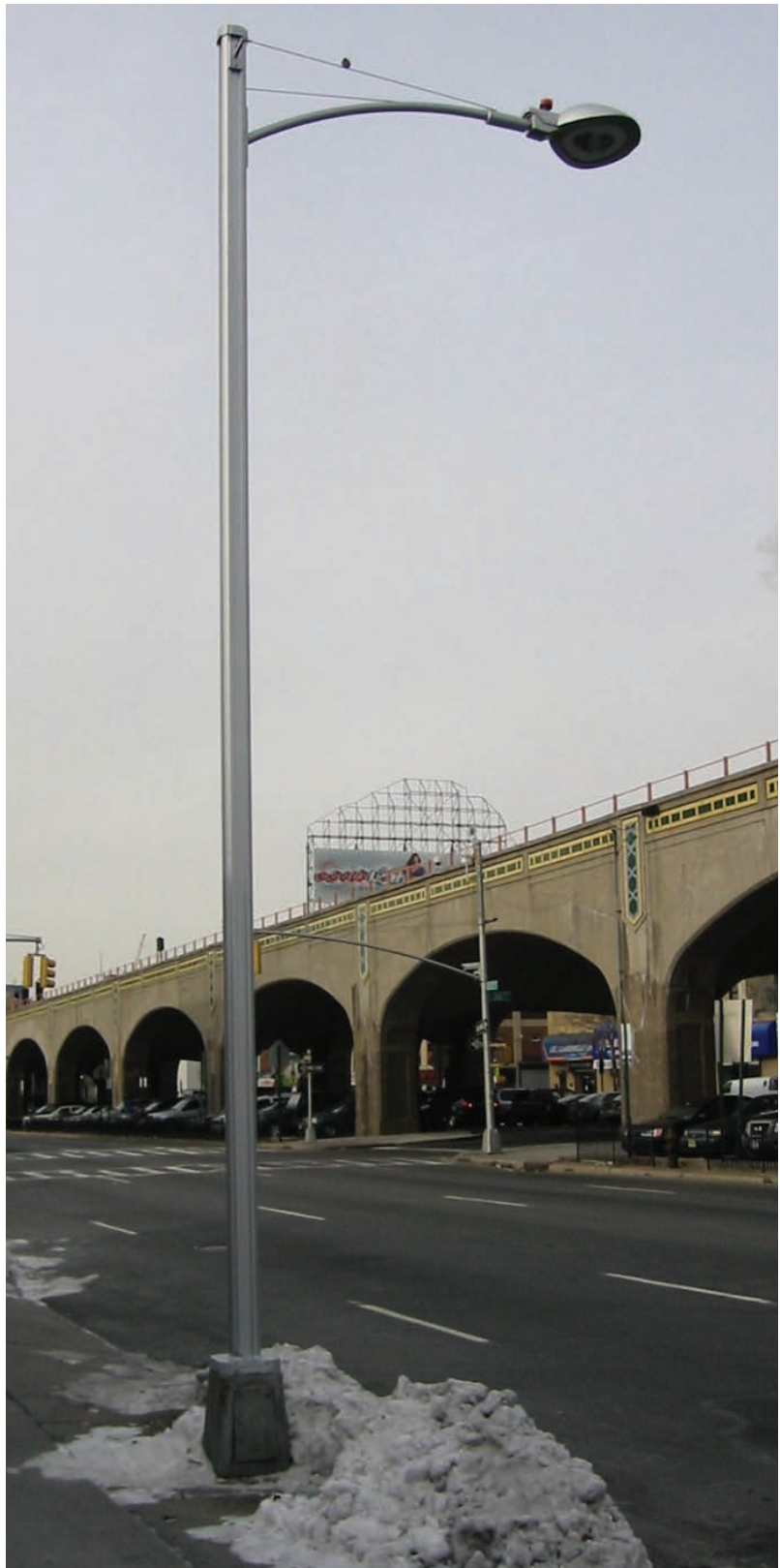
Helm luminaire and WM pole: 39th Street, Queens