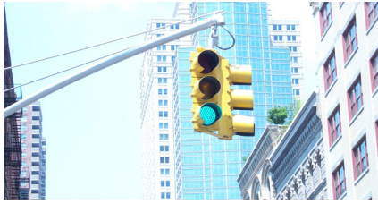
Typical NYCDOT LED traffic signal