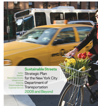
Sustainable Streets, DOT's Strategic Plan

Conversion to lower wattage cobra heads has reduced upward lighting, minimized glare and reduced greenhouse gas emissions