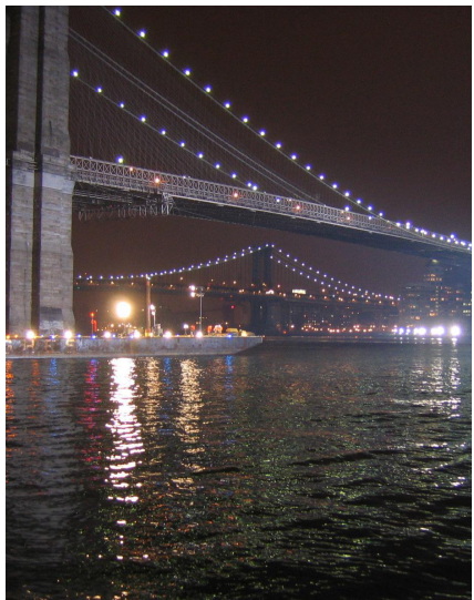
The Brooklyn and Manhattan bridges at night