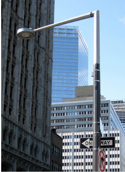
The Downtown Alliance's signature light fixture for use in Lower Manhattan