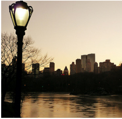
Central Park LED

LED lighting has a life expectancy 2 to 3 times that of HPS; deployment of LED lighting on highways may provide maintenance savings because of anticipated reduction in the frequency of service