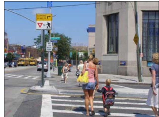
New pedestrian refuge island in east crosswalk of Coney Island Ave and Brighton Beach Ave