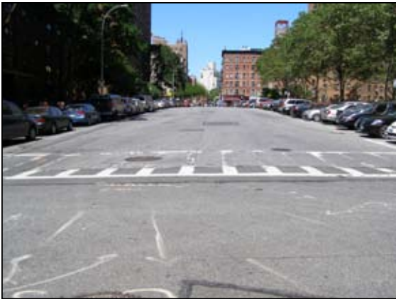
BEFORE: Rutgers Street from Cherry Street facing north