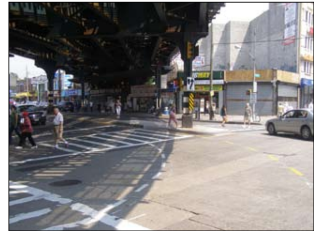
New pedestrian refuge island in north crosswalk of Coney Island Ave and Brighton Beach Ave under the elevated subway