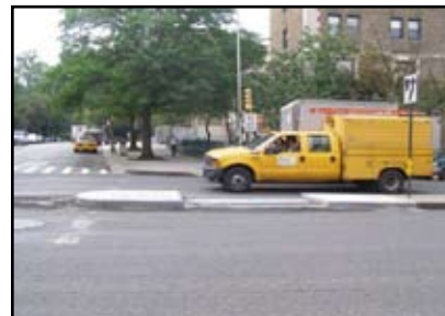
The concrete island on Northern Boulevard at Bowne Street was extended to provide a 'tip' to protect pedestrians using this crosswalk.