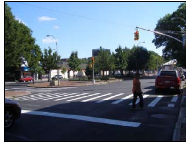
A new signal was installed on eastbound Northern Boulevard at Linden Place. There is now a safe, signalized crosswalk for pedestrian wishing to cross Northern Boulevard at this intersection.