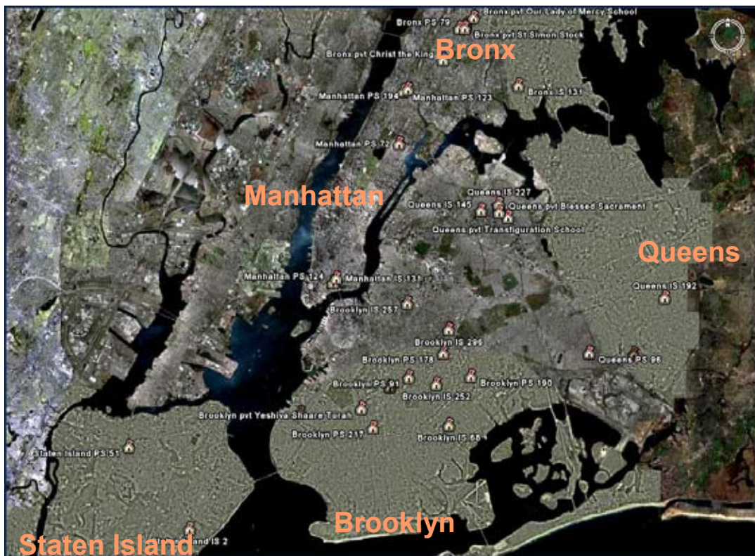
Map of 1st 32 Priority Schools - Capital Construction Locations