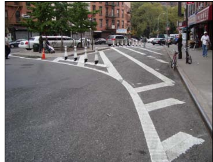
New pedestrian space on Ludlow Street