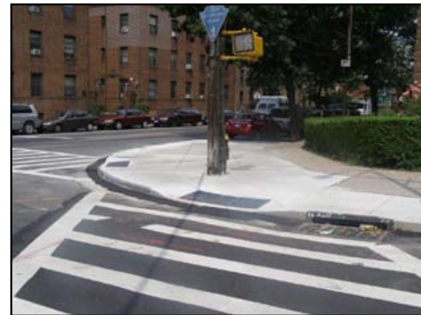
A new neckdown was constructed on the northeast corner of Parsons Boulevard and Sanford Avenue. The new sidewalk extension helps to align the intersection, shortens the crossing distance for pedestrians and slows vehicles turning at the corner.