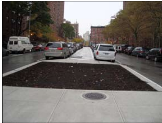
AFTER: Rutgers Street from Cherry Street facing north with new pedestrian island and street configuration