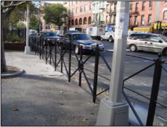
New pedestrian fencing on the east side of Chrystie Street at Broome Street