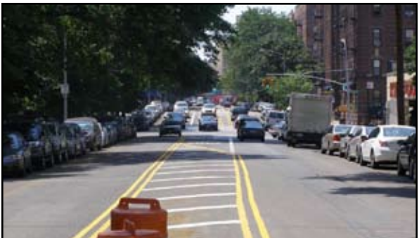
Bowne Street was narrowed to calm traffic with a painted median, left turn bays and pedestrian refuge islands from Northern Blvd. to Sanford Avenue.