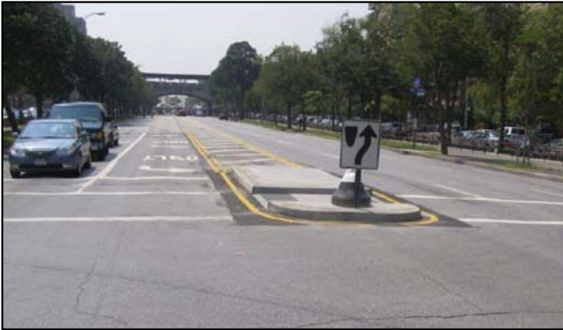
New pedestrian refuge islands were built in the north and south crosswalks at Ocean Parkway and Oceanview Avenue. Ocean Parkway was narrowed with a painted median to calm traffic from the Belt Parkway to Brighton Avenue.