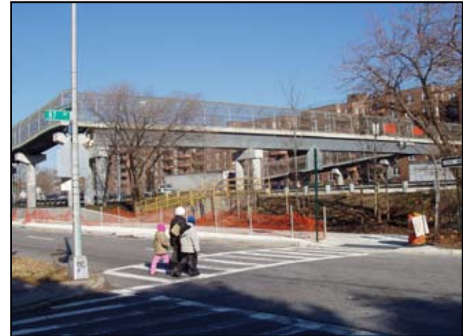
Pedestrians crossing the service road cross at an unsignalized intersection. The newly constructed bridge is depicted in the background, as well as location of pedestrian fencing.

the “slalom” fences at this location. However, the “experimental” push-button signal and associated signage were installed on both approaches. All work was completed in late March 2006. The images to the right depict the bridge and roadway while under construction.