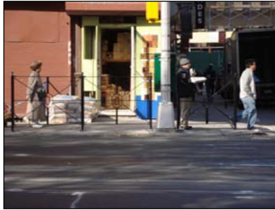
New pedestrian fencing on the west side of Chrystie Street at Broome Street