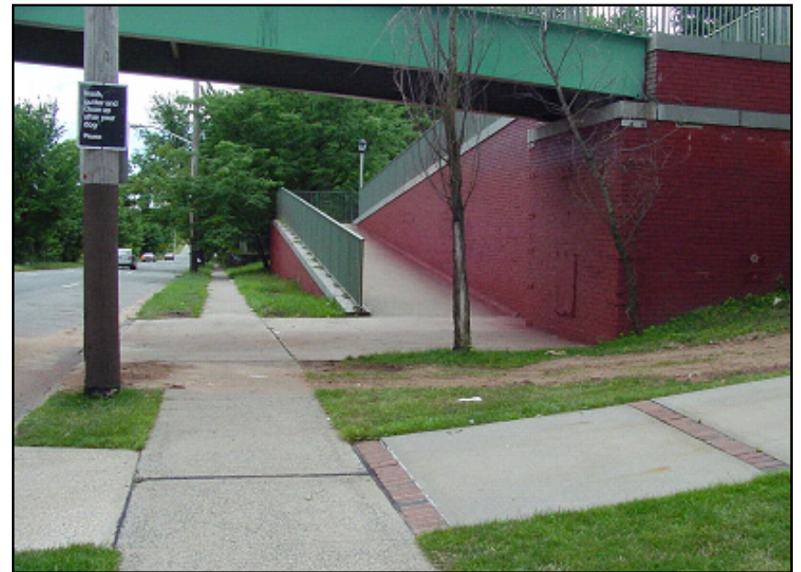
Type 1 Pedestrian Bridge at Jefferson Boulevard over the Korean War Veterans Parkway in Staten Island

Type 2 bridges, of which there are 13 citywide, carry a higher risk factor. At the landings of each of these bridges, the passageway exits directly into a controlled intersection and/or street. Under this configuration, bridge users immediately enter upon the roadway after exiting the bridge. Although the intersection control provides safe passage for a bridge user who comes to