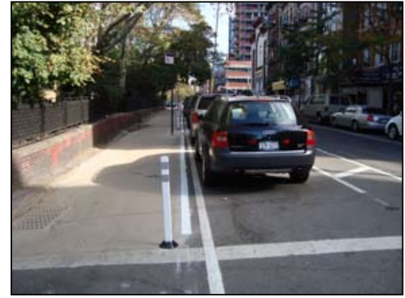
Forsyth Street pedestrian space with floating parking lane, buffer and one-way northbound operation