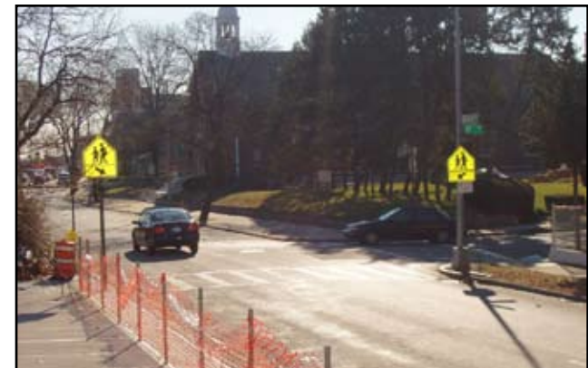
NYCDOT installed a push-button activated signal at this intersection. Orange mesh fencing indicates location where fencing will be installed to direct pedestrians to cross at the controlled intersection