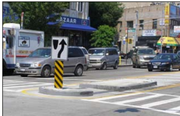
New pedestrian refuge island in south crosswalk of Coney Island Ave and Brighton Beach Ave