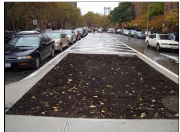
AFTER: Rutgers Street from Madison Street facing south with new pedestrian island and street configuration