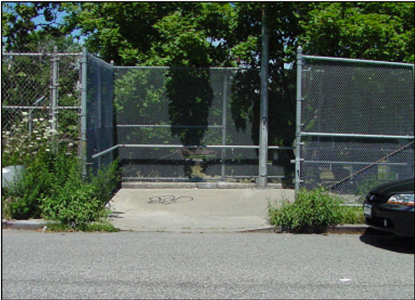
Type 3 Pedestrian Bridge at 84 th Street over the Brooklyn Queens Expressway in Brooklyn

a complete stop on the landing before entering the roadway, this can be problematic for wheeled users accelerating down the incline and failing to stop before entering the intersection, as both the driver and cyclist have limited sight distances and opportunities to react to each other.