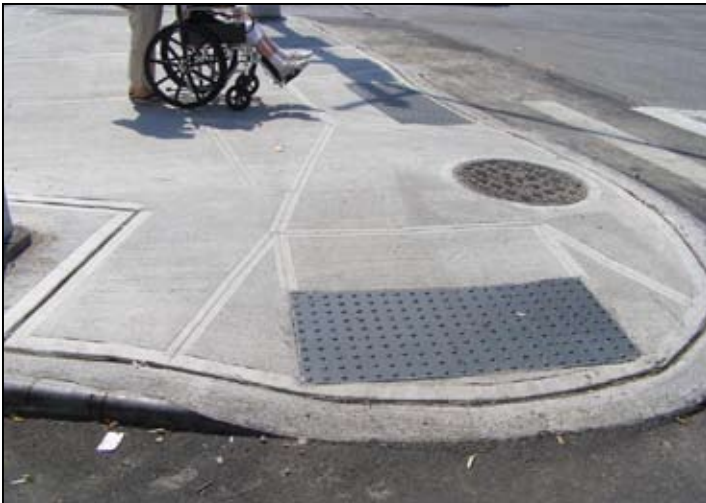
Newly constructed sidewalk and pedestrian ramps with safety surface to minimize tripping hazards such as cracked or broken sidewalks or roadbeds