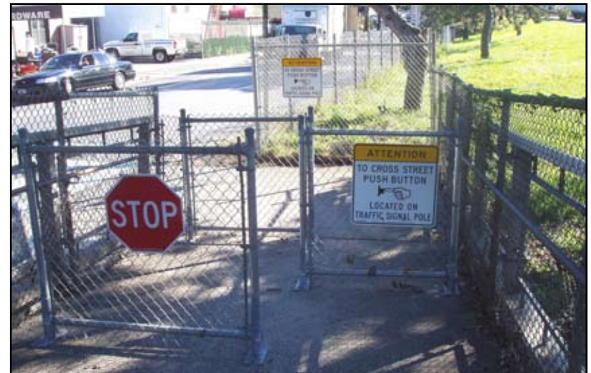
Slalom fencing design requires bridge users to come to a stop at the end of the bridge. In addition, STOP signage and instructions to use pedestrian activated signals are posted along the fencing.