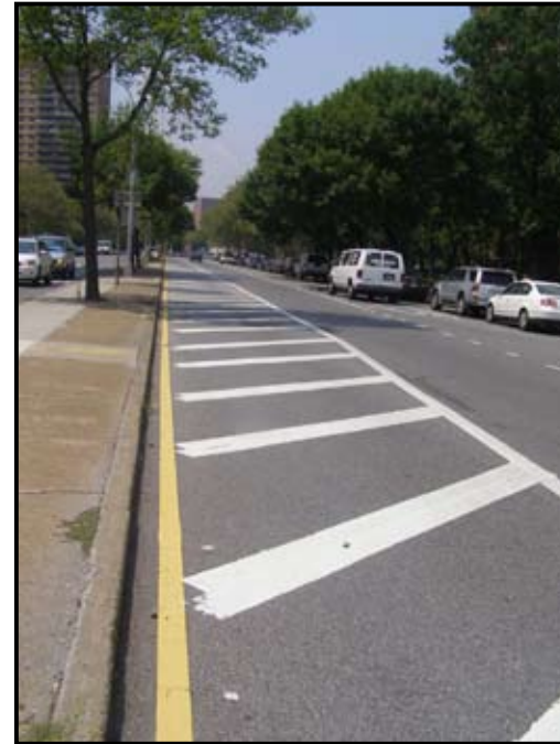
Neptune Avenue between Ocean Parkway and West 5th Street was narrowed to calm traffic and shorten the crossing distance for pedestrians at the intersections. A bike lane is provided on the north side of the street.