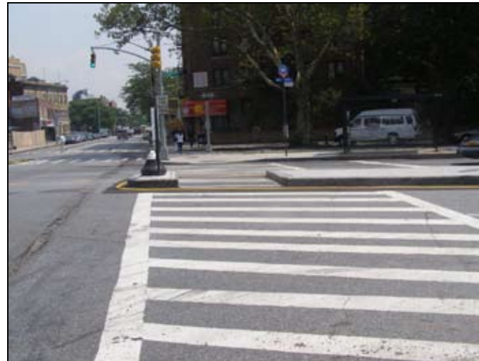
Pedestrian refuge islands were built in the north and south crosswalks of the Ocean Parkway and Neptune Avenue to provide a safe space for pedestrians who might not be able to make it all the way across these long roadways.