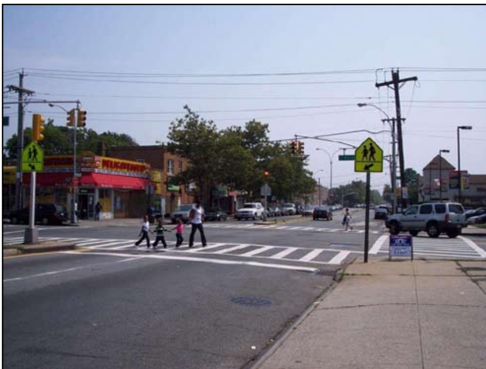
New school crosswalks and signage make crossing the street near schools even safer

As of September 2008, DDC construction of the long-term capital safety measures was nearly complete at eight Priority Schools: