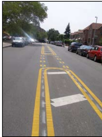
Colden Street was narrowed to calm traffic between Cherry Avenue and Franklin Avenue.