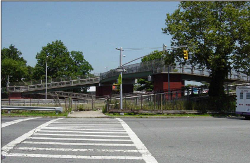
Type 2 Pedestrian Bridge at Fresh Meadows Lane and the Long Island Expressway Service Road in Queens