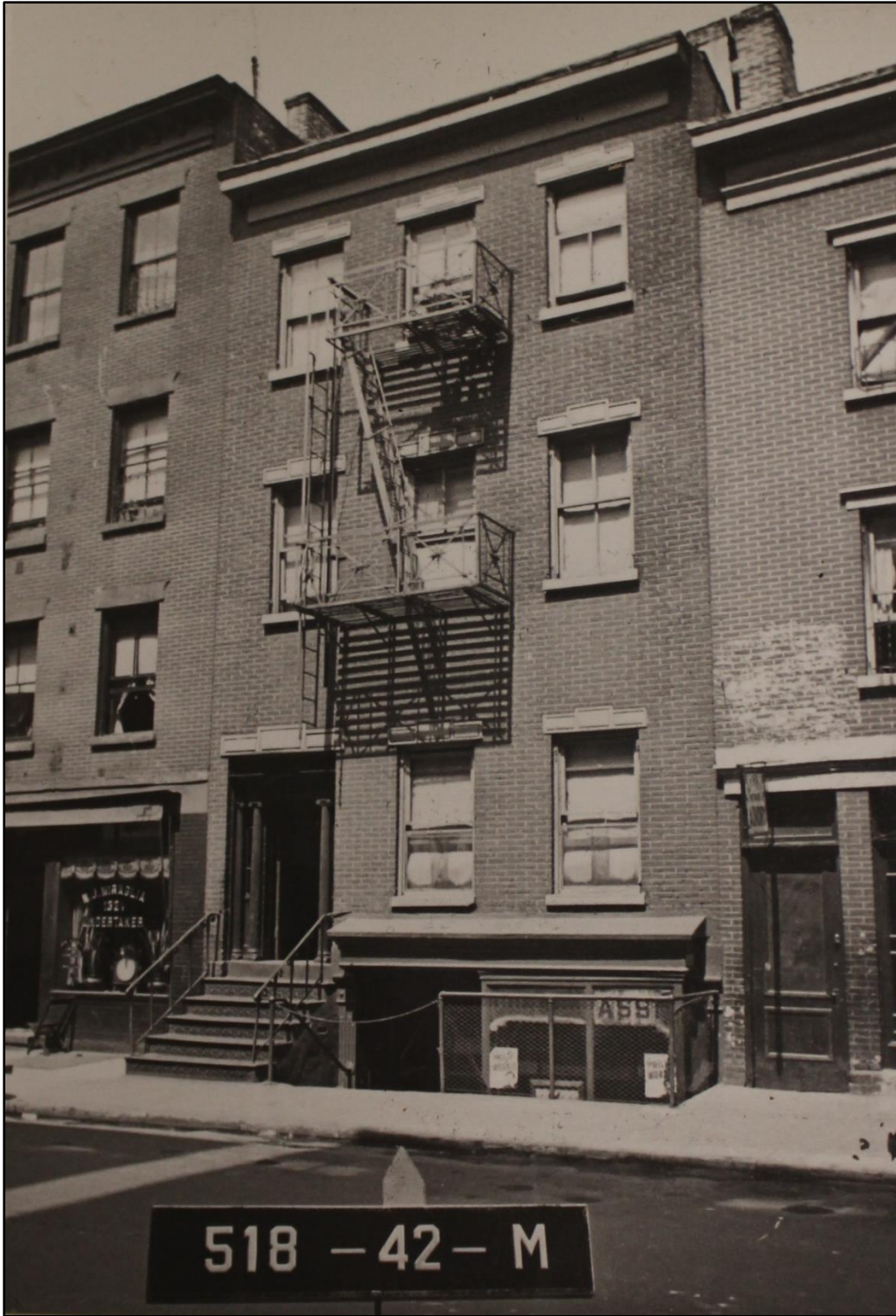
Figure 3 134 Sullivan Street (Architect Unknown, Owner Mills & Ryerson, built c. 1826) Photo: c. 1940 tax photo