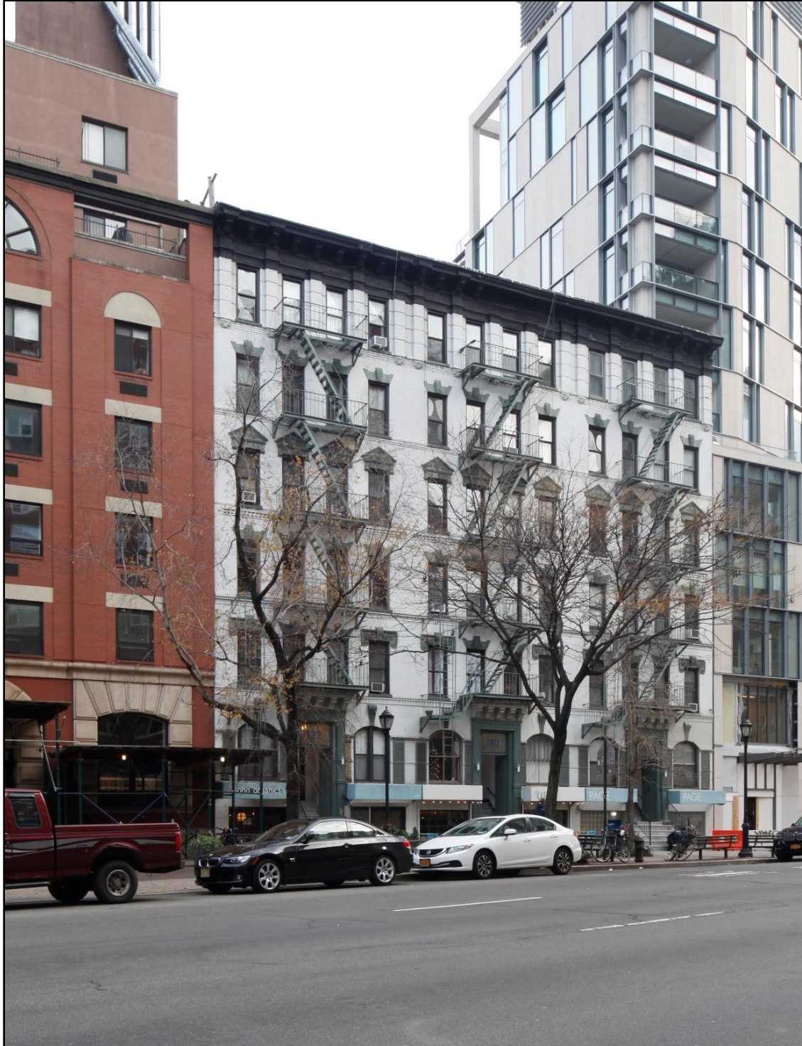
Figure 20 188, 190, and 192 Avenue of Americas (Architect Michael Bernstein, Owner Samuel Ginsburg, built 1900)