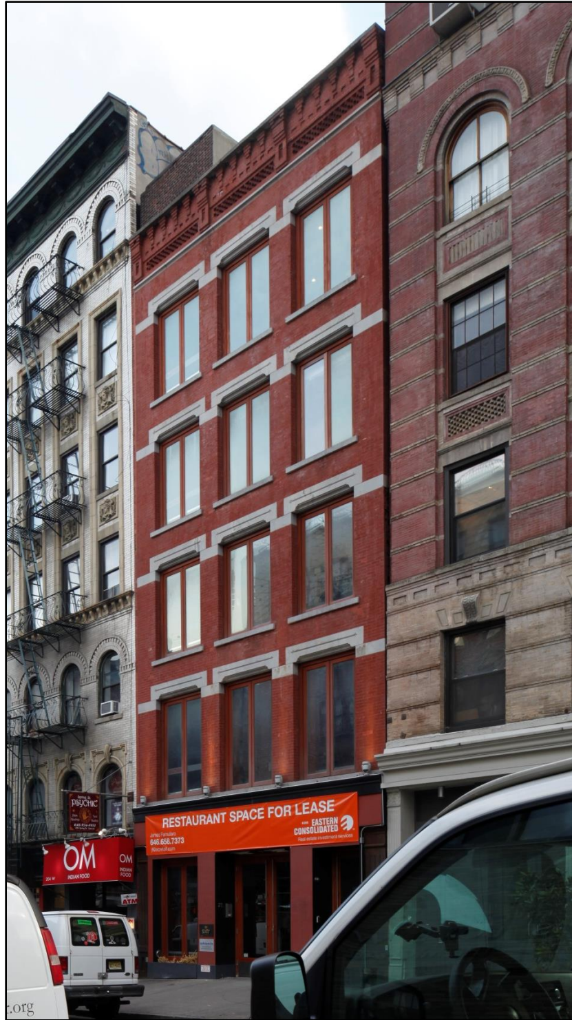
Figure 39 206 Spring Street (Architect Charles Hadden, Owner New York Pie Baking Company, built 1890) Photo: Sarah Moses, 2016