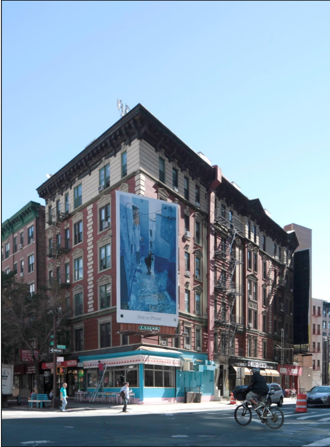
Figure 24 34 Watts Street aka 110-114 Avenue of Americas Minneloa Building (Architect Horenburger & Straub, Owner Morris Fine, built 1903) Photo: Sarah Moses, 2016