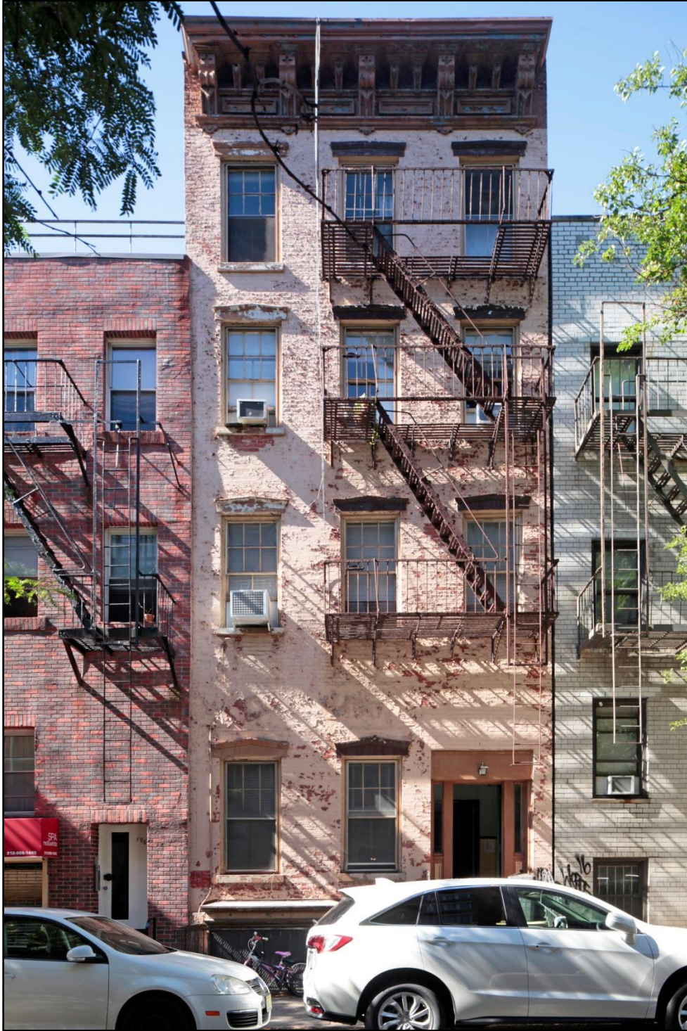
Figure 6 198 Prince Street (Architect Unknown, Owner Lorrain Freeman, built c. 1831, altered 1876, 1924)