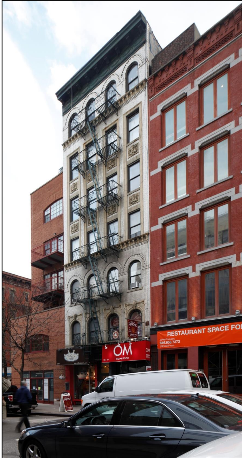
Figure 17 204 Spring Street (Architect A.G. Rechlin, Owner Marasco & Abbate, built 1901)