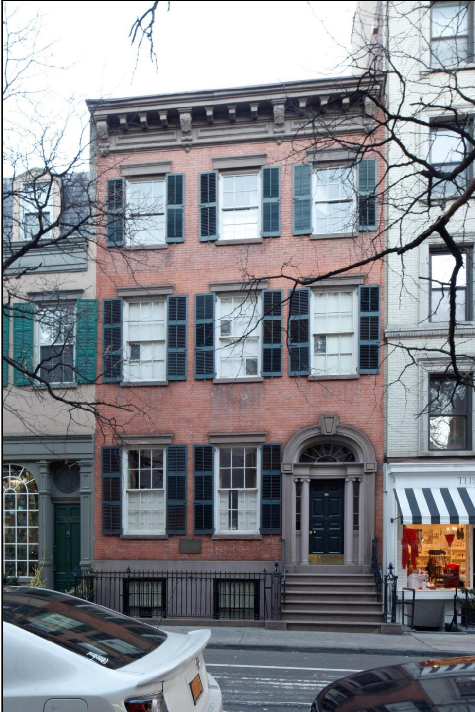
Figure 5 203 Prince Street (Architect Unknown, Owner John P. Haff, built c. 1833, altered 1888)