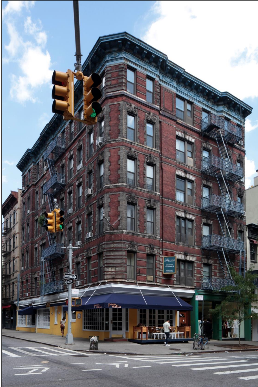
Figure 22 195 Spring Street (Architect Bernstein & Bernstein, Owner Charles Friedman, built 1902) Photo: Sarah Moses, 2016