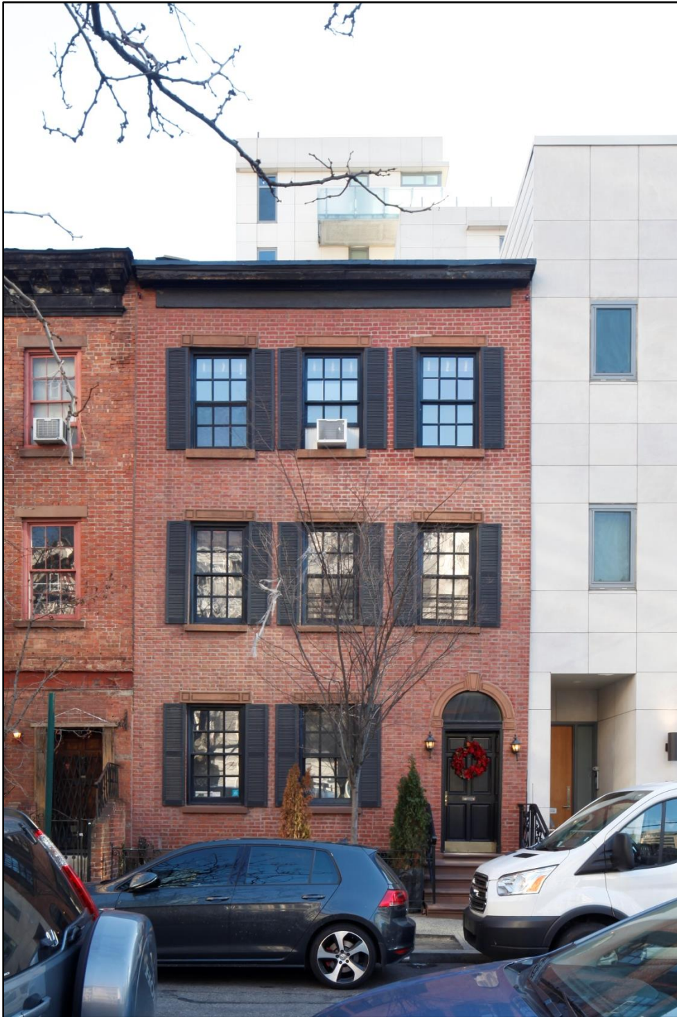
Figure 1 57 Sullivan Street (Architect Unknown; Developer, Fredrick Youmans, built 1816, altered 1842, 1875) Photo: Sarah Moses, 2016