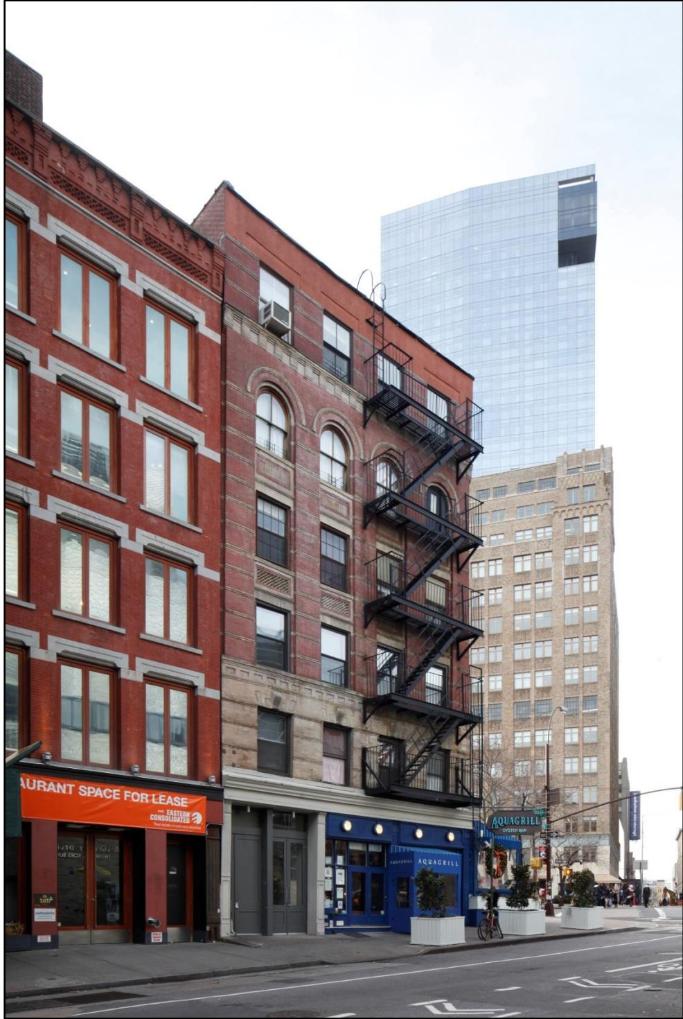
Figure 40 210 Spring Street (Architect M. Bernstein, Owner Charles Bacigalipo, built 1902) Photo: Sarah Moses, 2016