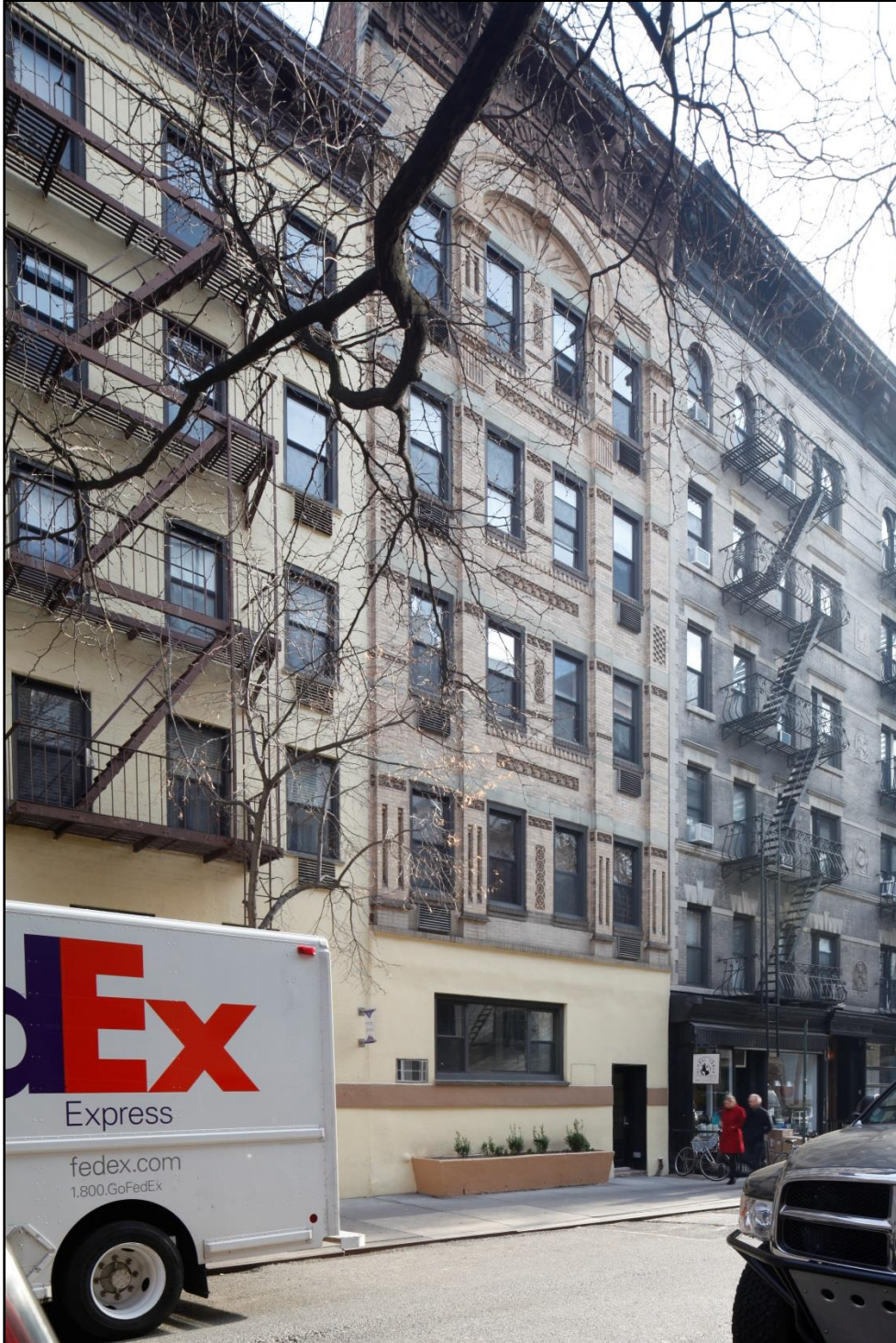
Figure 14 111 Sullivan Street Cella Building (Architect Robert Hankinson, Owner Joseph Cella, built 1893 altered 1960) Photo: Sarah Moses, 2016