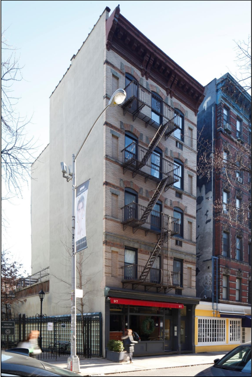
Figure 31 97 Sullivan Street (Architect George Butz, Owner H.P. Skelly, built 1908) Photo: Sarah Moses, 2016