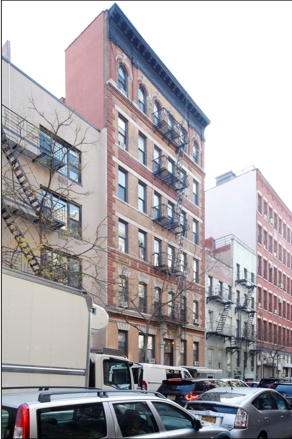
Figure 18 110 Thompson Street (Architect Sass & Smallheiser, Owner Rosenberg & Rosenberg, built 1900) Photo: Sarah Moses, 2016