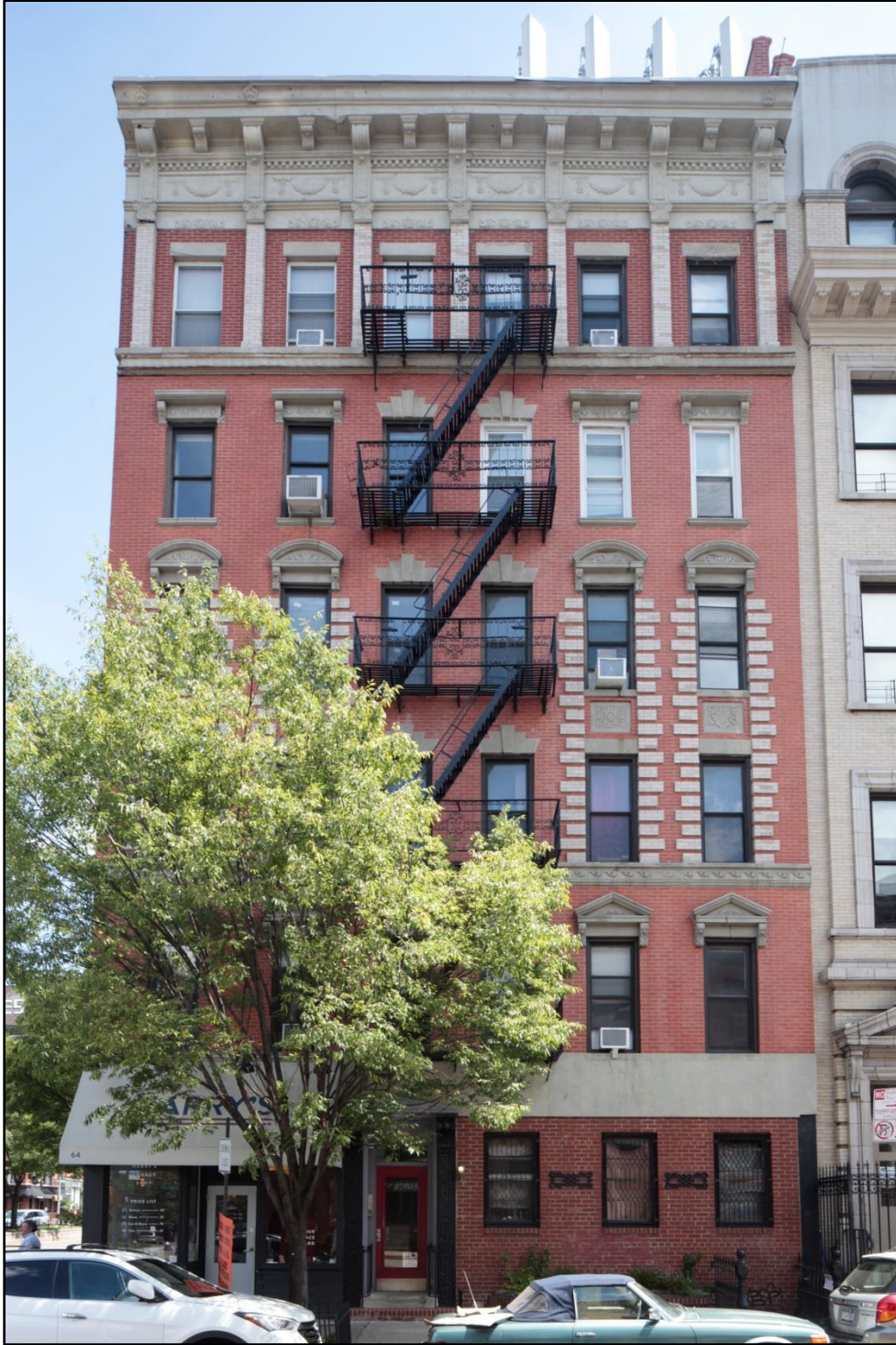
Figure 23 64 MacDougal Street (Architect Bernstein & Bernstein, Owner Dominick Abbate and Peitro Alvino, built 1904) Photo: Sarah Moses, 2016