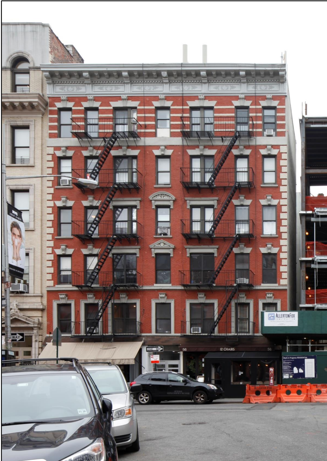
Figure 26 56-58 MacDougal Street (Architect George Pelham Owner Charles J Weinstein, built 1903) Photo: Sarah Moses, 2016