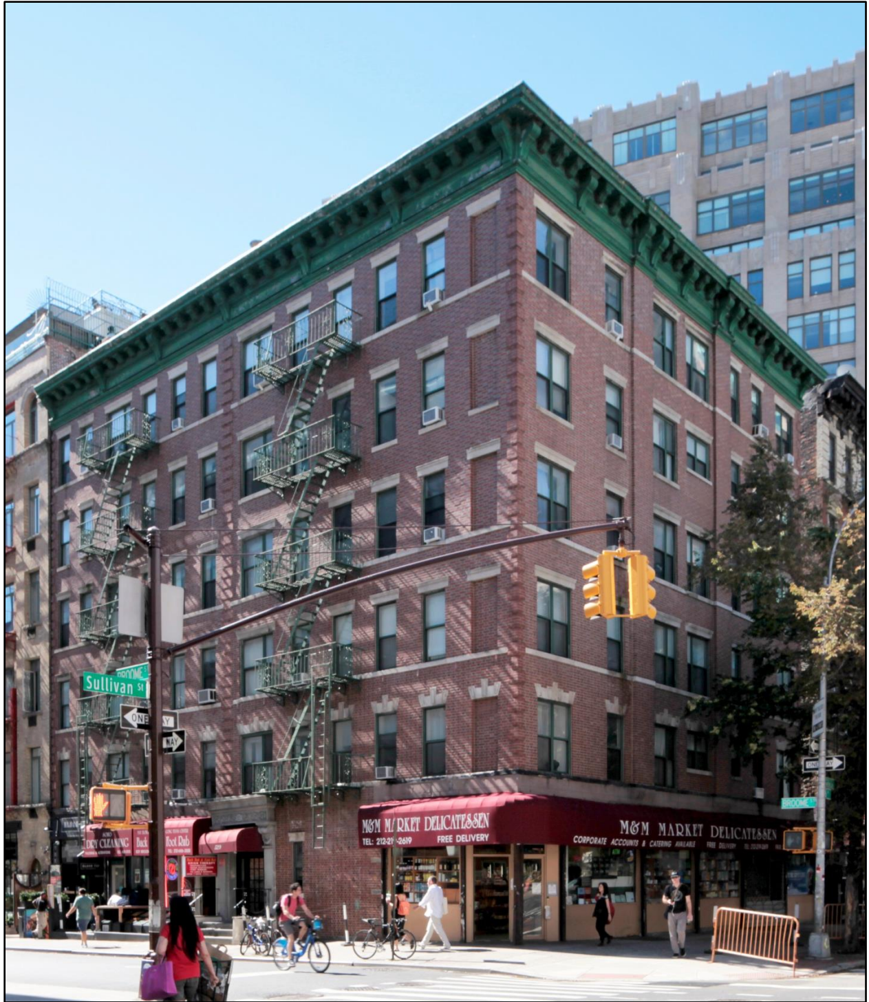
Figure 30 529 Broome Street aka 116-120 Avenue of Americas (Architect Charles Straub, Owner Rosehill Realty Corporation, built 1907)