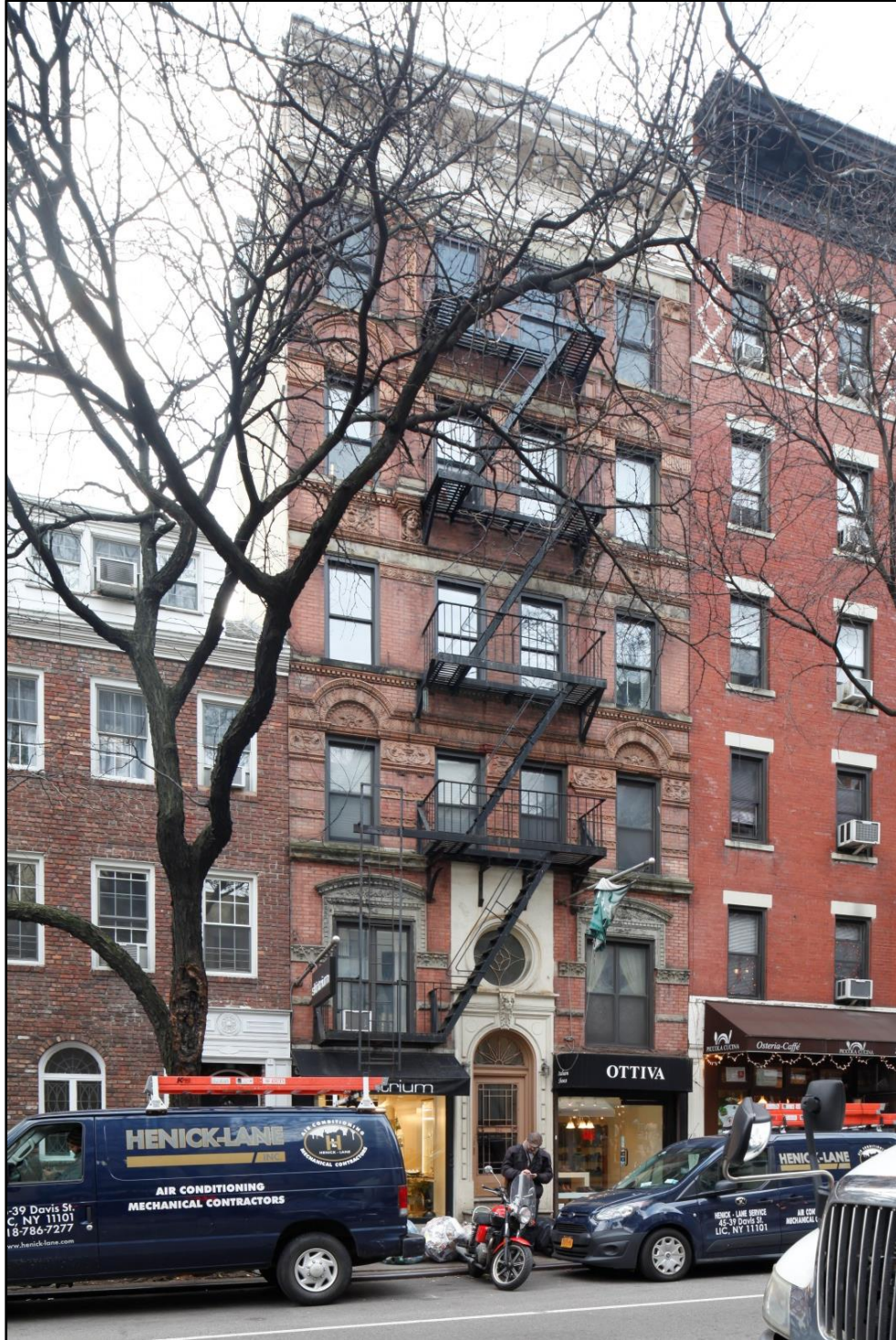
Figure 15 192 Spring Street (Architect Kurtzer and Rohl, Owner August Ruff, built 1891) Photo: Sarah Moses, 2016