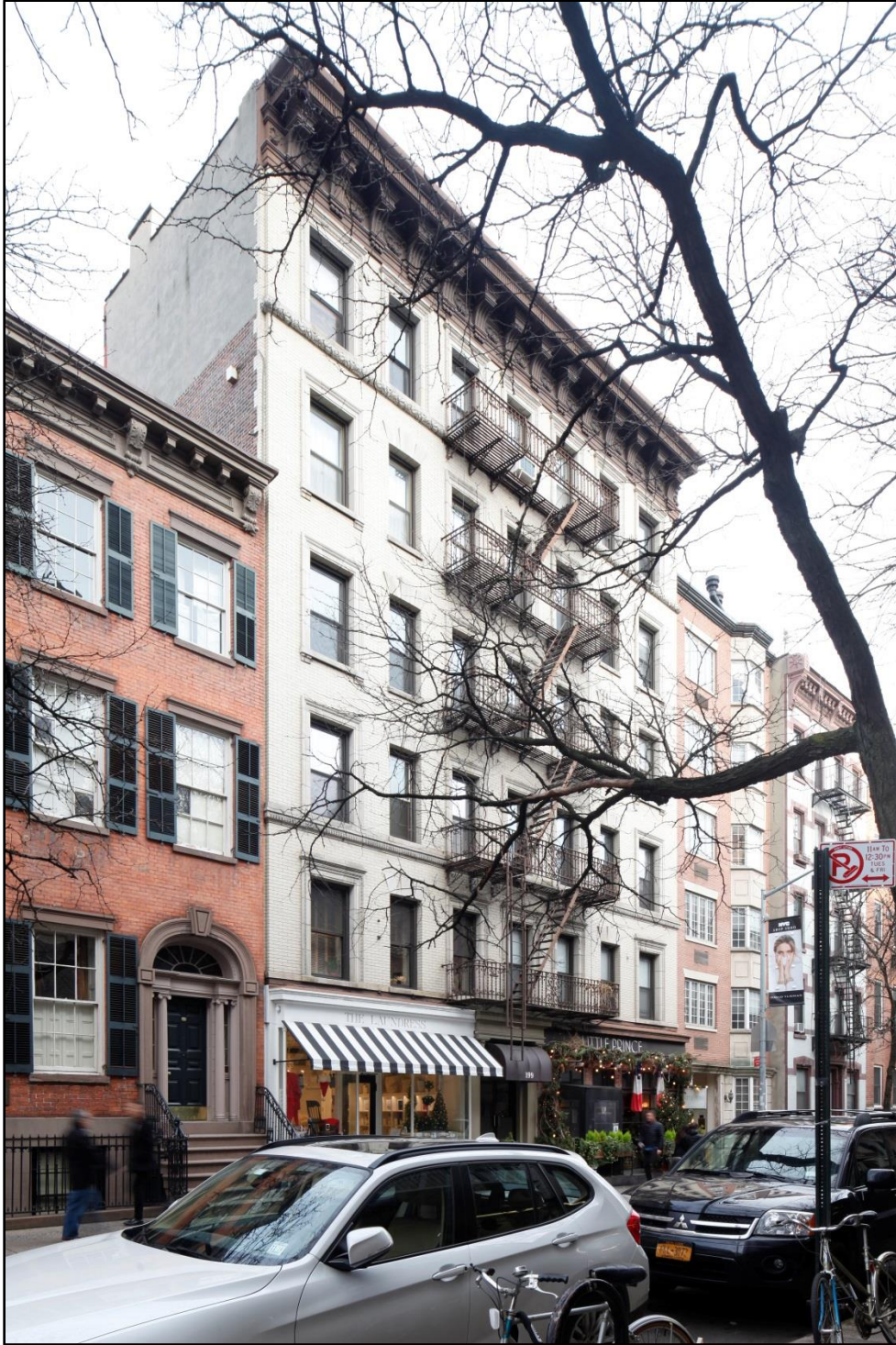
Figure 29 199 Prince Street (Architect John Voelker, Owner Charles Darrow, built 1906 Photo: Sarah Moses, 2016