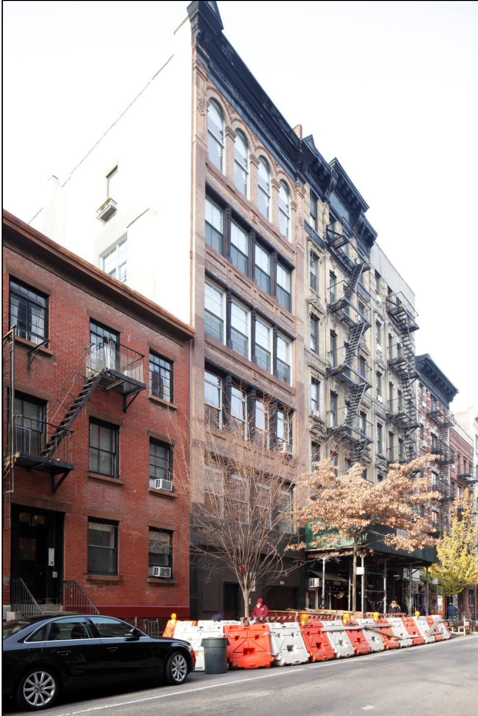
Figure 38 140 Sullivan Street (Architect Louis Heinecke, Owner Ernest Friedrichs, built 1891)