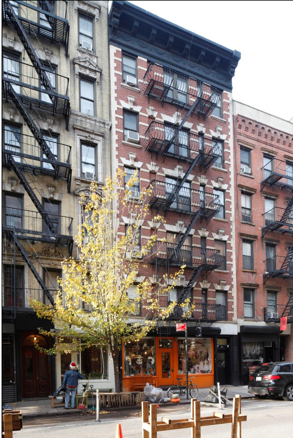
Figure 25 146 Sullivan Street (Architect Horenburger & Straub, Owner Silverman & Bloch, built 1905) Photo: Sarah Moses, 2016