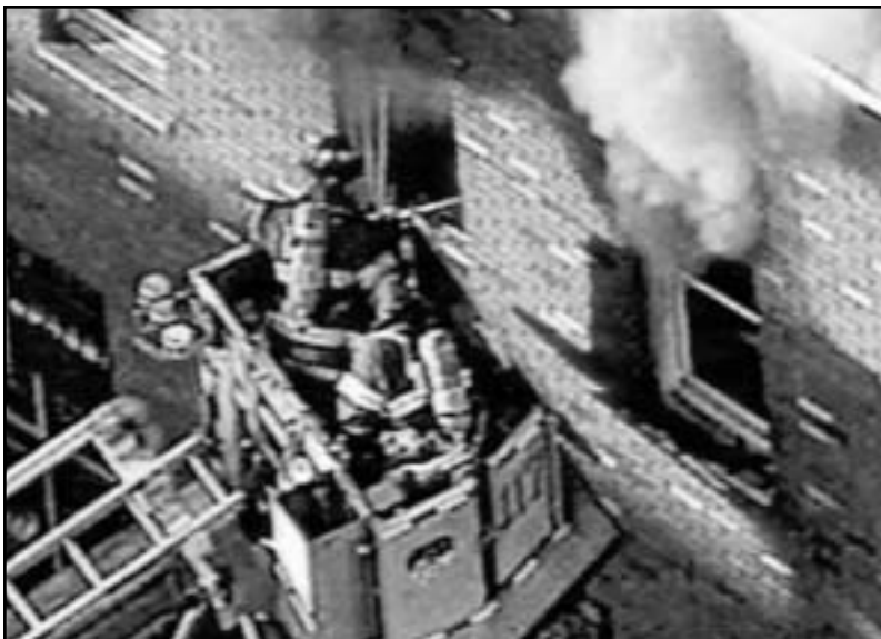
Ladder 117 in action.