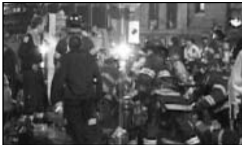
Firefighters work feverishly on rescued victims.