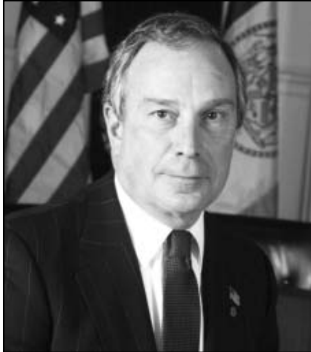
Michael R. Bloomberg Mayor