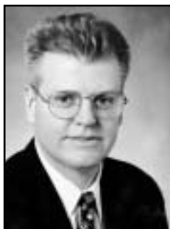
FRANCIS X. GRIBBON Public Information