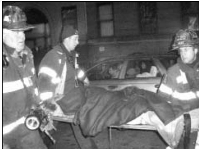
FDNY members tend to one of the numerous victims from Queens Box 22-7889.