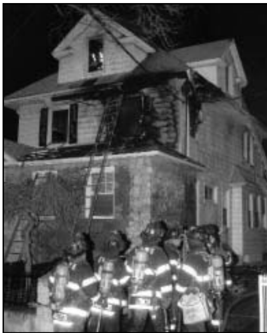
Members of Ladder 168 at fire scene.