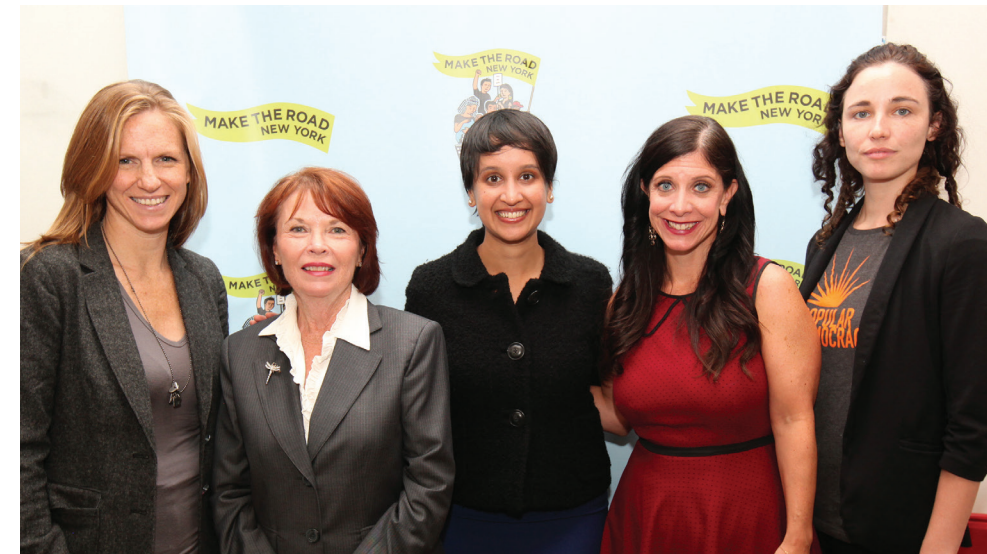
Photos left to right: Tech Talent Pipeline workshop; financial counseling; NYCitizenship event