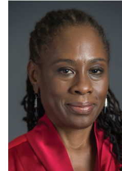
CHIRLANE McCRAY Chair, Board of Directors

When I was appointed Chair of the Mayor's Fund in February 2014, I found that for every seemingly intractable problem facing our city, there are New Yorkers who are working hard to solve it. With 2015 underway, I am struck by just how true that is. I have met so many civic-minded men and women in each of the five boroughs who are committed to supporting New Yorkers, and I am proud of the work the Mayor's Fund has done to support them.