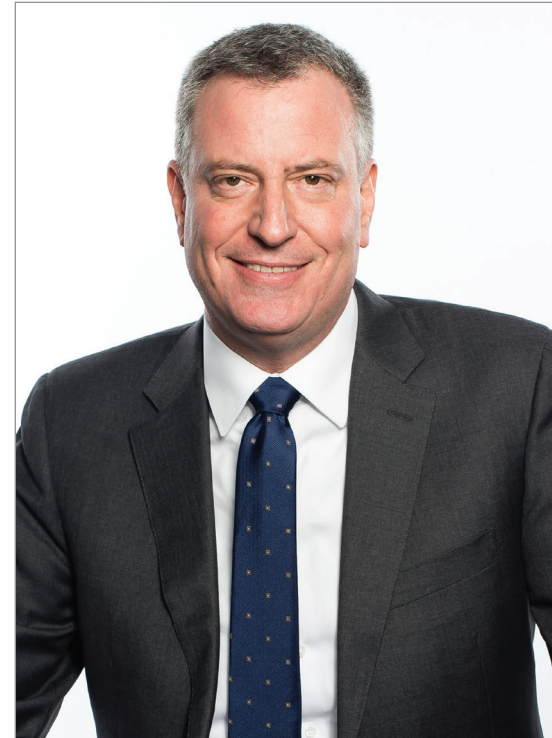
BILL DE BLASIO , Mayor