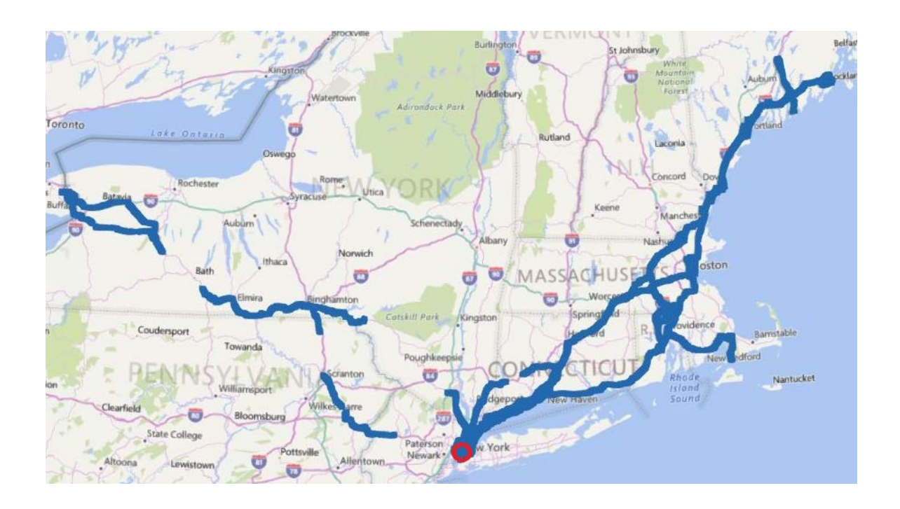
Out-of-City Travel for DOC Commissioner Joseph Ponte for 2016