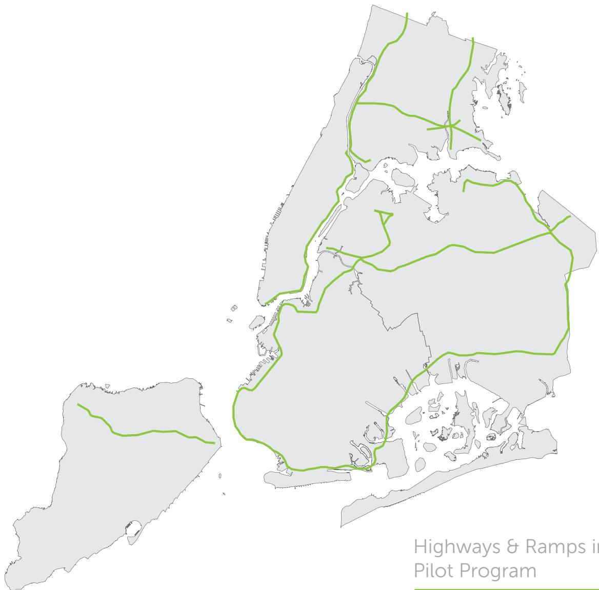
Highways & Ramps in Pilot Program

Highway roadbeds receive monthly cleaning from the Department of Transportation or its contractors; however, this is not sufficient to maintain a consistently clean and litter-free condition along all parts of highways, particularly the on/off ramps. Bottles, paper and other debris are often caught in the gutters or weeds by the sides of our highways. Currently, DSNY is piloting mechanical broom sweeping on the Long Island Expressway and Major Deegan Expressway. In 2016, DSNY will expand this highway-sweeping pilot to all five boroughs, adding sections of the Brooklyn-Queens Expressway, Staten Island Expressway, Belt Parkway and FDR Drive. We will continue to assess the results and expand the program even more in the years to come.