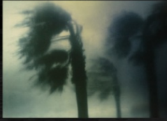
Stay Protected During Storms