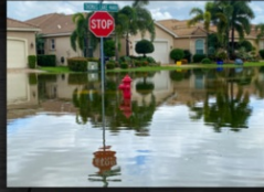
Use Caution After Storms