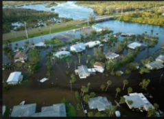
Know Your Risk: Water & Wind