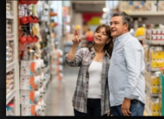
Take Action Today

Learn more about what to expect from hurricanes and increase your level of preparedness by visiting weather.gov/hurricane