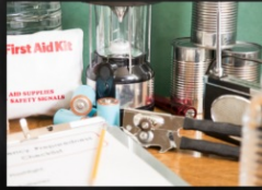
Prepare Before Hurricane Season