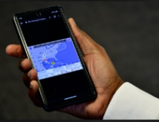
Understand Forecast Information