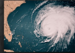
Get Moving When a Storm Threatens