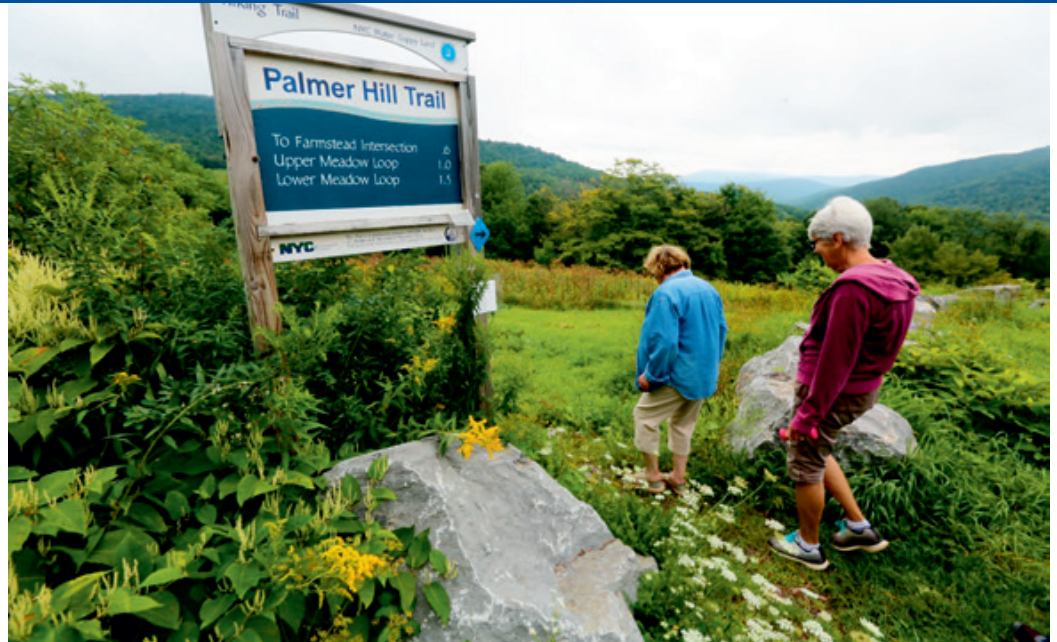
Hikers set out for a beautiful summer trek on the Palmer Hill Trail in Delaware County, one of 11 marked hiking trails that now traverse watershed lands.

Our employees at the New York City Department of Environmental Protection (DEP) are proud to be the stewards of the largest municipal drinking water system in the United States, along with vast forests, streams, meadows and mountains that surround our reservoirs.