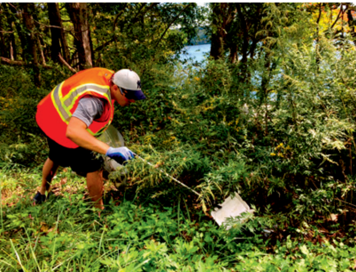
A volunteer at New Croton Reservoir plucks a takeout-food container from the woods near a popular boat launch area. About 400 volunteers participated in the annual cleanup last year.

Finally, we are always asking outdoor enthusiasts to report dangerous or suspicious activities, water quality threats, or fish kills on City reservoirs and lands. You can do this 24 hours a day by calling 1-888-H2O-SHED (426-7433).