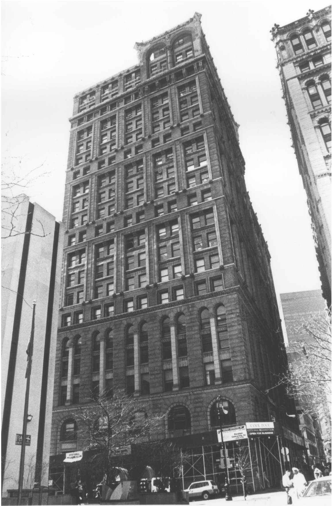
American Tract Society Building, 150 Nassau Street