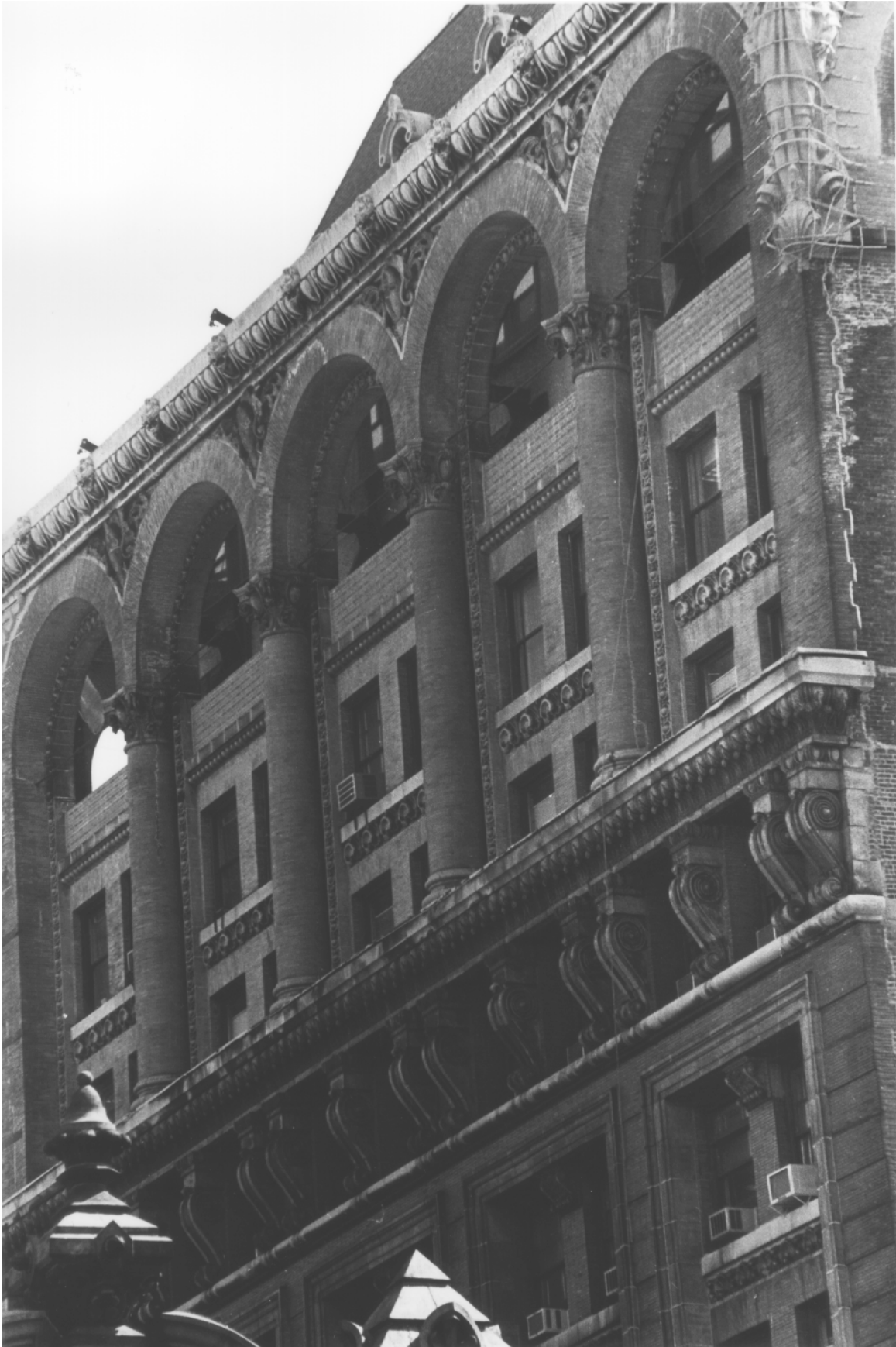
American Tract Society Building , cornice and upper arcade