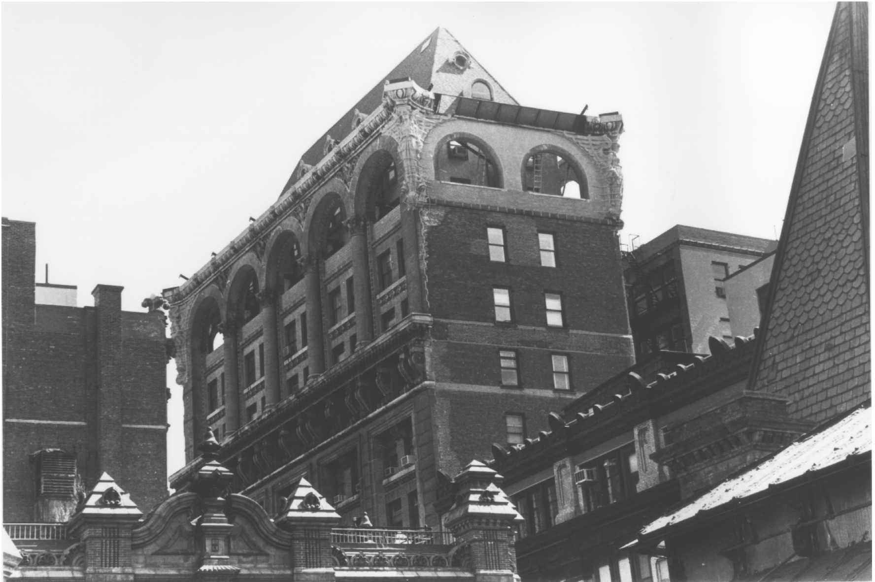
American Tract Society Building , upper section