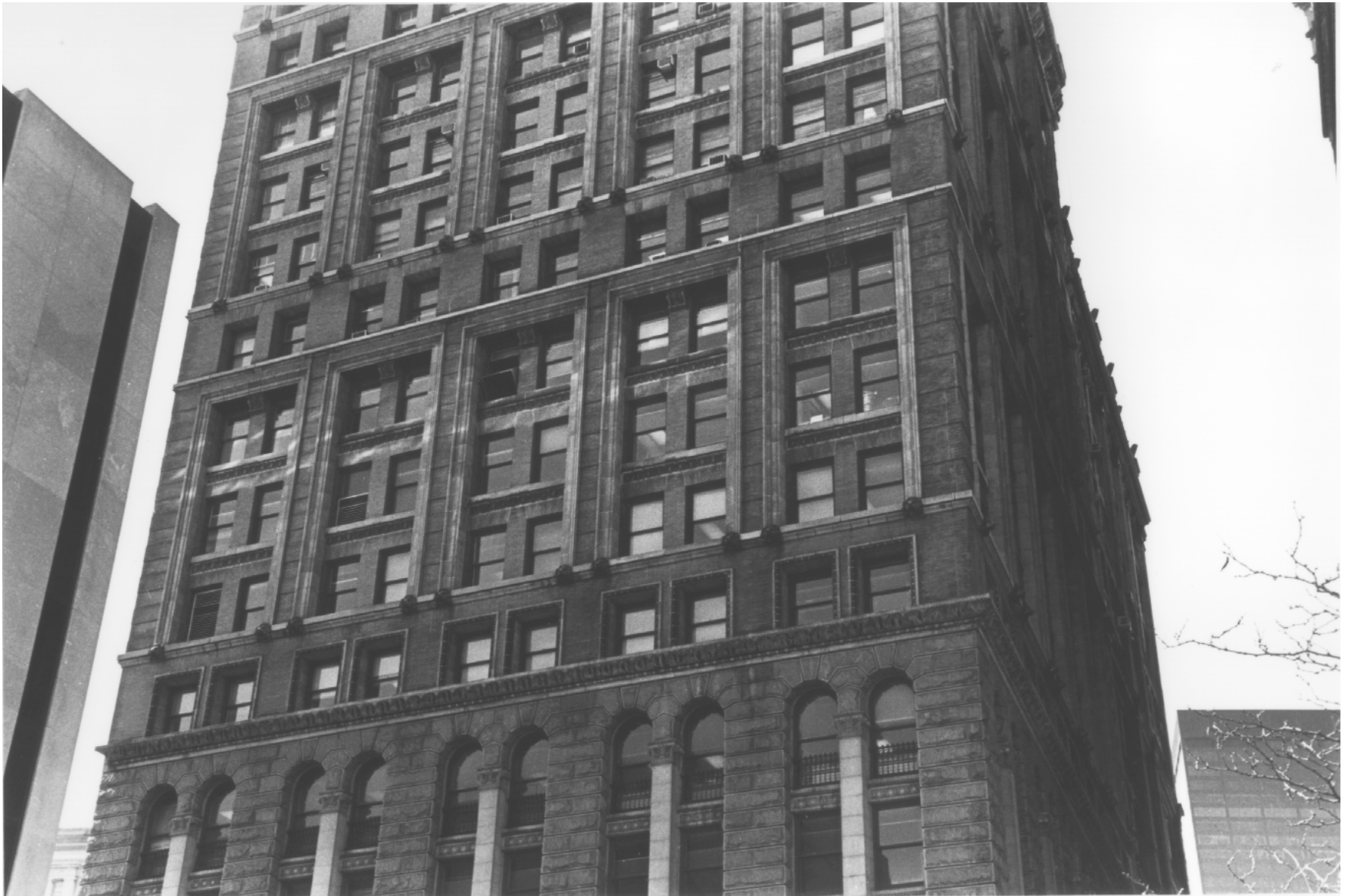
American Tract Society Building , midsection of Spruce Street facade