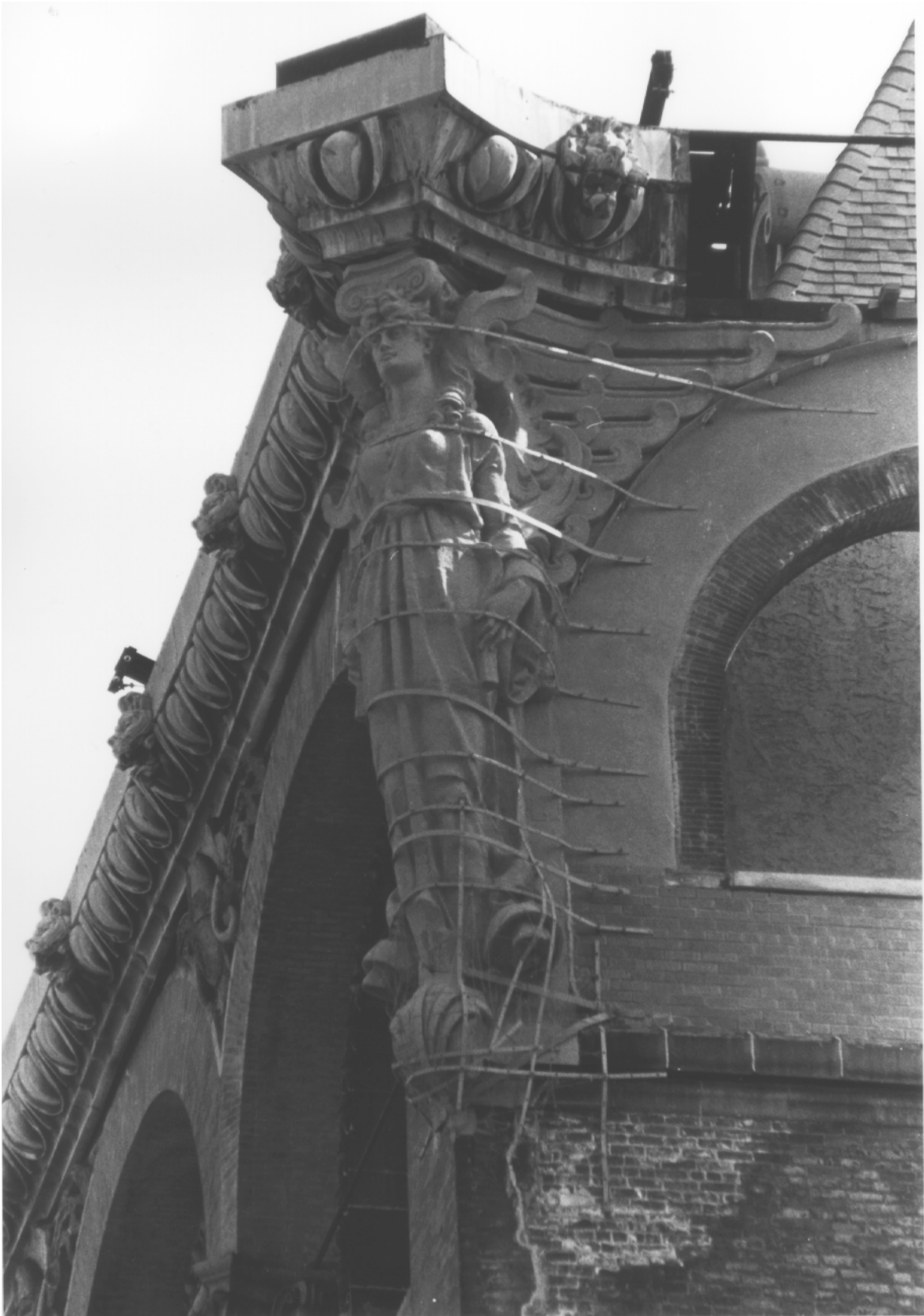
American Tract Society Building , winged caryatid on upper arcade