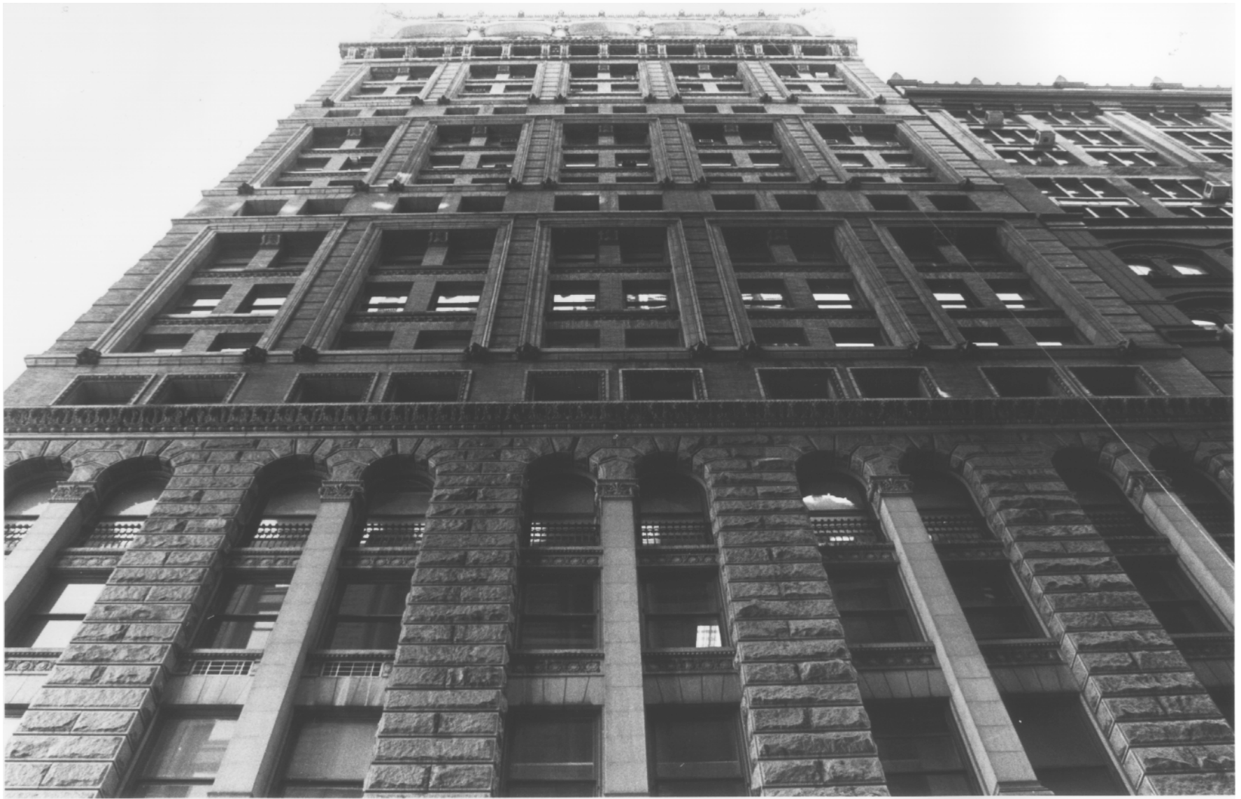
American Tract Society Building , Nassau Street facade