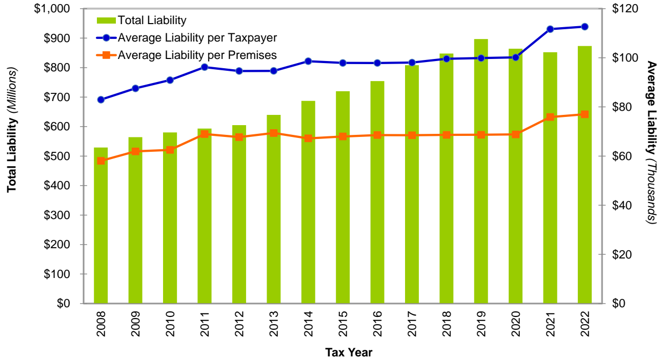
Figure 1 TAXPAYER AND PREMISES LIABILITY TY 2008 – TY 2022