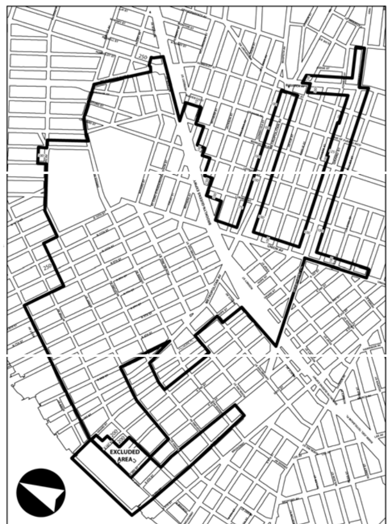
Portion of Community District 1, Brooklyn

EXISTING (TO BE DELETED) Map 2 (7/29/10)