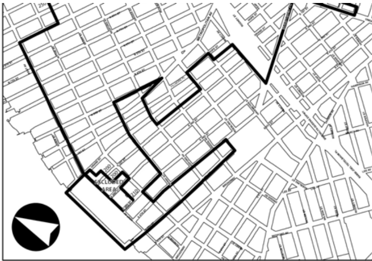
Portion of Community District 1, Brooklyn