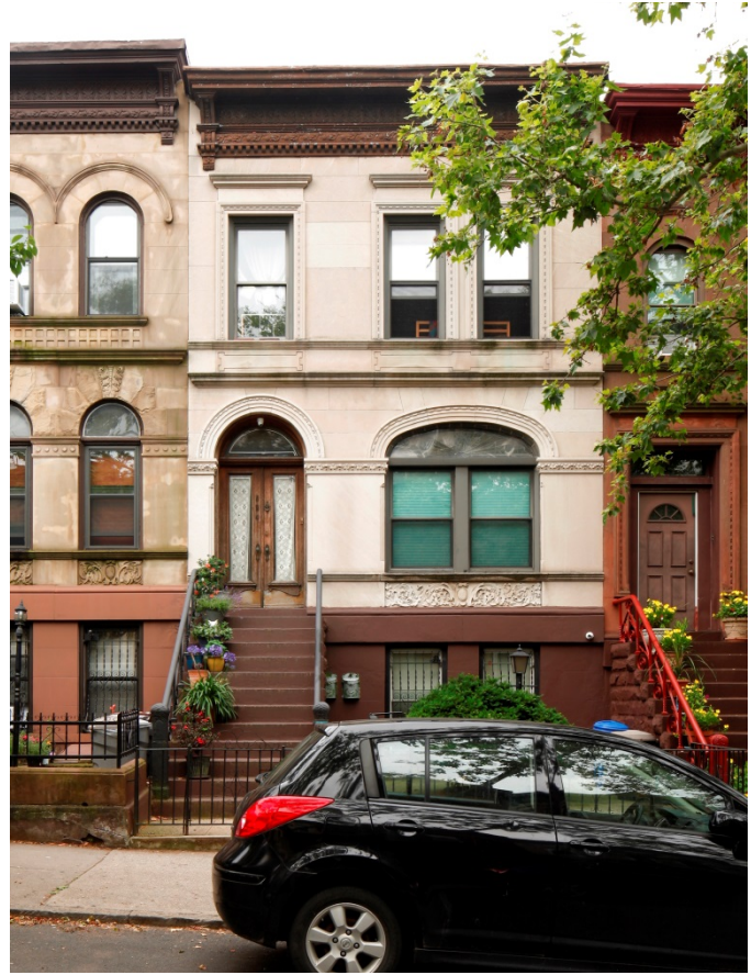
Figure 4 526 47th Street LPC, 2019