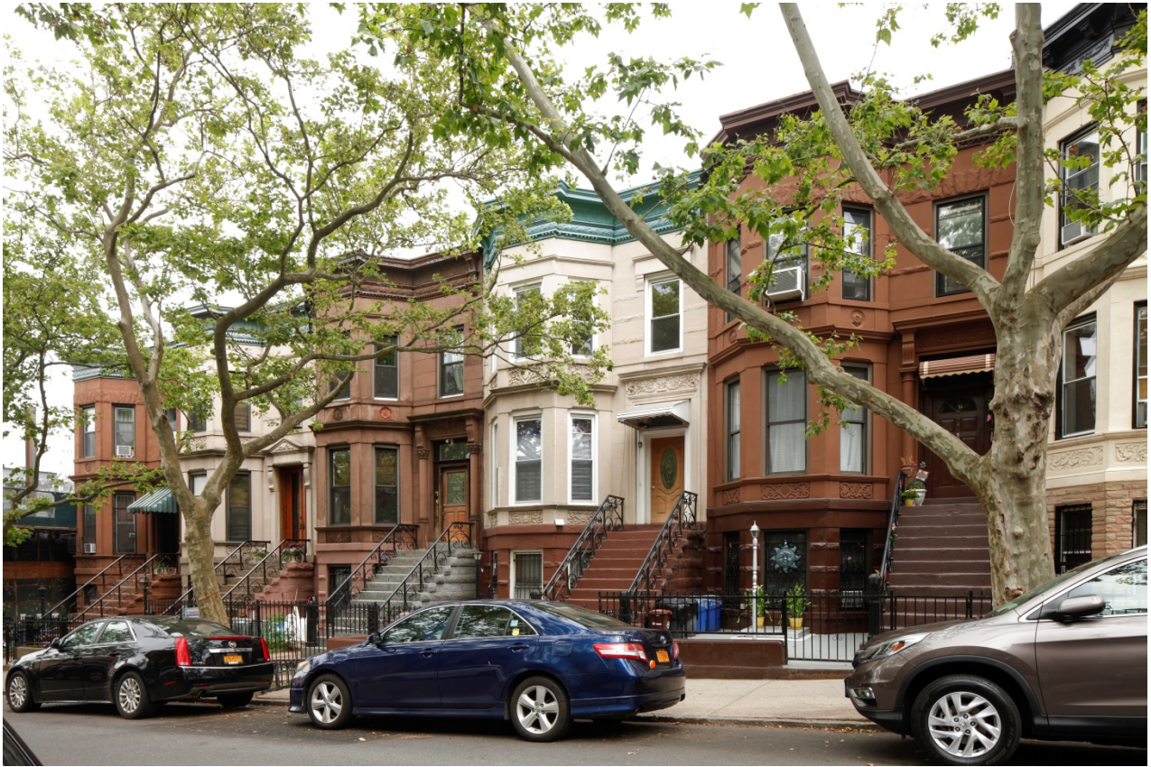
(Above) Figure 5 515 to 523 47th Street (Thomas Bennett, 1900) LPC, 2019