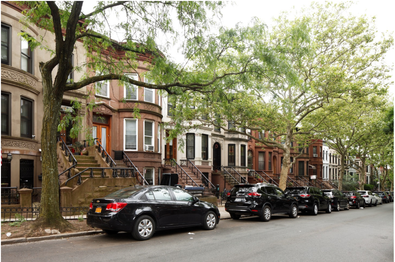
(Above) Figure 1 Portion of row at 514 to 570 47th Street (Thomas Bennett, 1897-99) LPC, 2019