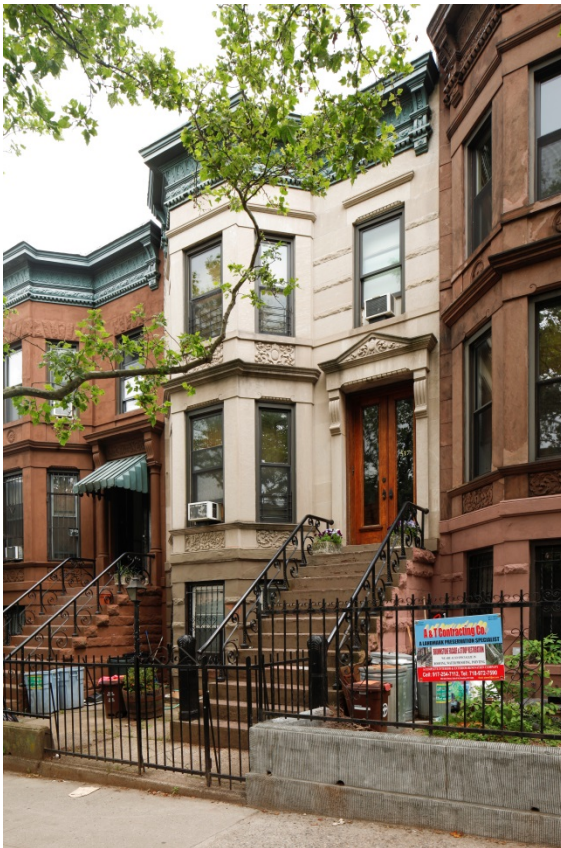
(Left) Figure 6 517 47th Street LPC, 2019