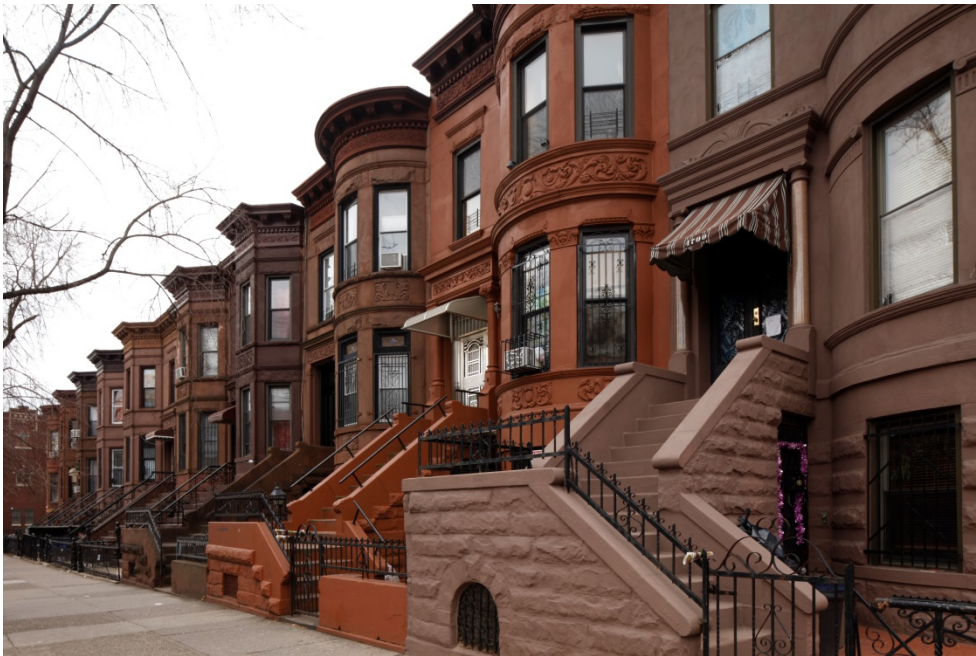
Figure 10 4700 to 4718 Sixth Avenue (Henry Pohlmann, 1905) LPC, 2019