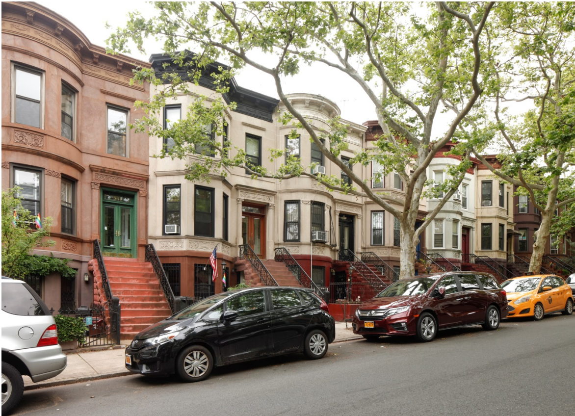
(Above) Figure 7 531 to 541 47th Street (Architect not determined, 1907) LPC, 2019