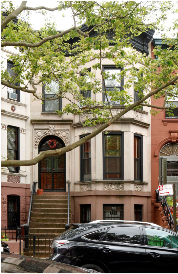
Figure 3 564 47th Street LPC, 2019