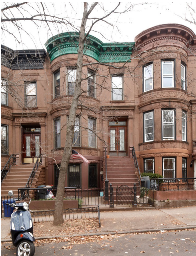
(Left) Figure 8 561 47th Street (Thomas Bennett, 1906) LPC, 2019