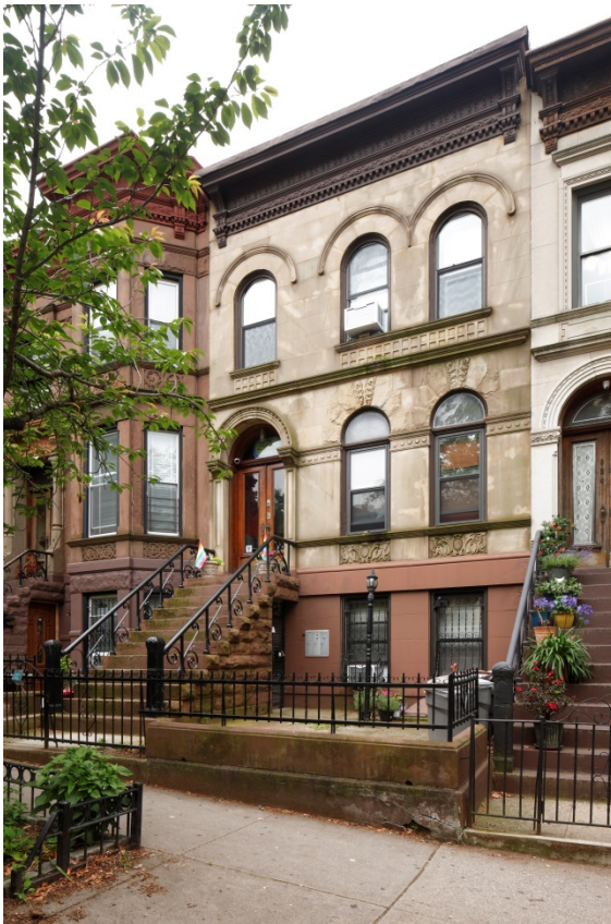
(Left) Figure 2 526 47th Street LPC, 2019