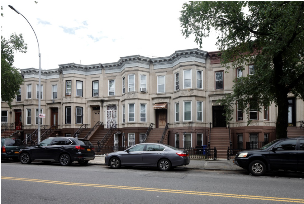
Figure 9 4701 to 4721 Sixth Avenue (Henry Pohlmann, 1904) LPC, 2019