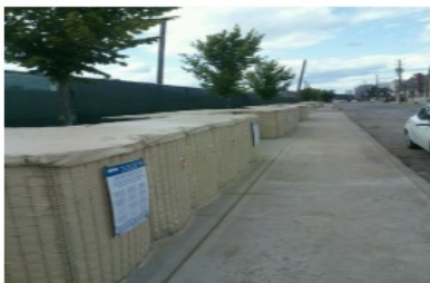
A HESCO® barrier.

NYC Emergency Management manages the IFPM program in collaboration with the Mayor's Office of Resiliency, and several other City agencies.