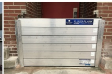
A flood barrier panel.