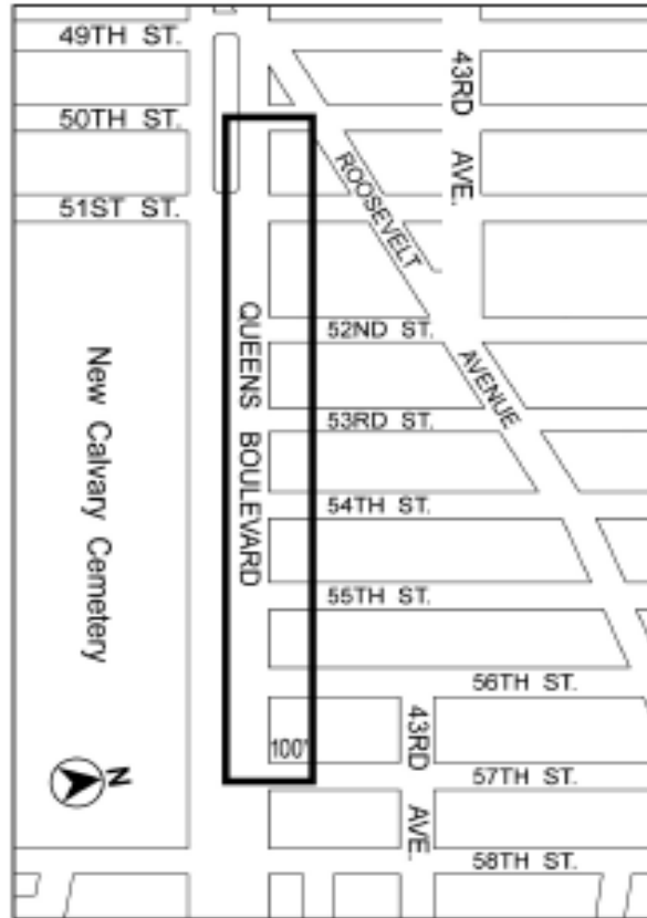
Map1 - (NEW Map 1, Showing the Extension of the Existing Inclusionary Housing District)