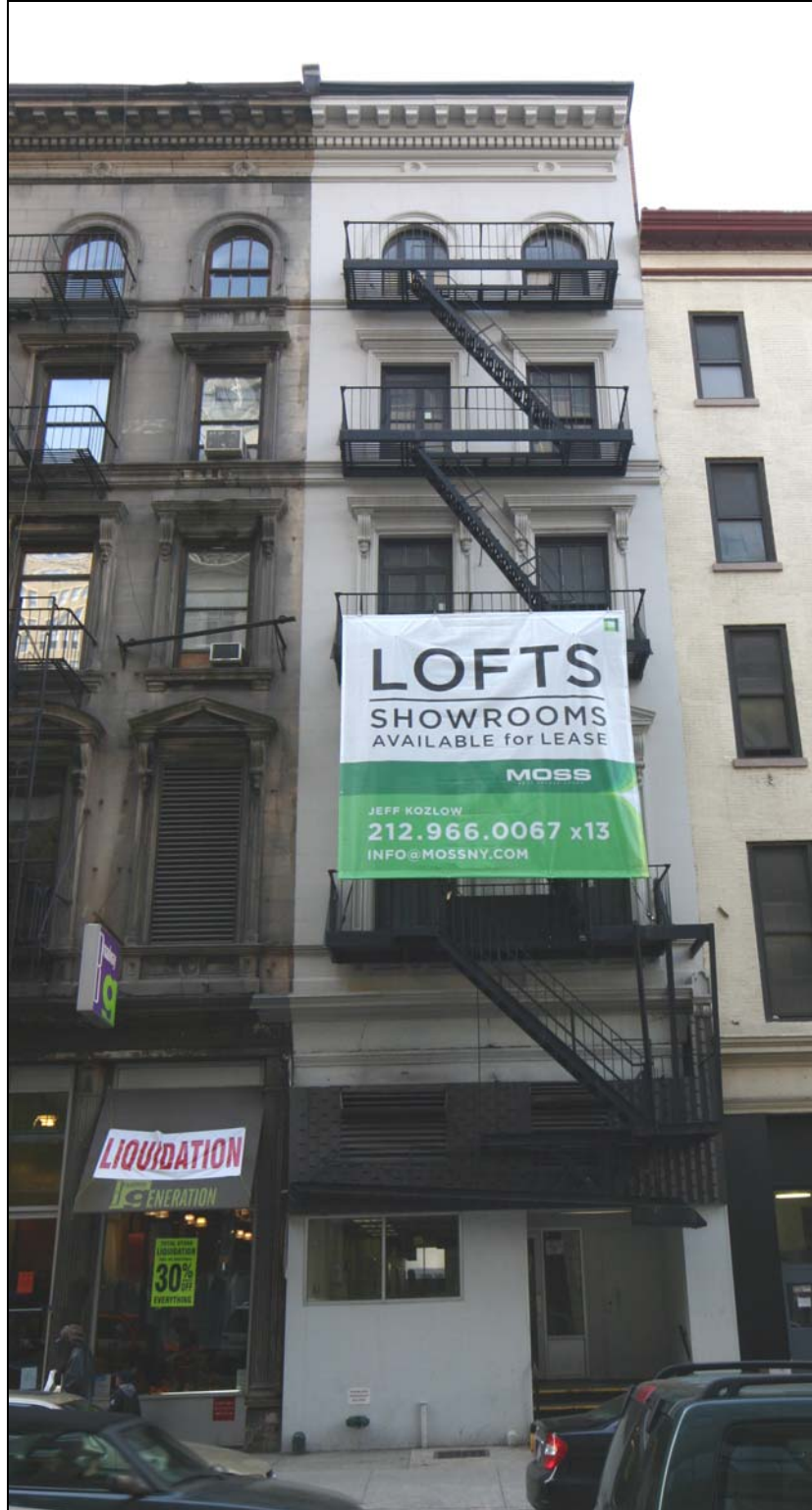
25 Park Place Building , 22 Murray Street elevation