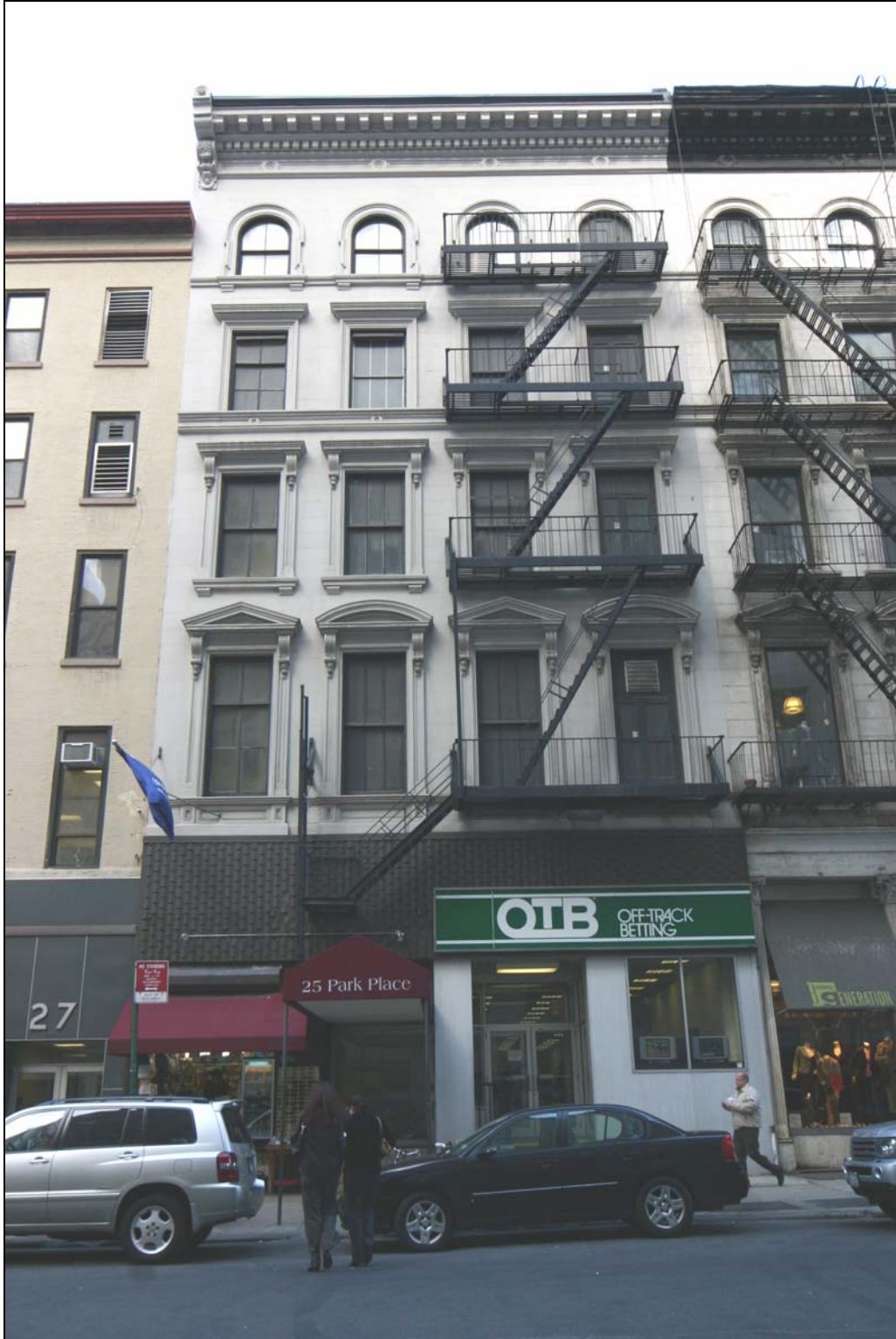
25 Park Place Building , Park Place elevation