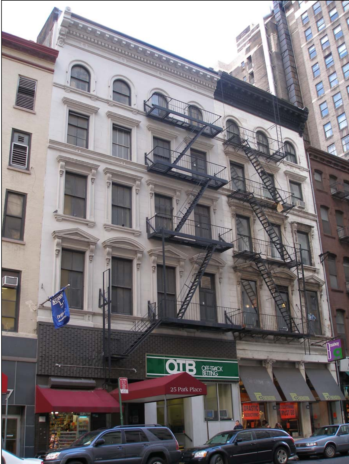
25 and 23 Park Place Buildings, Park Place elevations