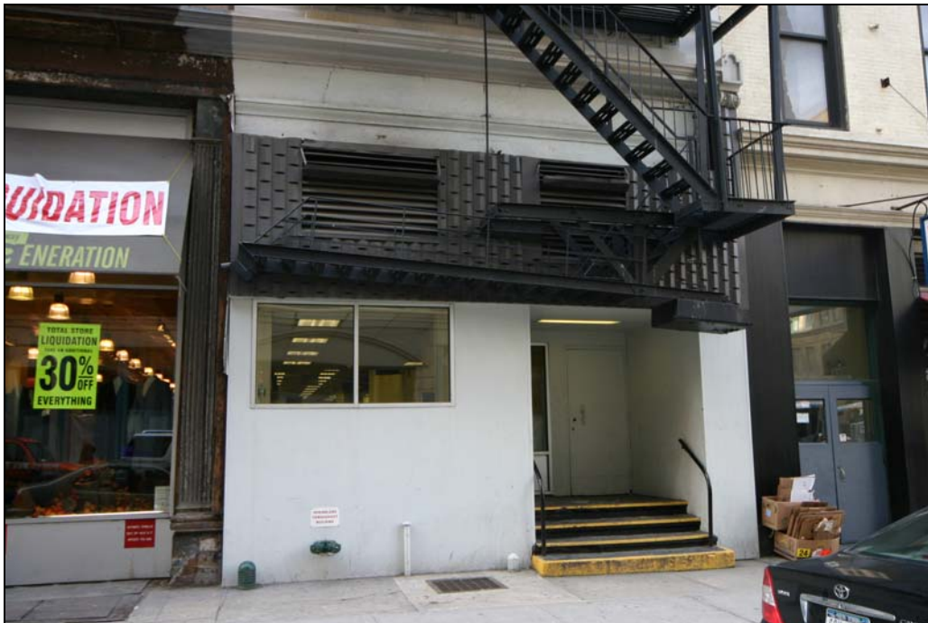
25 Park Place Building , 22 Murray Street elevation, ground floor