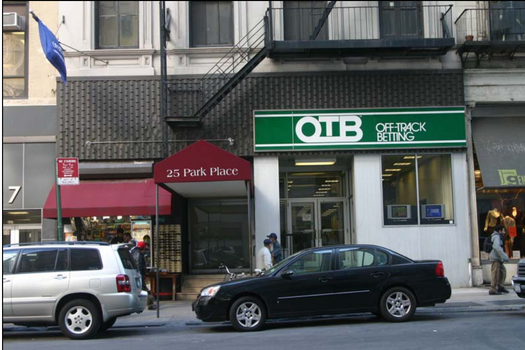
25 Park Place Building , ground floor