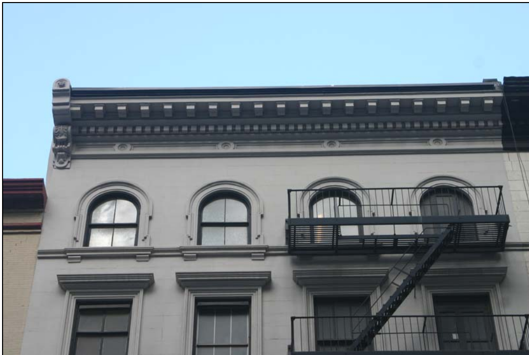
25 Park Place Building, details