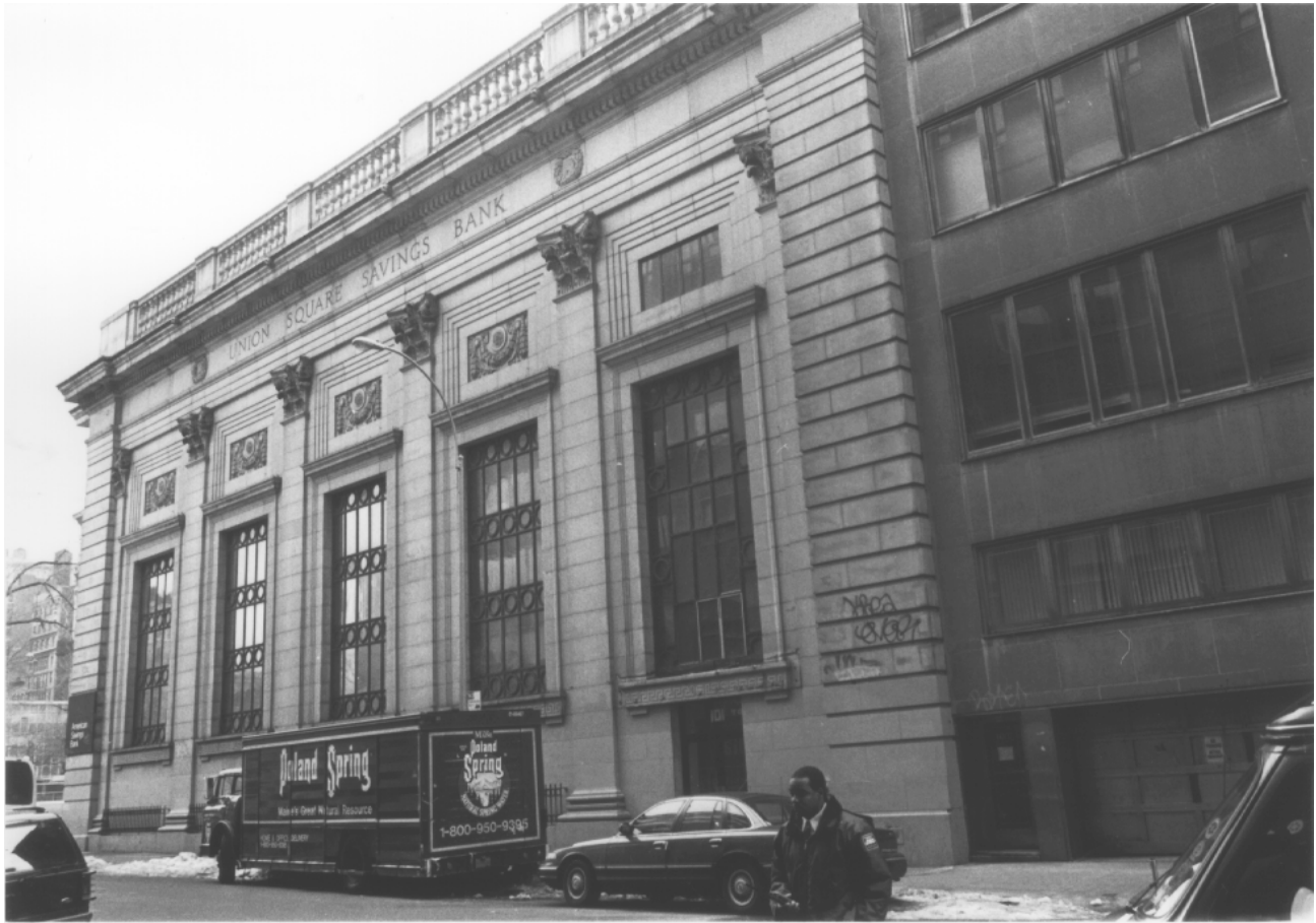
Union Square Savings Bank, 20 Union Square East, a/k/a 101-103 East 15th Street, Borough of Manhattan East 15th Street Facade