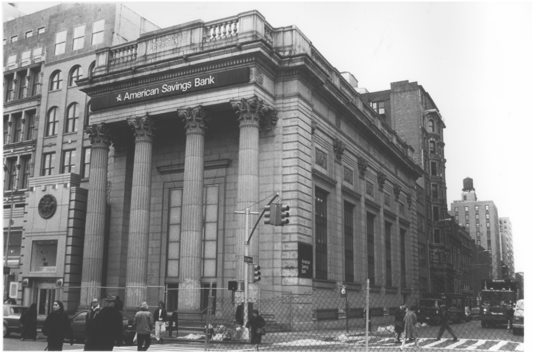
Union Square Savings Bank, 20 Union Square East, a/k/a 101-103 East 15th Street, Borough of Manhattan Photo: Carl Forster, February 1996