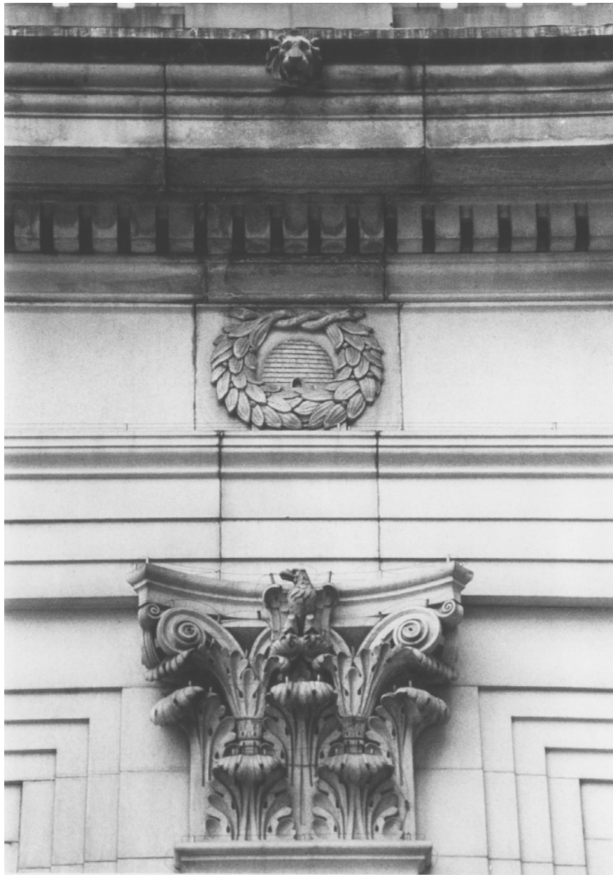
Union Square Savings Bank, 20 Union Square East, a/k/a 101-103 East 15th Street, Borough of Manhattan