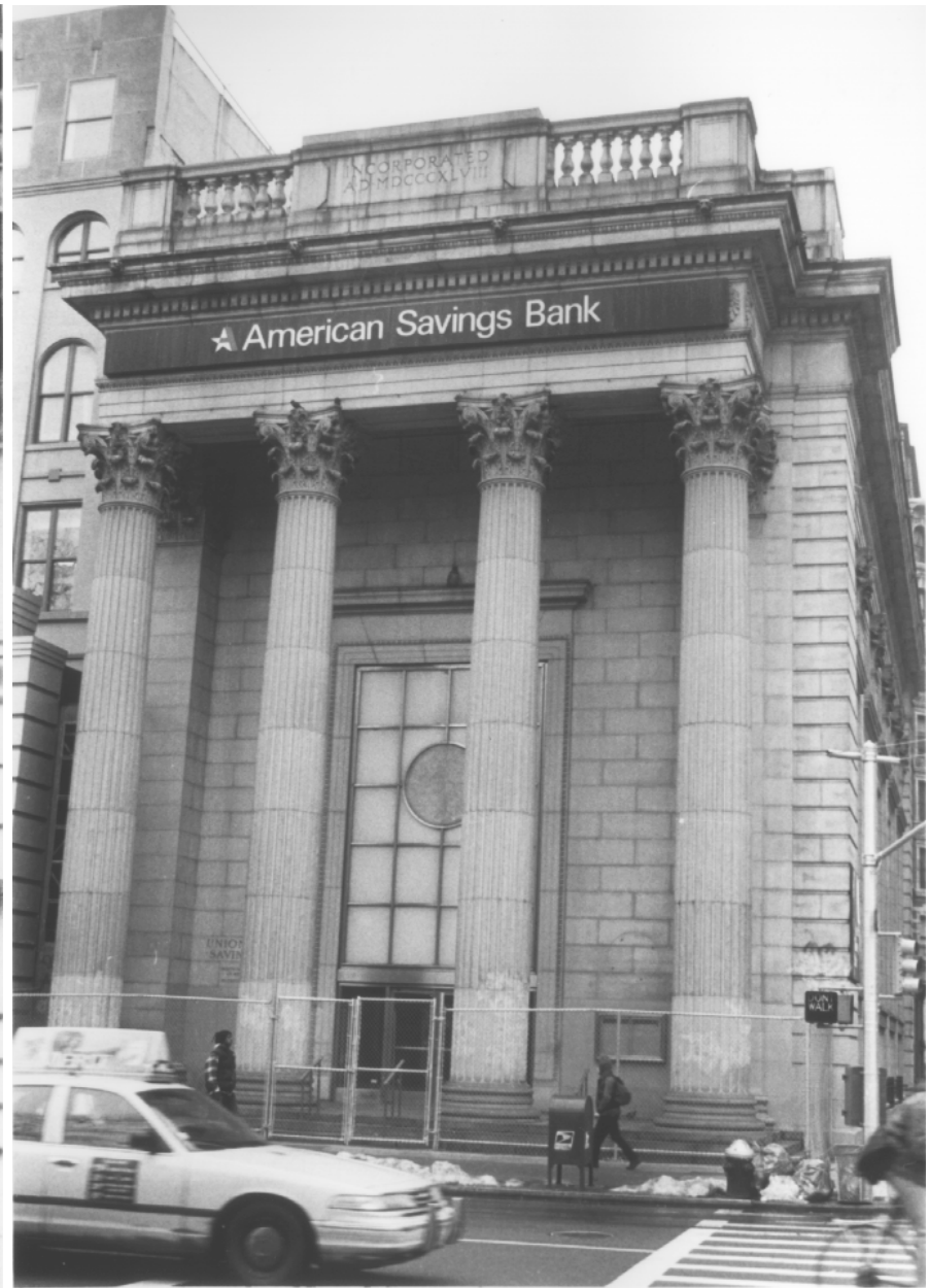
Union Square Savings Bank, 20 Union Square East, a/k/a 101-103 East 15th Street, Borough of Manhattan