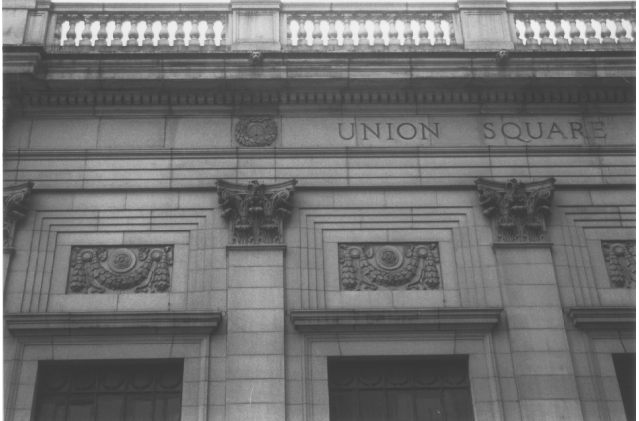
Union Square Savings Bank, 20 Union Square East, a/k/a 101-103 East 15th Street, Borough of Manhattan Detail of East 15th Street Facade